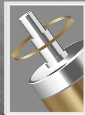
7200 RPM High Tech Permanent Magnet Motor