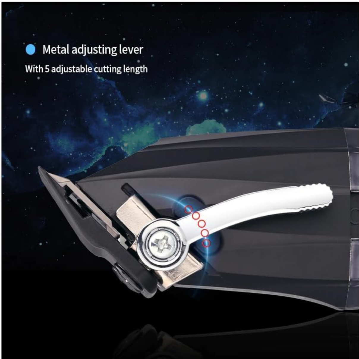
Image: The metal adjusting lever on the WMARK NG-222, which allows for 5 adjustable cutting lengths.