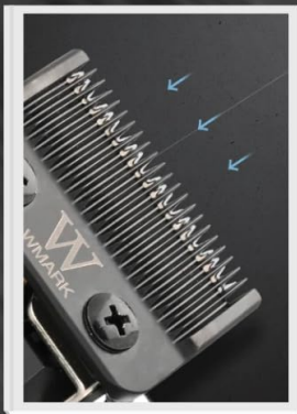
High Precision Chrome Blade