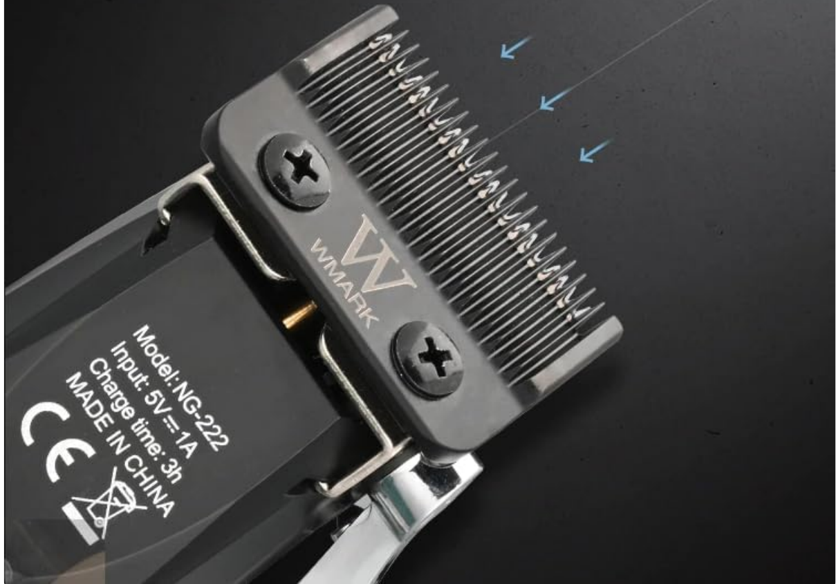
Image: Close-up of the WMARK NG-222 blades, illustrating the zero-overlap adjustment capability.