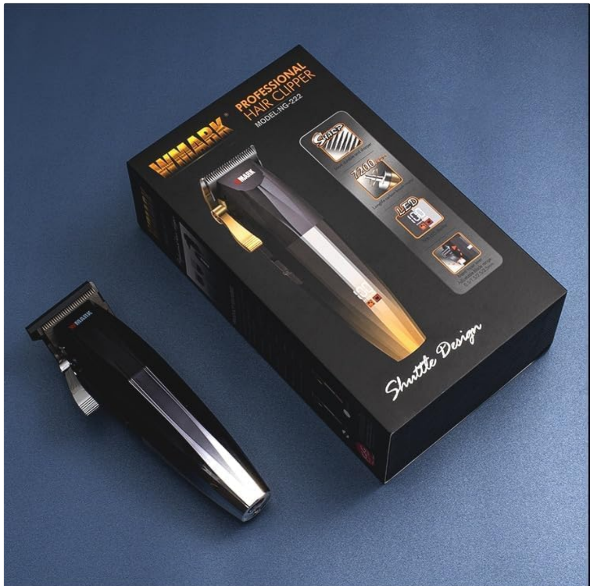
Image: WMARK NG-222 Hair Clipper and its retail packaging.