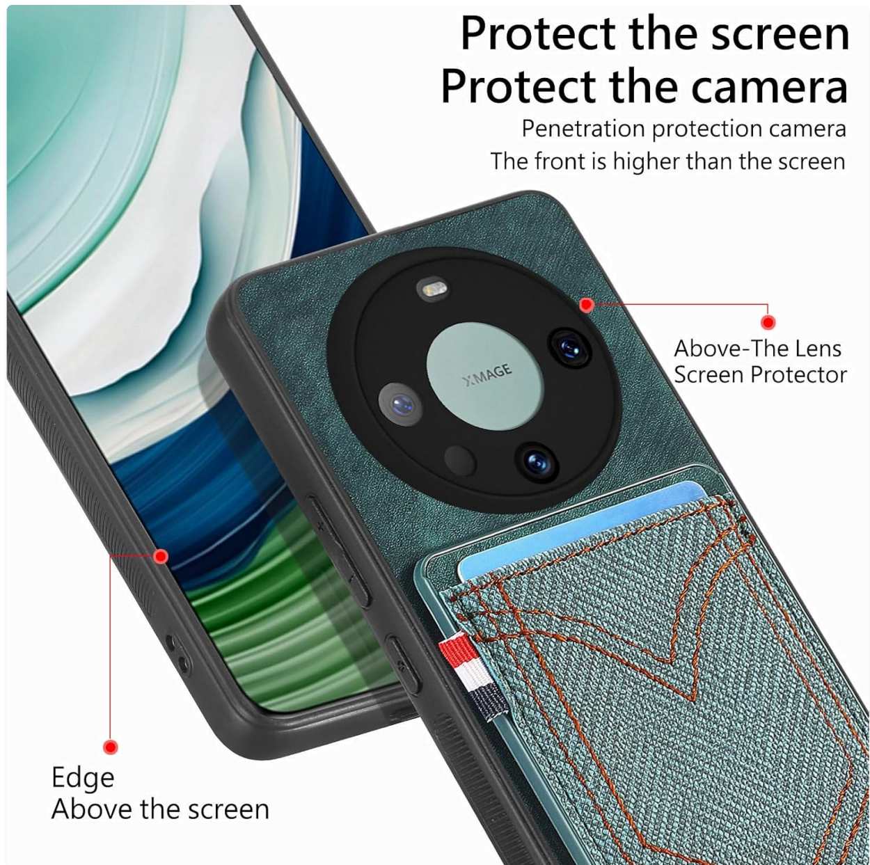
Image: Illustration highlighting the raised bezels for screen and camera protection.

Penetration protection camera The front is higher than the screen