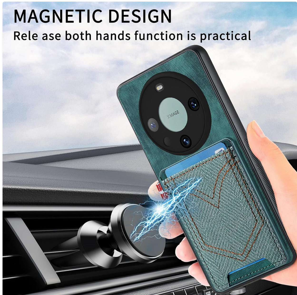
Image: The phone case demonstrating its magnetic attachment to a car mount.