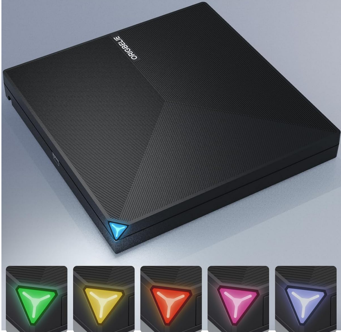
Figure 3.4: Close-up of the ORIGBELIE TP620 drive showing the RGB LED light changing colors.

Cool RGB LED indicator light that can cycle and gradually change colors