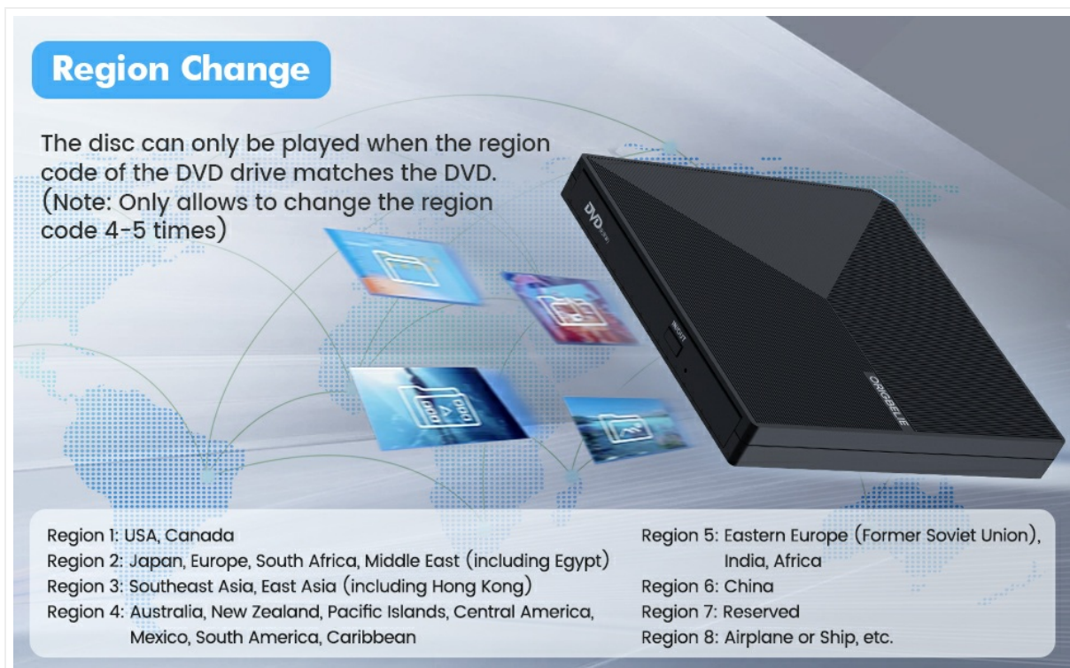
Figure 5.1: Diagram explaining DVD region codes and how they affect playback on the ORIGBELIE TP620 drive.

DVDs are often region-encoded. The disc can only be played when the region code of the DVD drive matches that of the DVD. The drive allows changing the region code approximately 4-5 times. Be aware that once the maximum changes are reached, the region code will be permanently set to the last selected region.