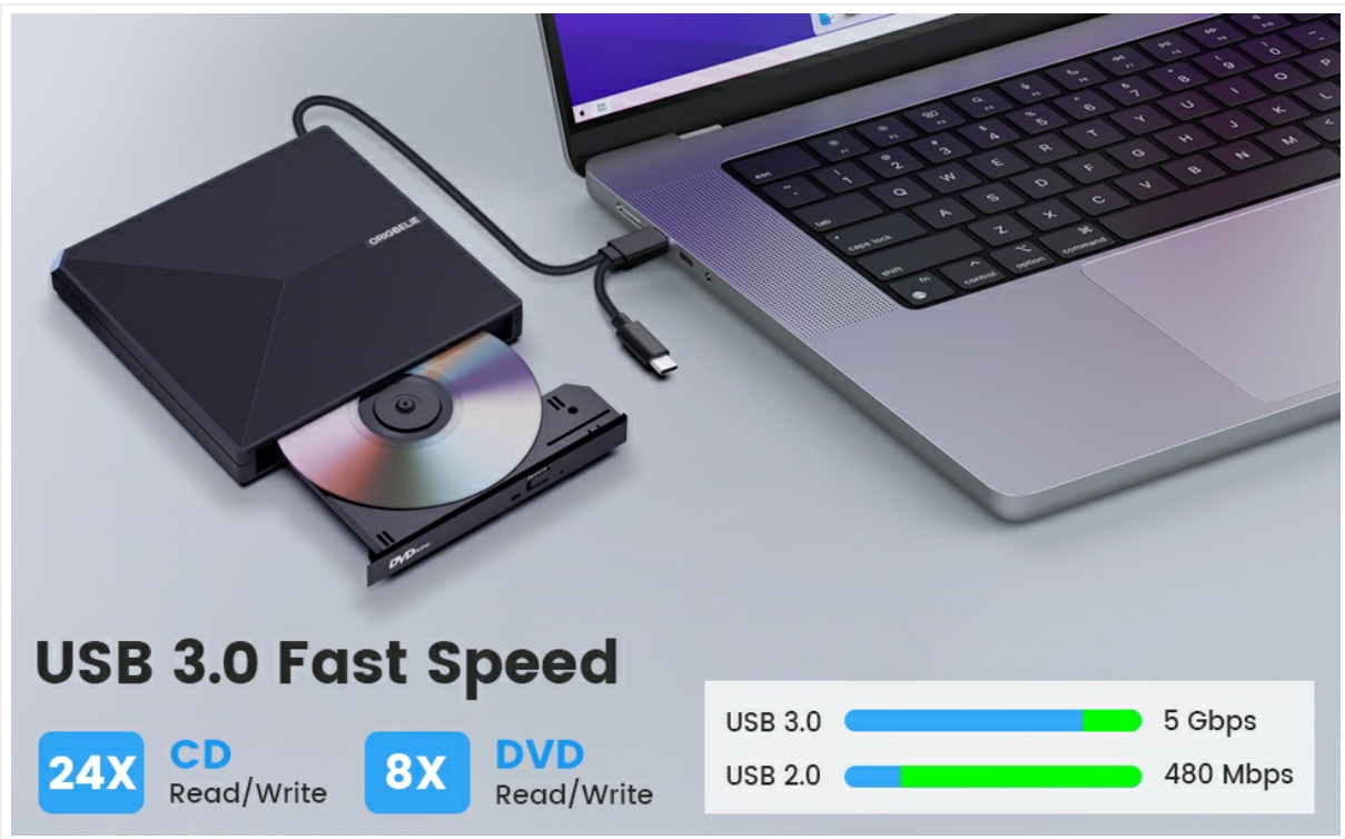
Figure 3.2: Illustration demonstrating the high-speed data transfer capabilities of the ORIGBELIE TP620 drive with USB 3.0 compared to USB 2.0.