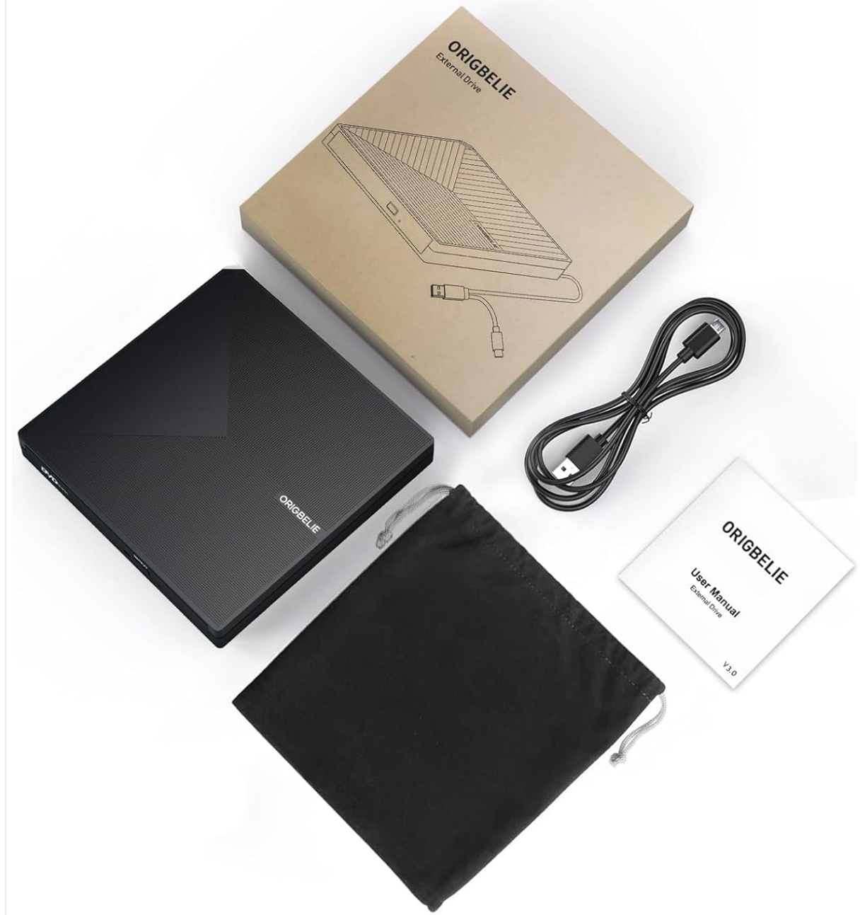
Figure 2.1: Contents of the ORIGBELIE TP620 package, including the drive, USB power cable, storage bag, and user manual.