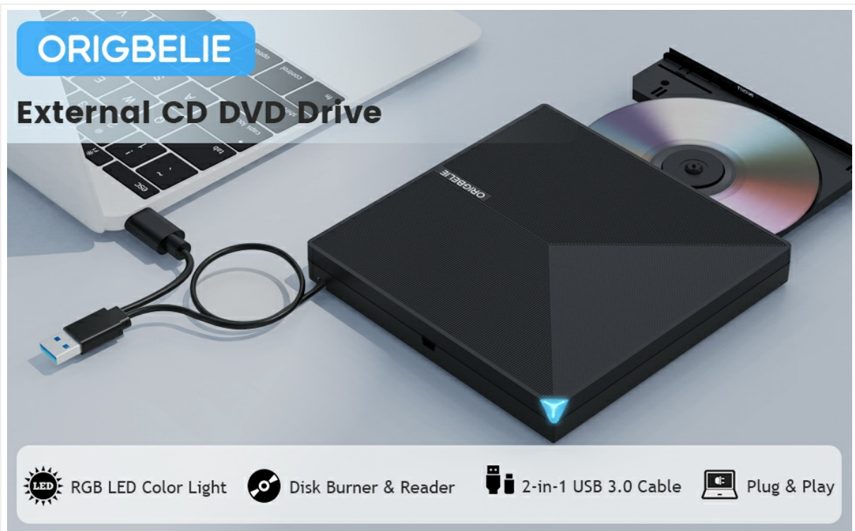
Figure 3.3: Image illustrating the wide compatibility of the ORIGBELIE TP620 drive with various operating systems and devices.