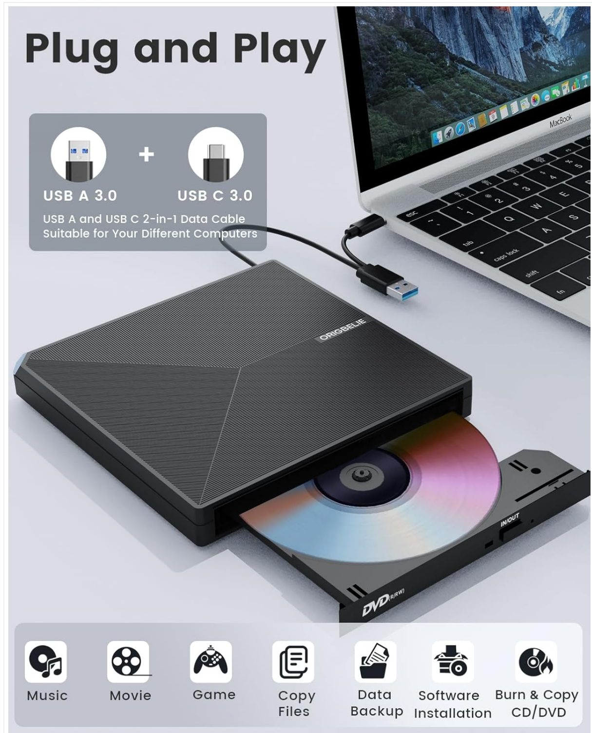
Figure 3.1: The ORIGBELIE TP620 drive with a disc inserted, highlighting the USB-A and USB-C 2-in-1 data cable for plug-and-play functionality.