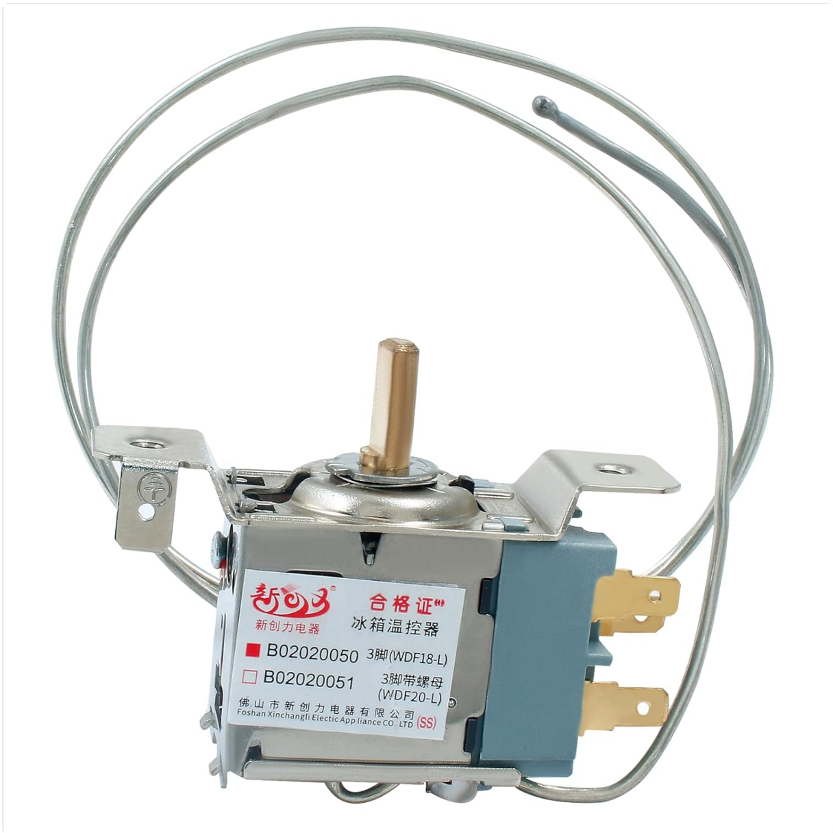
Figure 1: Luomorgo WDF-18 Refrigerator Thermostat. This image shows the overall view of the thermostat with its metallic body, control knob, and the long capillary tube.