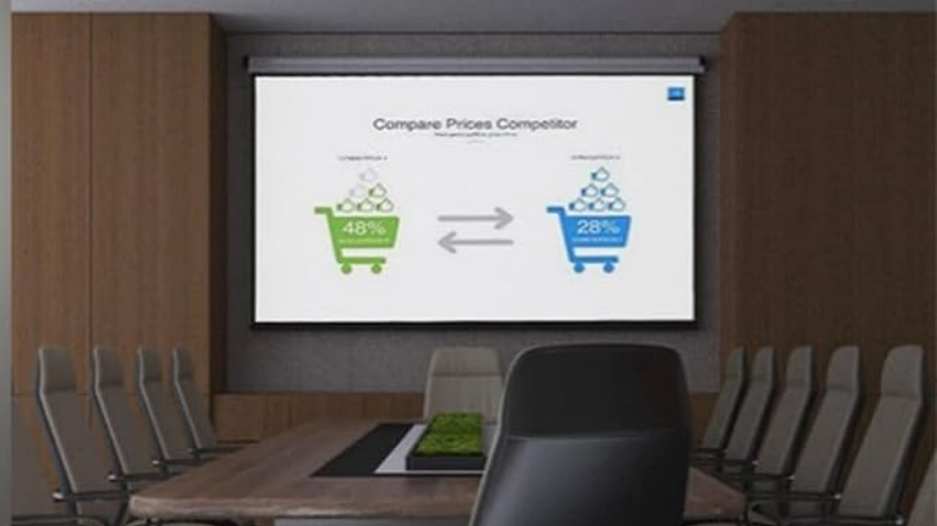
Image 7.3: The control panel allows one-key control for air conditioners, smart curtains, and intelligent projection equipment.