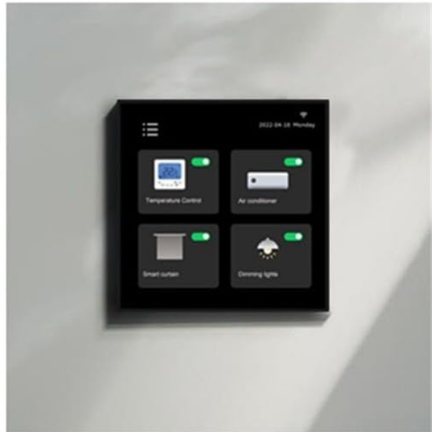
Image 7.2: Examples of smart device control, including automatic temperature adjustment for air conditioners and automatic lighting based on presence.