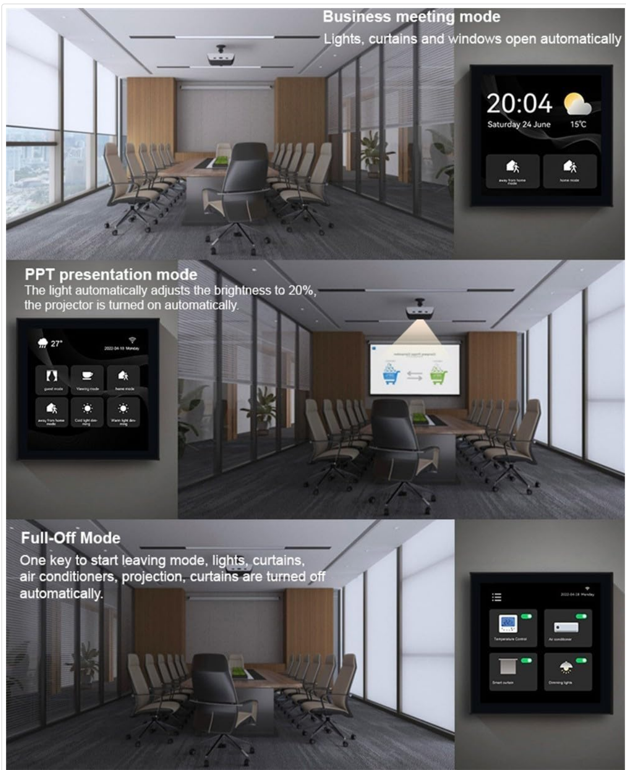
Image 7.5: The control panel supports various scene modes, such as "Business meeting mode" (lights/curtains open), "PPT presentation mode" (lights dim, projector on), and "Full-Off Mode" (all devices off).