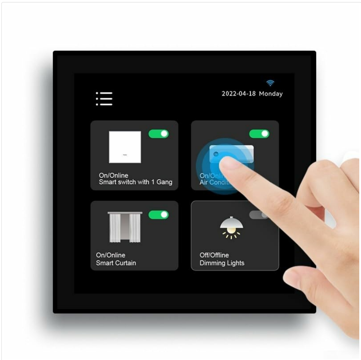
Image 2.1: Front view of the PETSTIBLE Smart Home Touch Screen Control Panel.