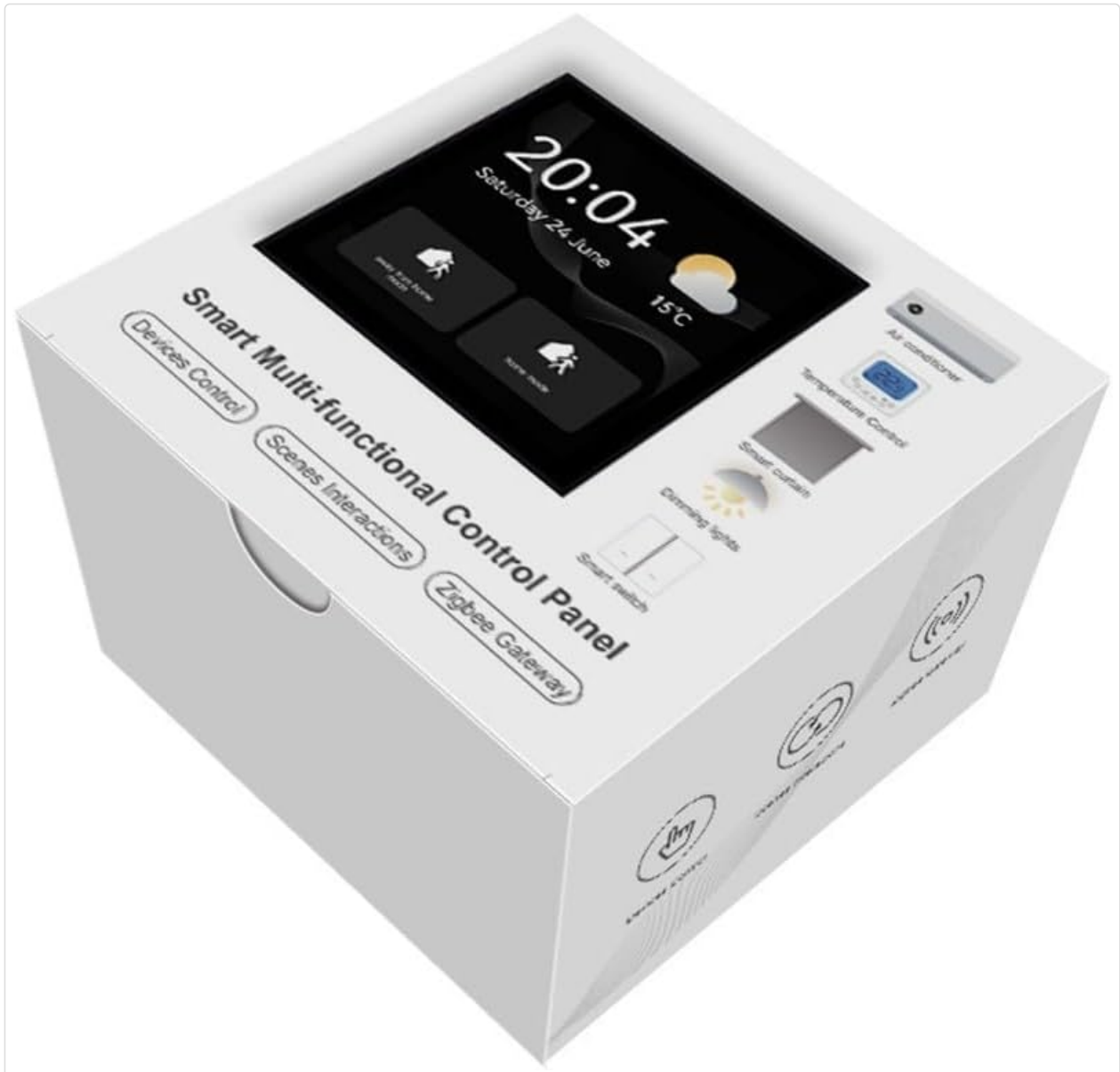
Image 3.1: The PETSTIBLE Smart Home Touch Screen Control Panel in its retail packaging.

Please check the package contents upon unboxing. If any items are missing or damaged, contact customer support immediately.