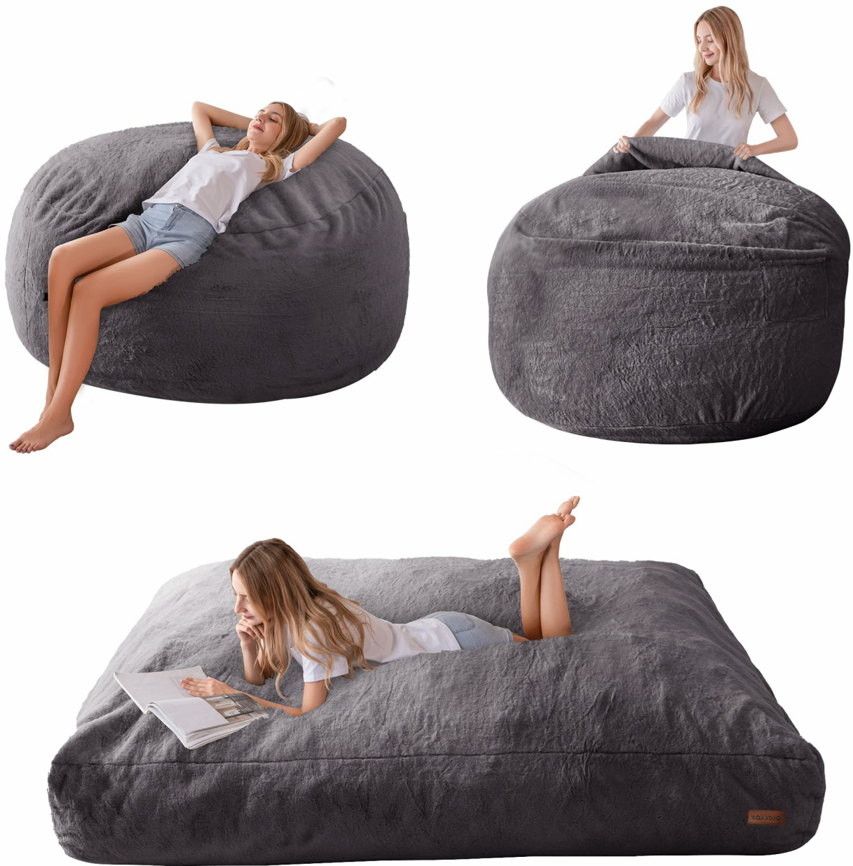
Image: The MAXYOYO Giant Bean Bag Chair in its chair configuration, providing comfortable seating.