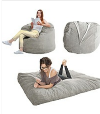
Image: Visual guide demonstrating the steps to convert the bean bag from chair to bed.

To convert it back to a chair, simply fold the mattress and slide it back into the outer cover, then zip it up.