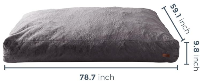
Image: Detailed product size specifications for various configurations.