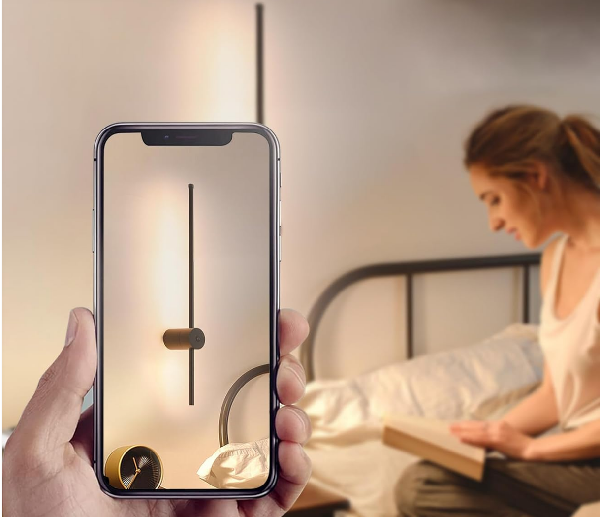
Image: Examples of the Aanyhoh LED Wall Lamp installed in different interior spaces, demonstrating its versatile application.

Flicker free light to avoid fatigue or strain