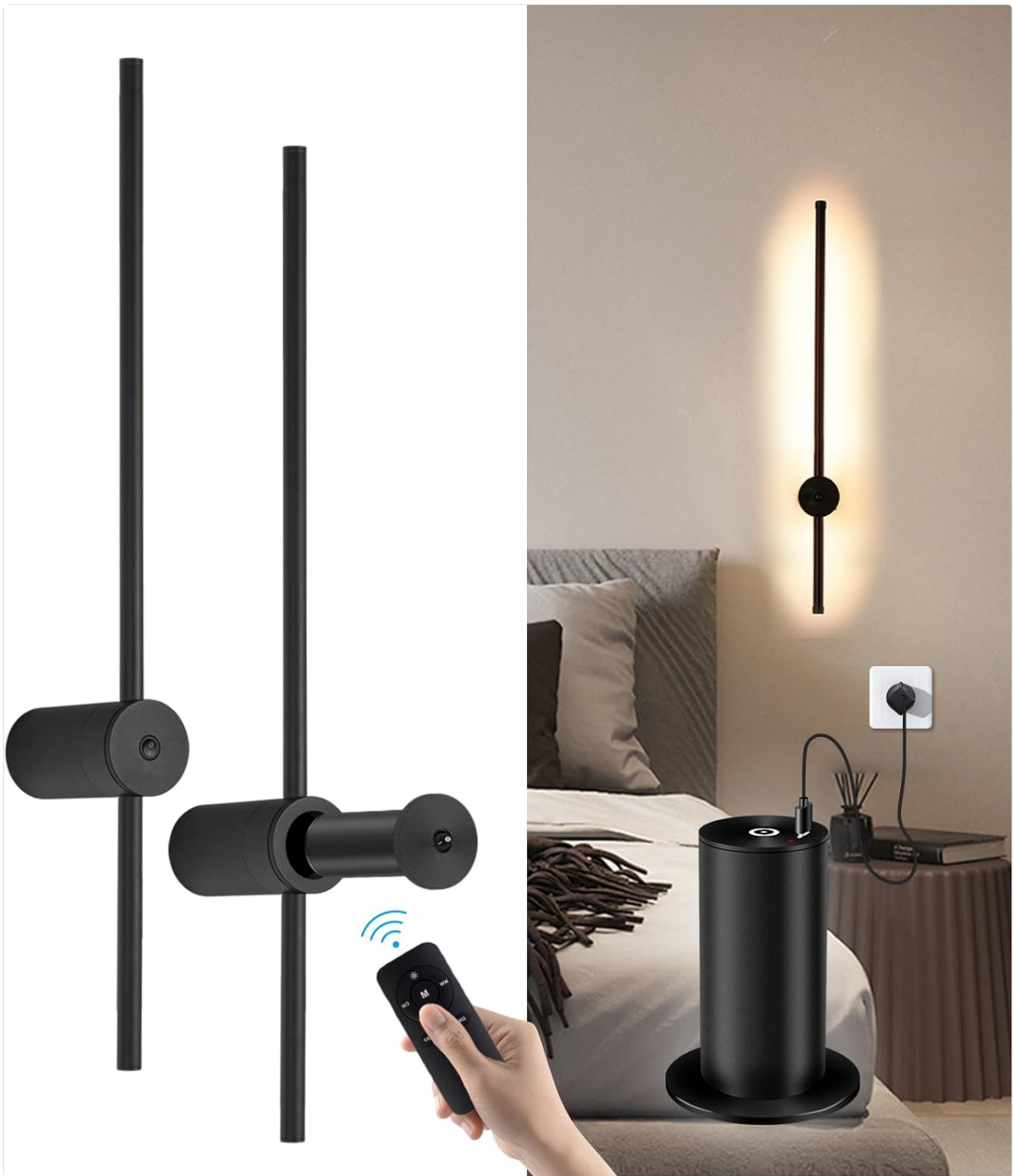
Image: Overview of the Aanyhoh LED Wall Lamp, showing its main components and an example of it installed in a bedroom setting.