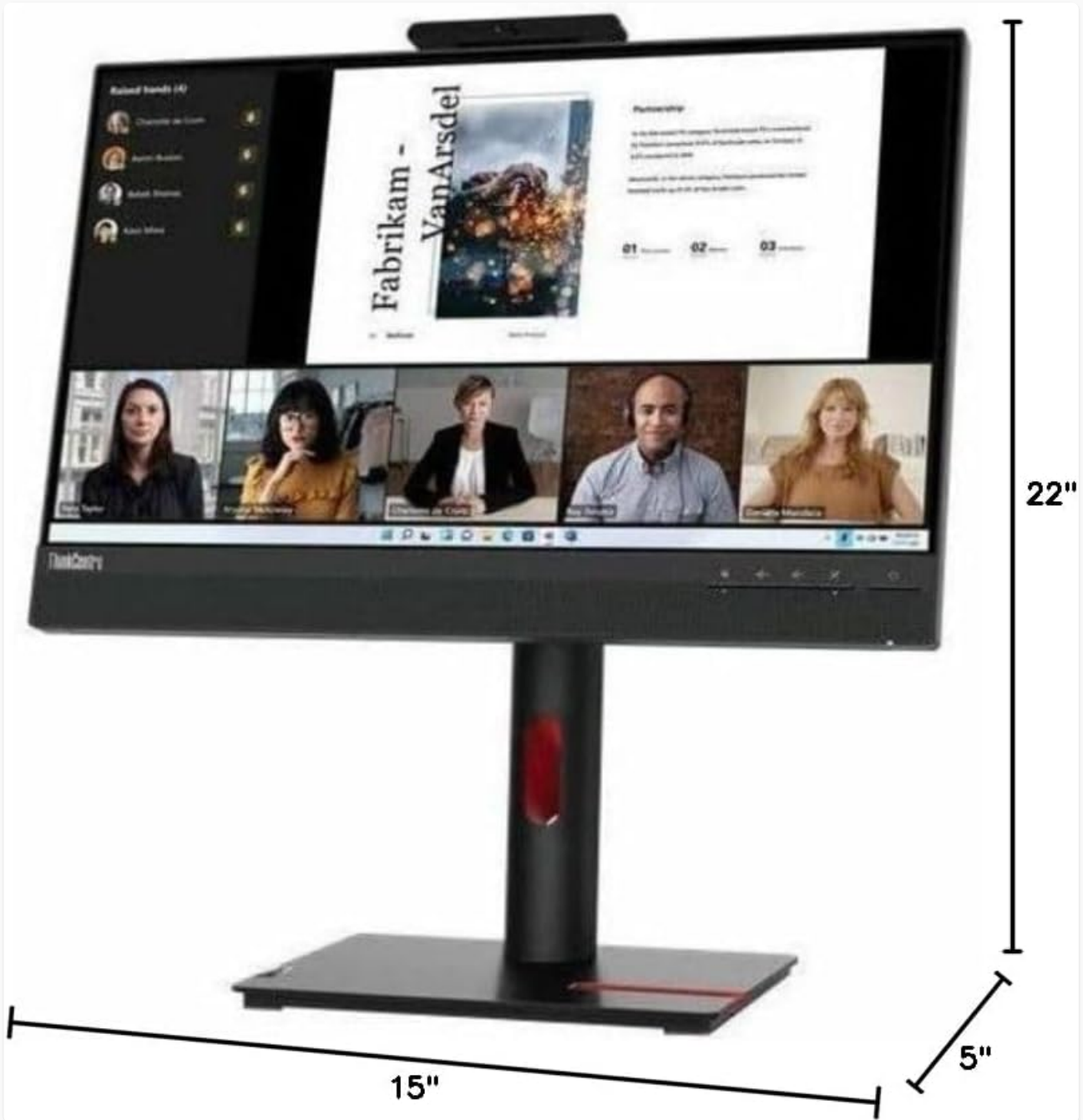
Figure 3: Monitor dimensions for planning workspace integration.