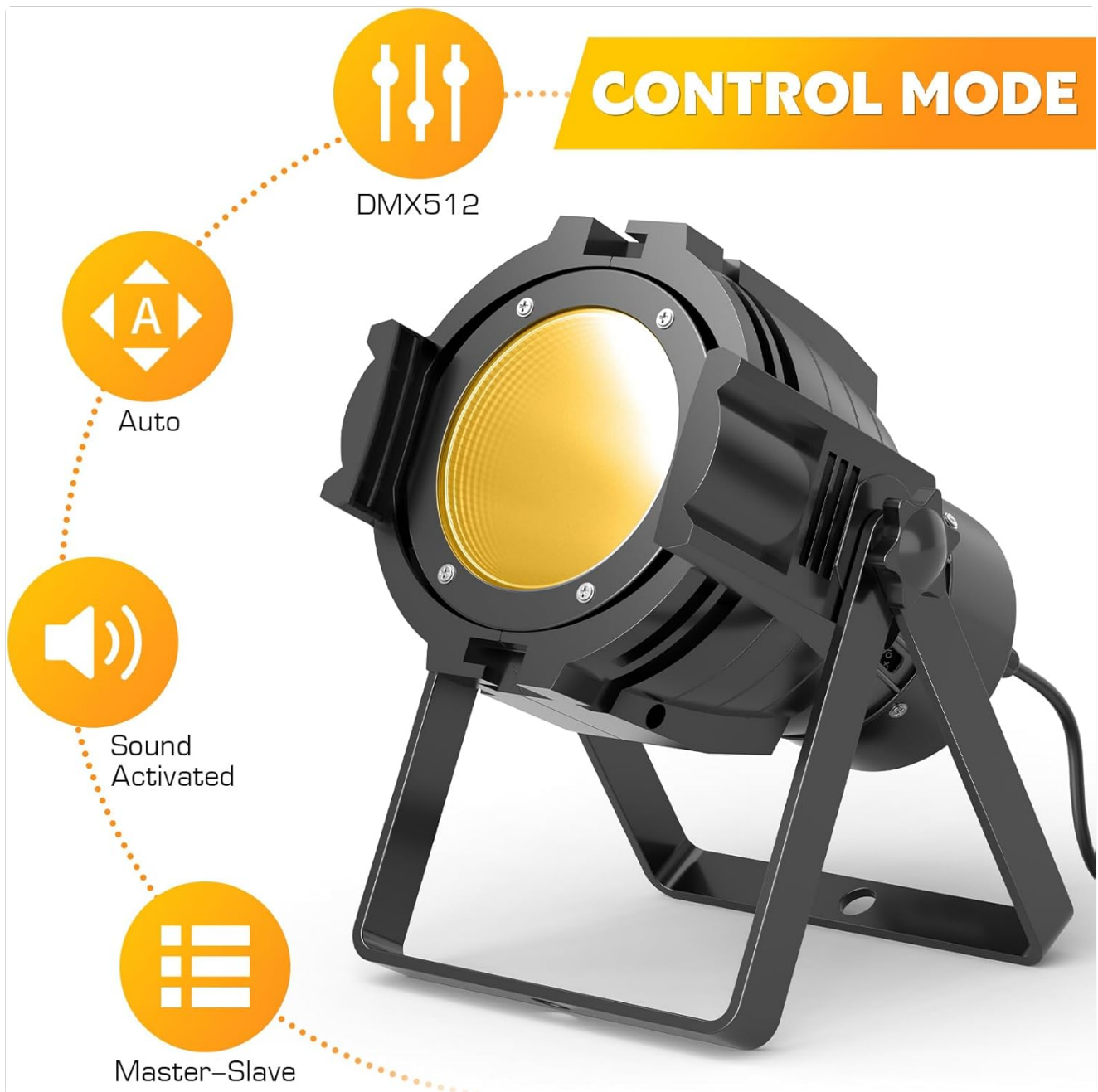
Image: Visual representation of the different control modes available for the stage light.

Video: A short demonstration of the HOLDLAMP Spotlight COB 80W Stage Light in a party setting, showcasing its dynamic lighting effects and color changes. This video highlights the light's ability to create an engaging atmosphere.