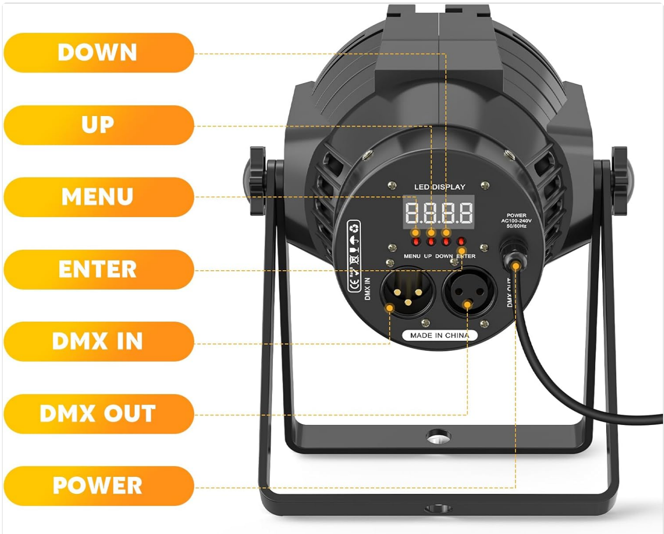
Image: Rear panel connections and control interface, including DMX In/Out and Power In/Out ports.

For DMX control, connect a DMX cable from your DMX controller to the 'DMX IN' port on the first fixture. To link multiple fixtures, connect a DMX cable from the 'DMX OUT' port of the first fixture to the 'DMX IN' port of the next fixture in the chain.