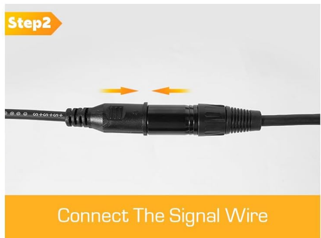
Image: Step-by-step guide for connecting multiple lights using signal wires for synchronized operation.

Video: Demonstration of the HOLDLAMP Spotlight COB 80W Stage Light, including DMX control capabilities and various lighting effects. This video illustrates how to set up and utilize the DMX functionality for professional lighting control.