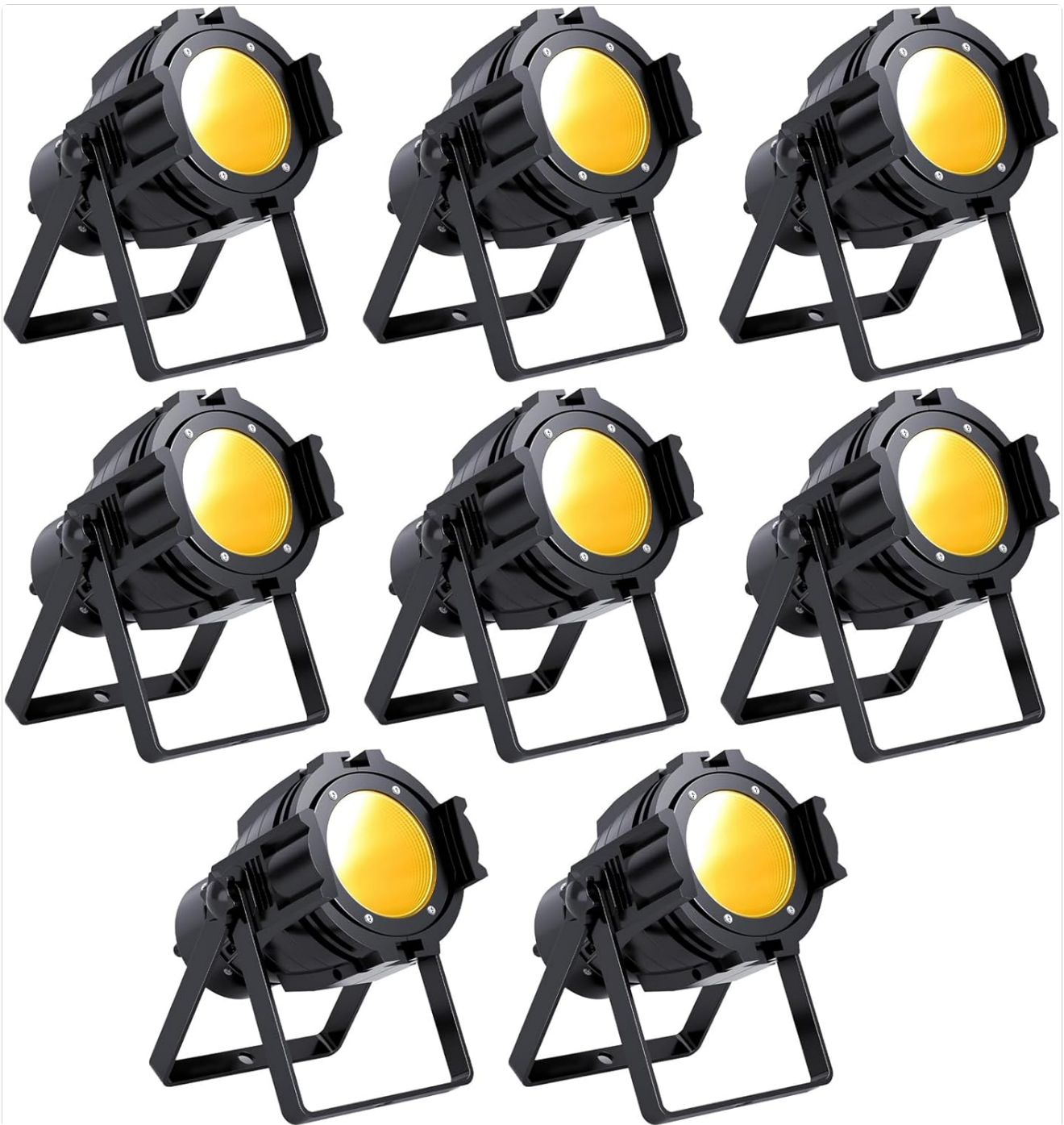
Image: HOLDLAMP Spotlight COB 80W Stage Light, showcasing its compact design and adjustable bracket.