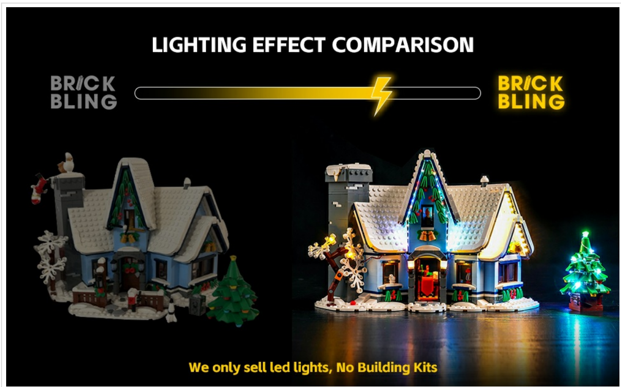
Figure 4: Interior lighting of the LEGO Santa's Visit 10293, highlighting the dining area.

Your browser does not support the video tag.