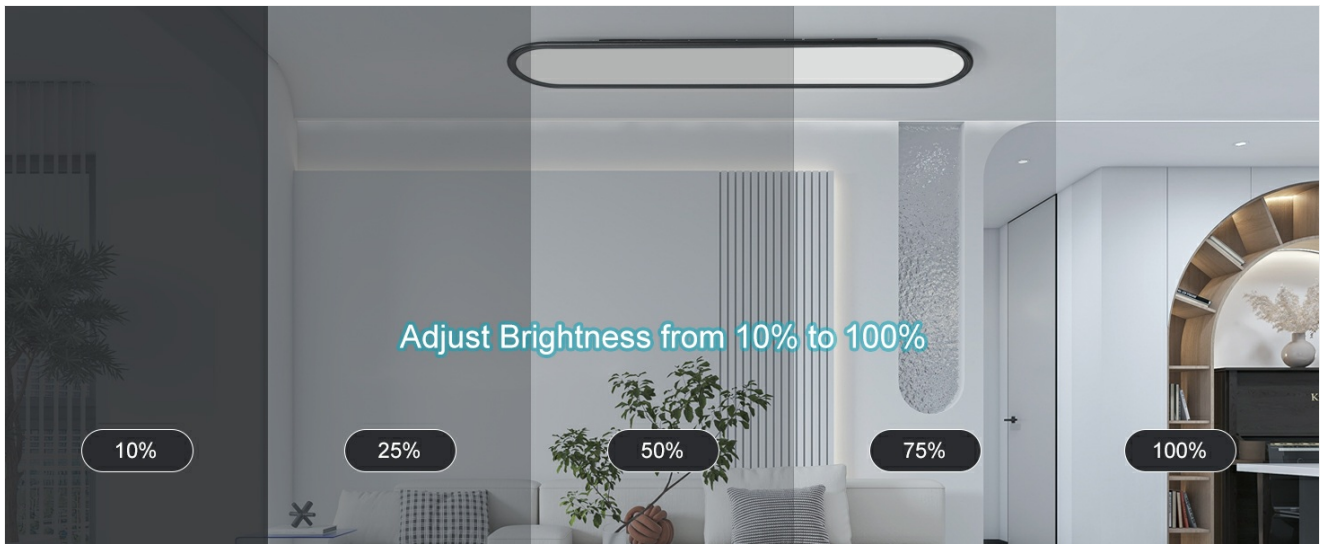
Image: Illustrates the brightness adjustment from 10% to 100% using the remote control.