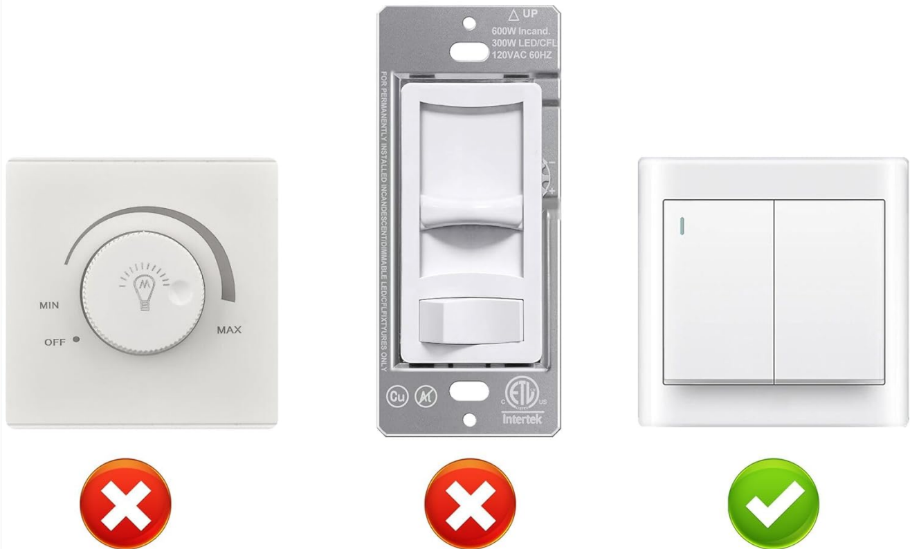
Image: Visual warning indicating that the light fixture is not compatible with dimmer switches and should only be used with a regular on/off switch.

This light fixture is not compatible with dimmer switches - using one may cause flickering. Please use a standard wall switch instead. For dimming functionality, please use the included remote control. Thank you!