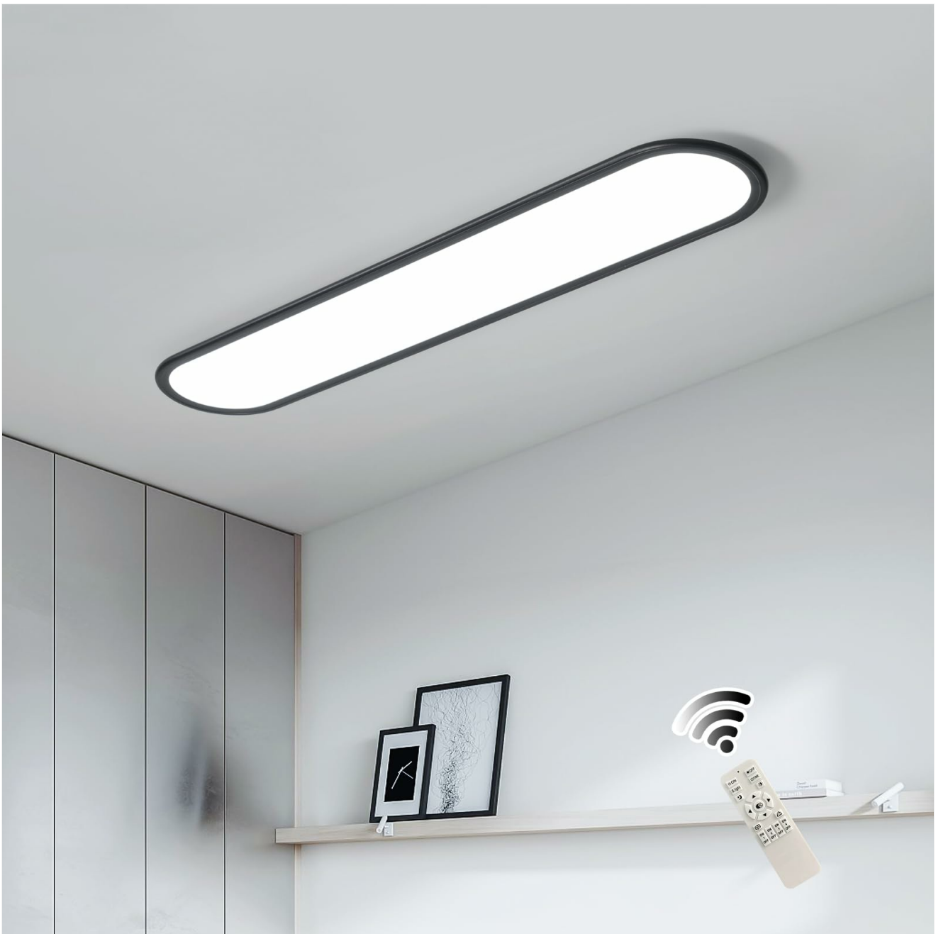
Image: The Ganeed Modern Linear Ceiling Light, showcasing its sleek, low-profile design.