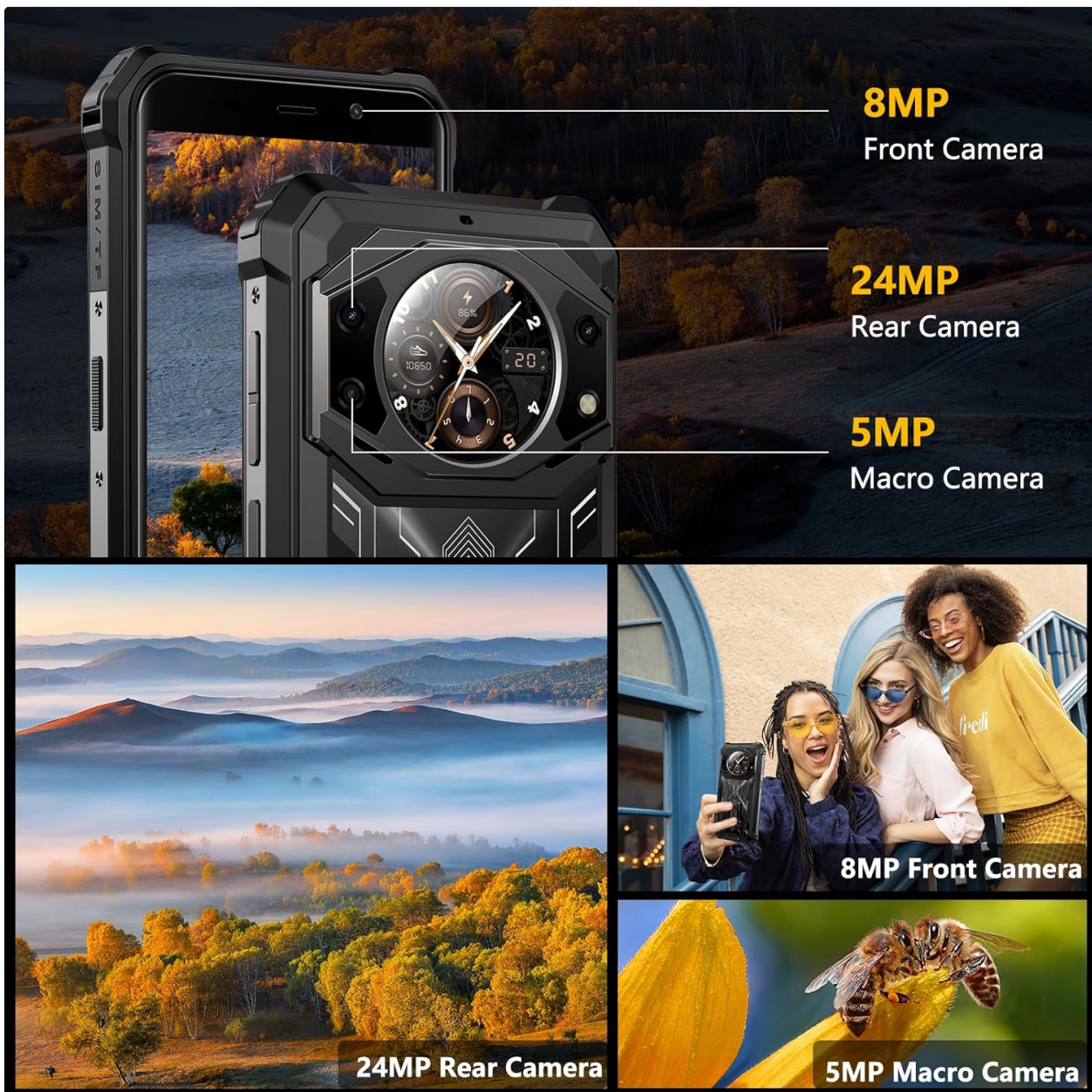
Figure 6: Triple camera system and HD+ display.