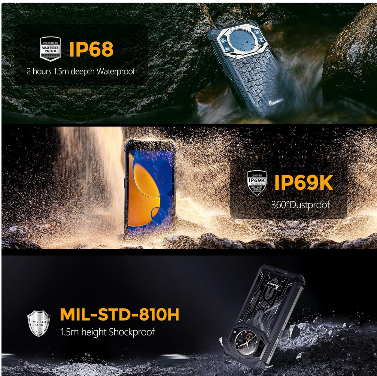
Figure 8: IP68/IP69K waterproof, dustproof, and MIL-STD-810G drop resistance.

Your FOSSIBOT F101 Pro is certified IP68 and IP69K, meaning it is highly resistant to water and dust ingress. It can withstand submersion in 1.5 meters of water for up to 2 hours. Additionally, it meets MIL-STD-810G standards for drop resistance, capable of surviving drops from 1.5 meters. The robust construction protects the device from harsh conditions and impacts.