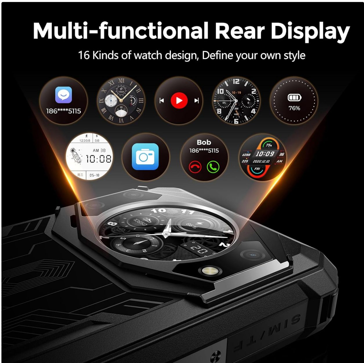
Figure 4: Multi-functional rear display with various watch designs.

The FOSSIBOT F101 Pro features an innovative 1.32-inch rear display. This secondary screen provides quick access to essential information and functions without needing to activate the main display. You can view notifications, incoming calls, time, compass readings, music controls, and even use it for selfies with the rear camera. There are 16 customizable watch designs available for the rear display.