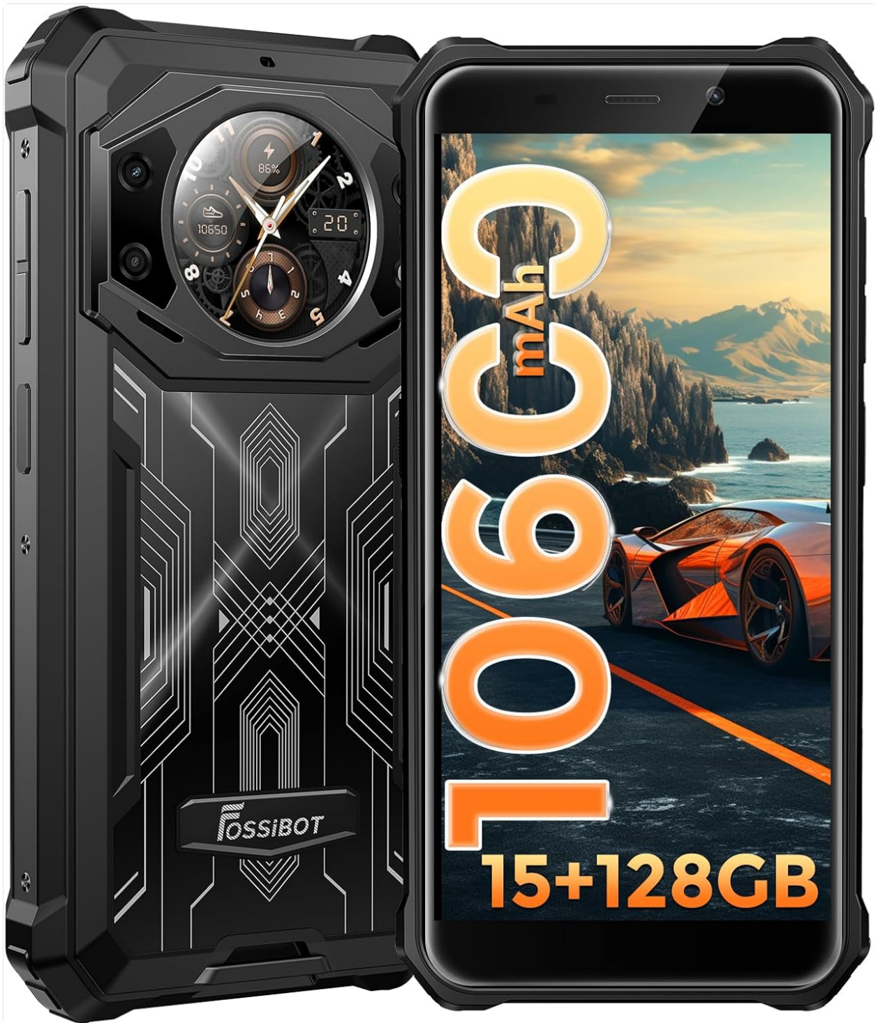
Figure 1: Contents of the FOSSIBOT F101 Pro retail package.