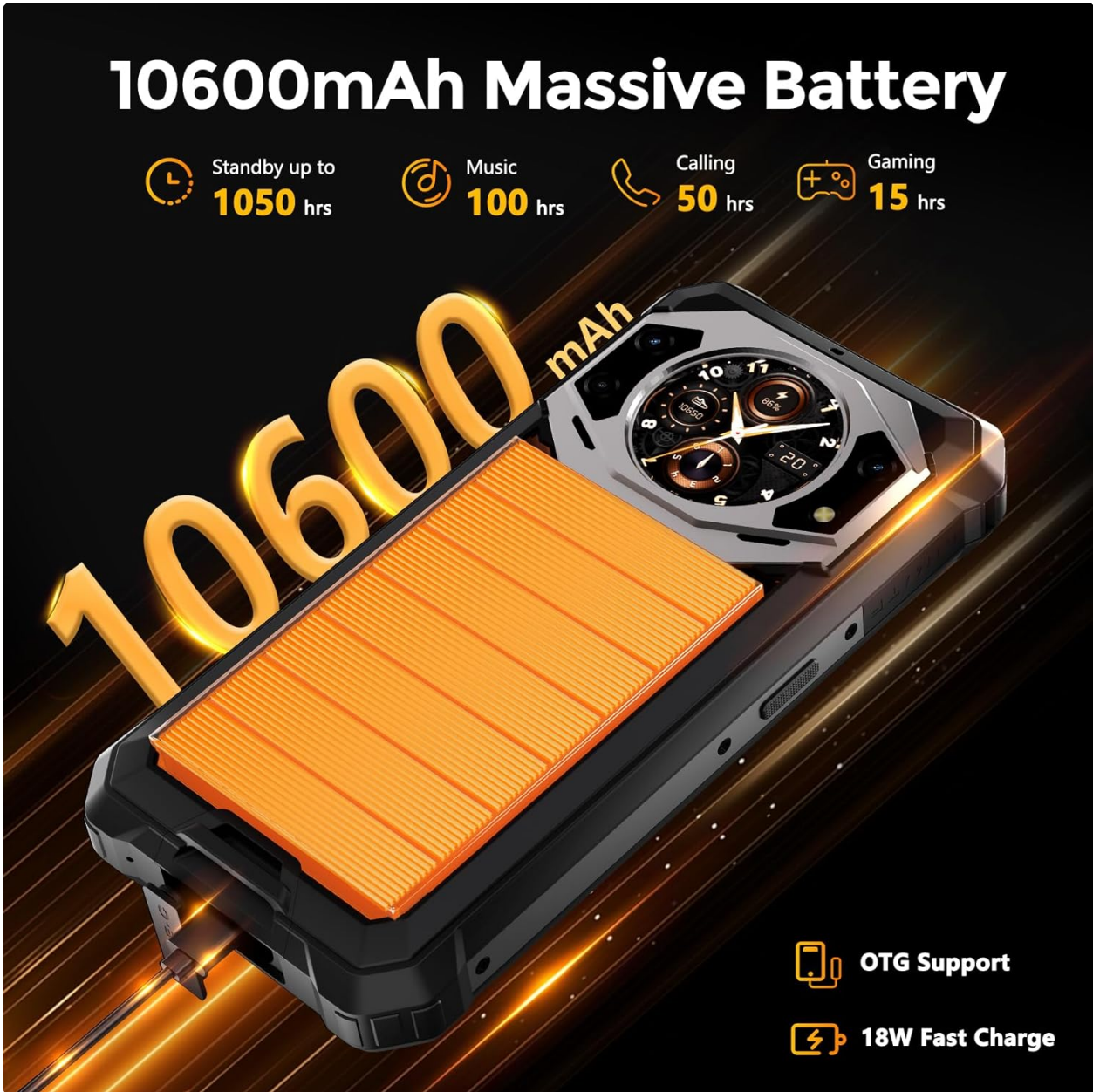
Figure 2: Charging the FOSSIBOT F101 Pro, highlighting its large battery and fast charging.