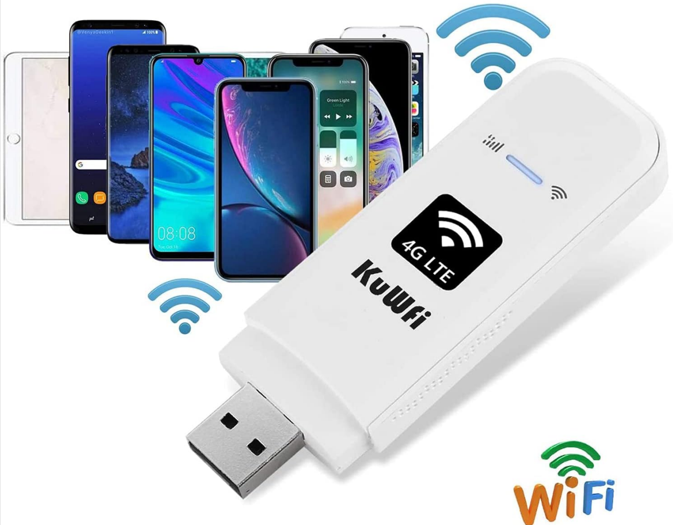
Image: The KuWFi modem providing Wi-Fi connectivity to a range of mobile devices, illustrating its multi-device support.