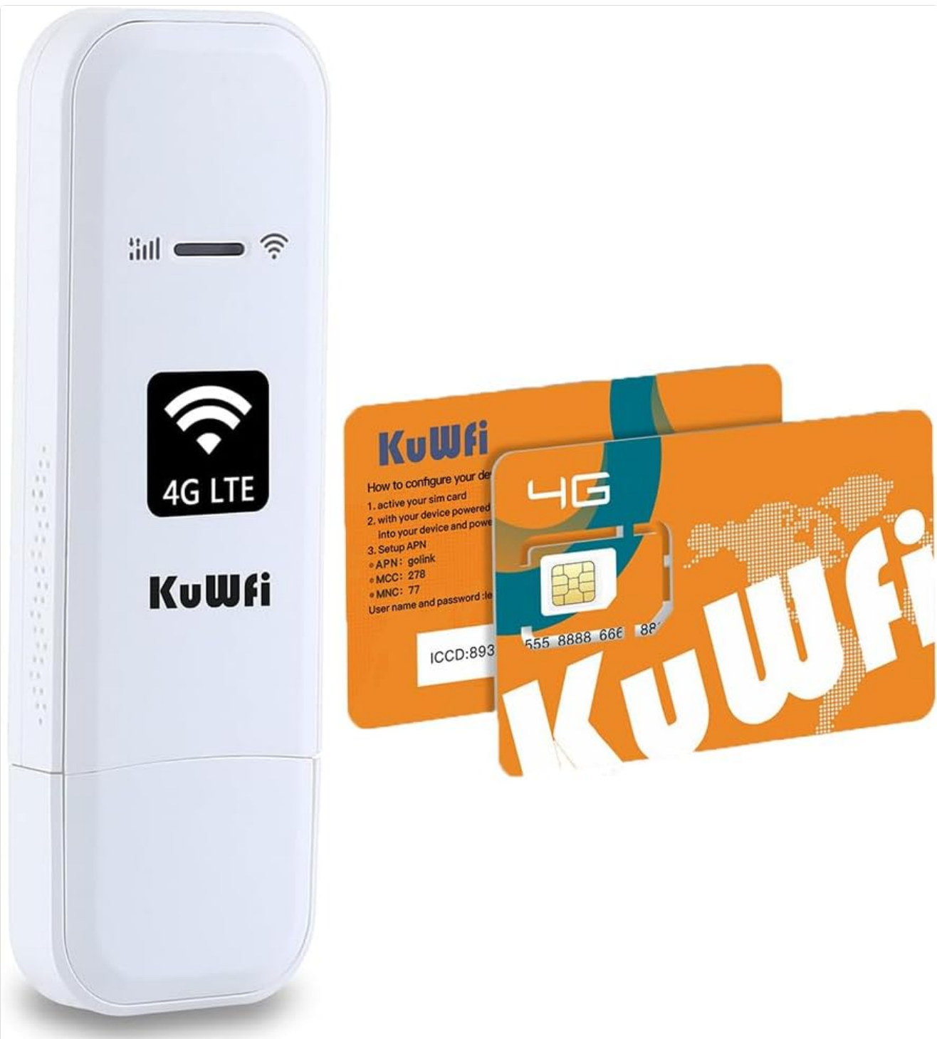
Image: The KuWfi 4G LTE USB WiFi Modem and the included 2GB Prepaid 4G LTE SIM Card, as packaged.