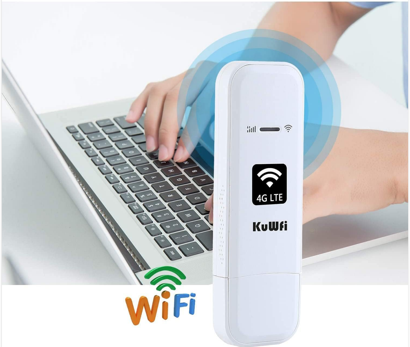
Image: The KuWFi USB modem inserted into the USB port of a laptop, indicating it is ready for use.