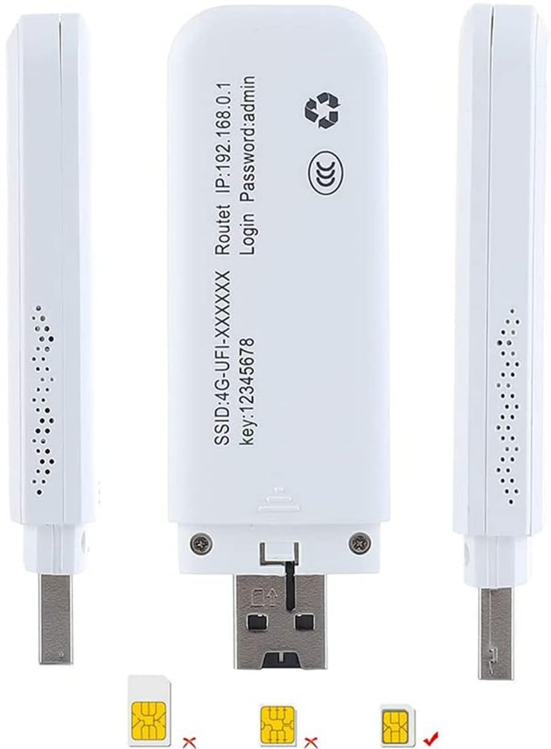
Image: A close-up of the KuWFi modem's label, displaying the default Wi-Fi network name (SSID) and password for connection.