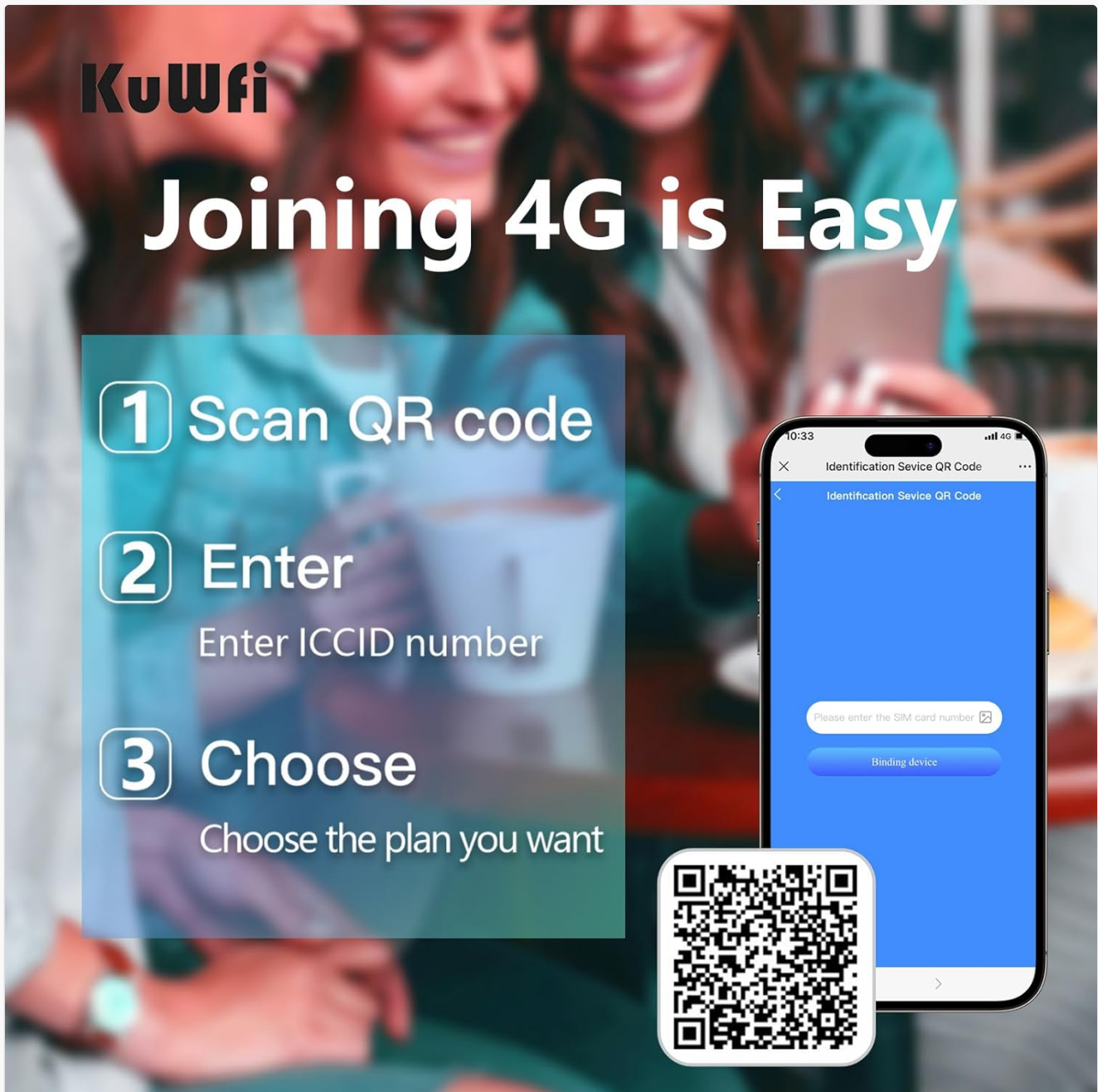
Image: A visual guide showing the three steps for activating the 4G SIM card: scanning a QR code, entering the ICCID number, and selecting a data plan.

For direct activation, visit: https://shop.gloableconnect.com/sim/#/?channelCode=TGT_SZKWEU