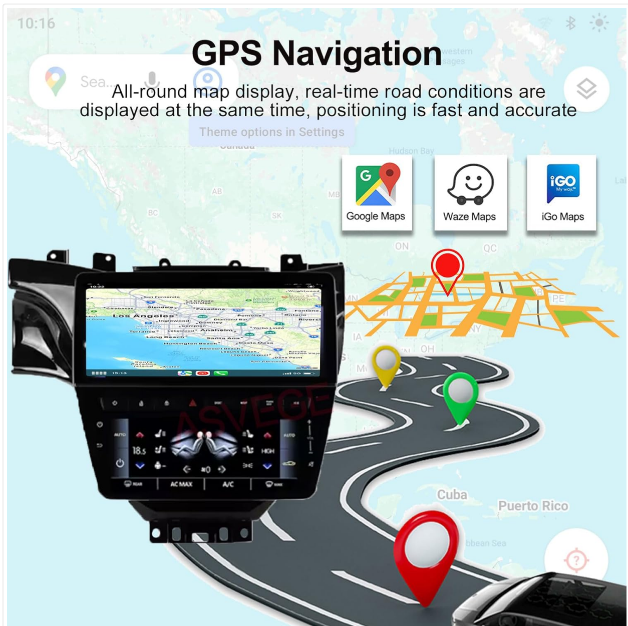
Image: The GPS Navigation interface is displayed, showing a map with a route and icons for Google Maps, Waze Maps, and iGo Maps. This illustrates the unit's navigation capabilities.

The unit features built-in GPS for navigation. Access the navigation application from the main menu. You can use pre-installed maps or download your preferred navigation apps like Google Maps, Waze, or iGo Maps from the Play Store.