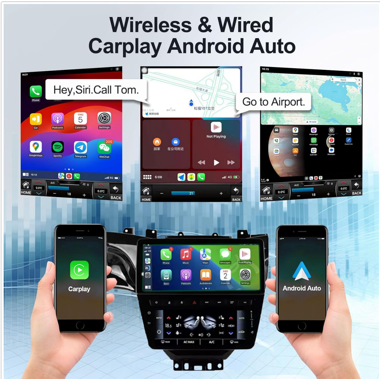
Image: This image shows the car radio displaying both Wireless & Wired CarPlay and Android Auto interfaces. Two smartphones are shown, one connected to CarPlay and the other to Android Auto, demonstrating the seamless integration of mobile devices.

Connect your smartphone via Bluetooth for wireless CarPlay/Android Auto or use a wired USB connection. This feature mirrors your phone's interface to the car radio, allowing access to calls, messages, music, and navigation apps directly from the unit.