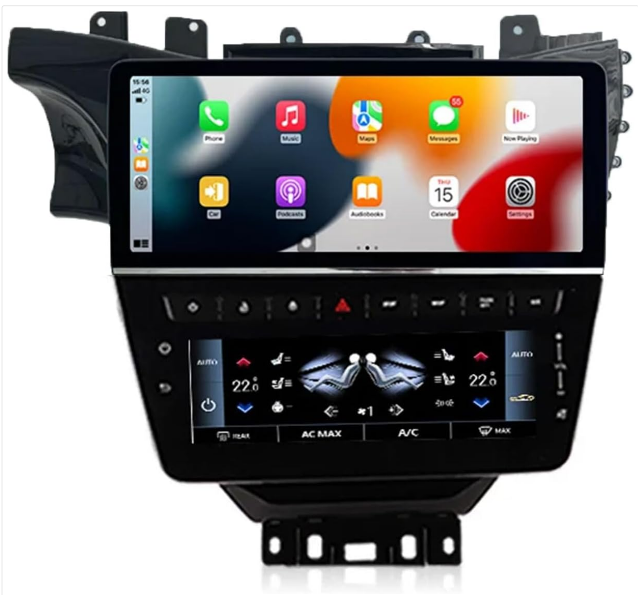
Image: The ASVEGE 12.3 Inch Android 12 Car Radio unit, showing its components and a comparison of the car's dashboard before and after the new unit is installed. The new unit integrates seamlessly into the Maserati GT/GC Gran Turismo dashboard.

Connect all cables according to the provided wiring diagram. Ensure secure connections for power, speakers, GPS antenna, and USB ports.