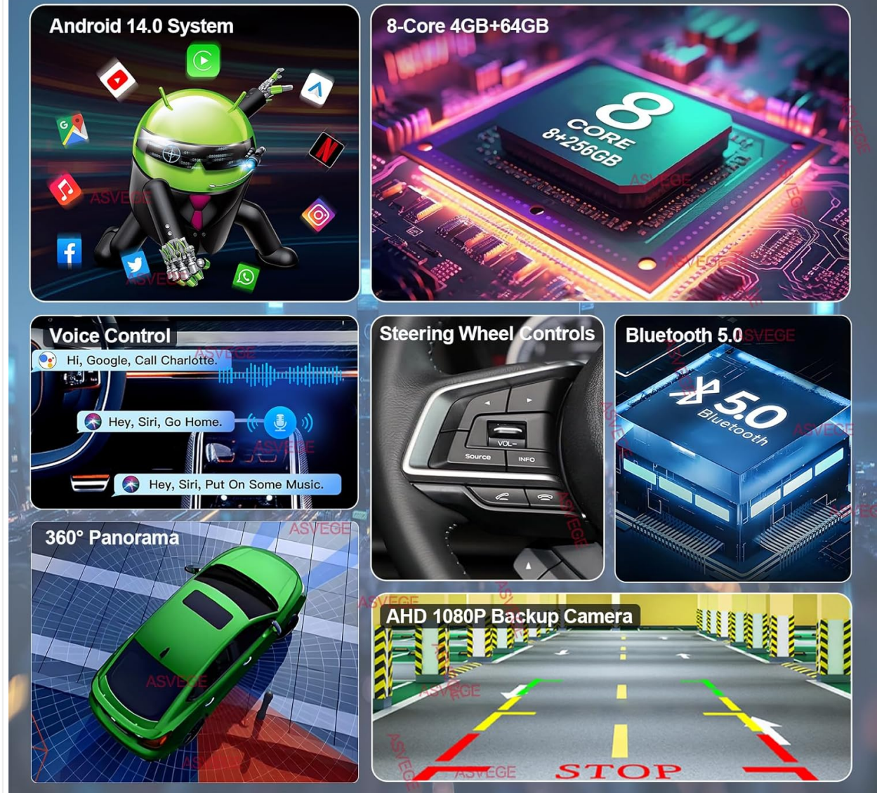
Image: This image highlights multiple multimedia features of the car radio, including voice control, integration with steering wheel controls, a 360-degree panoramic view, and AHD 1080P backup camera support.