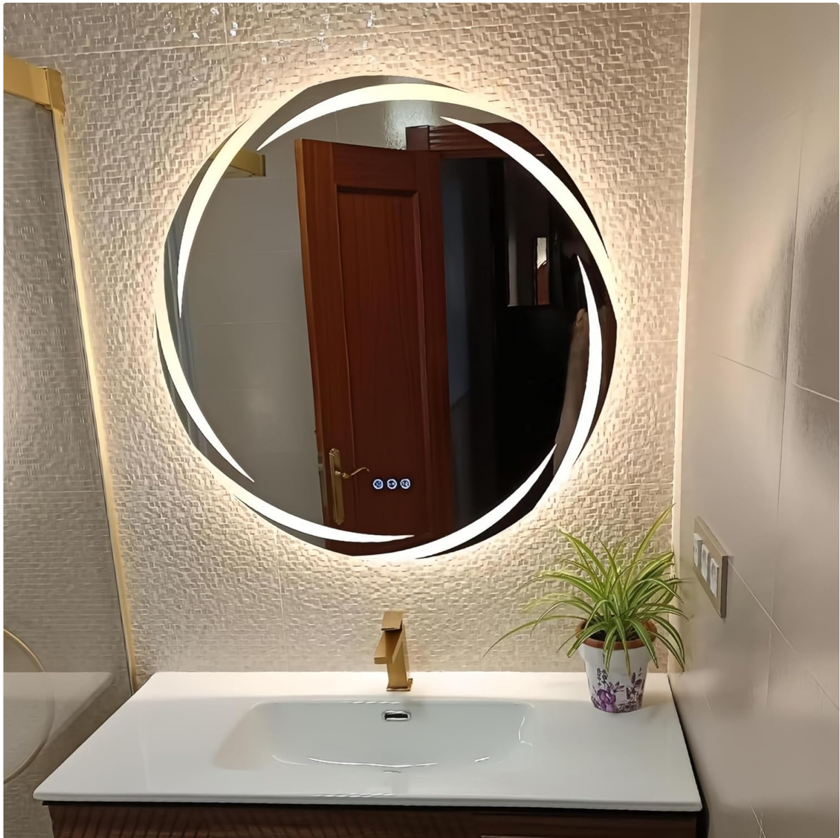
The LUVODI 32-inch Round LED Bathroom Mirror, showcasing its elegant design and backlit illumination in a modern bathroom setting.