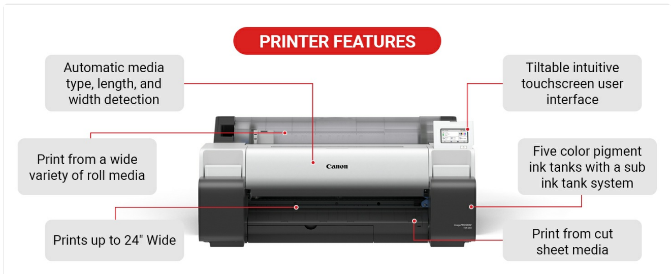
Figure 1.2: Overview of printer features including roll media support, 5-color ink, automatic media detection, cut sheet printing, tiltable touchscreen, and flat top design for easy loading.