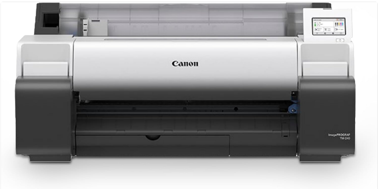
Figure 1.1: Front view of the Canon imagePROGRAF TM-240 printer.

The Canon imagePROGRAF TM-240 is a 24-inch large format printer designed for high-quality poster and plotter printing. It features a 5-color pigment ink system, automatic media detection, and color calibration capabilities, making it suitable for various professional applications.