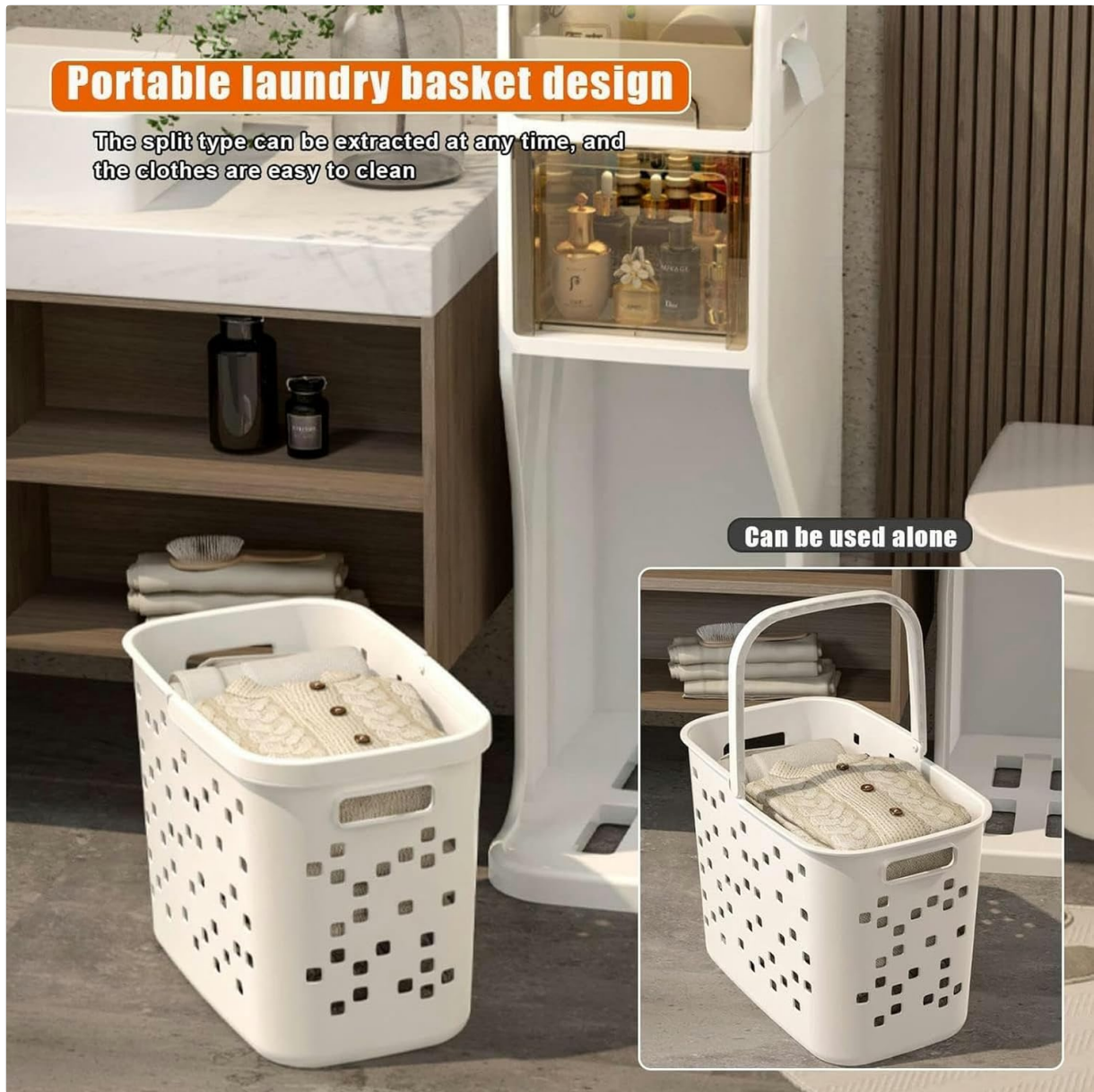
Image: Demonstration of the portable laundry basket, highlighting its split-type design for easy extraction and independent use.

The split type can be extracted at any time, and the clothes are easy to clean