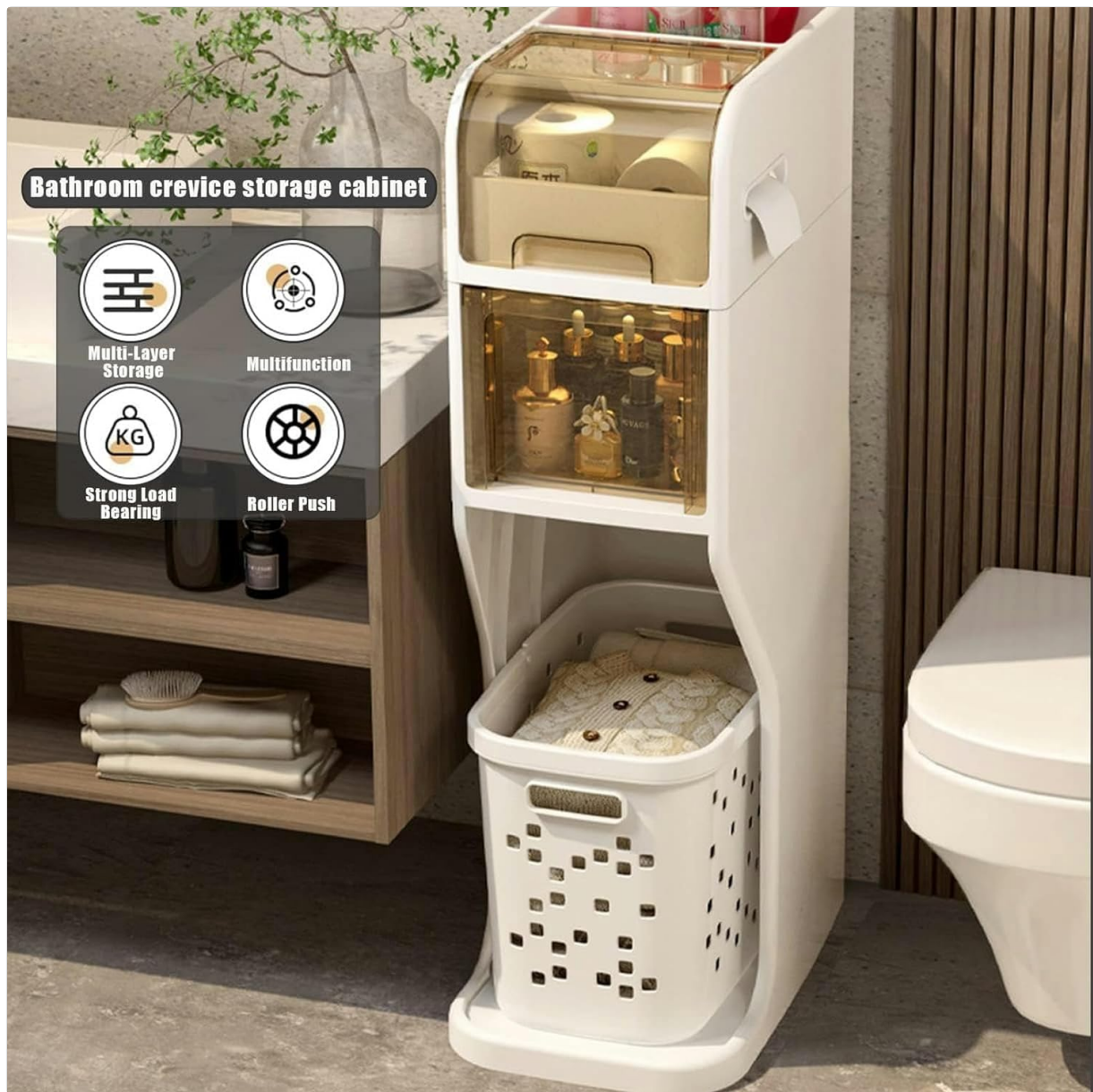
Image: Overview of the ZJXD PBF 4 Tier Bathroom Storage Cabinet highlighting its multi-layer storage, multifunctionality, strong load bearing, and roller push features.