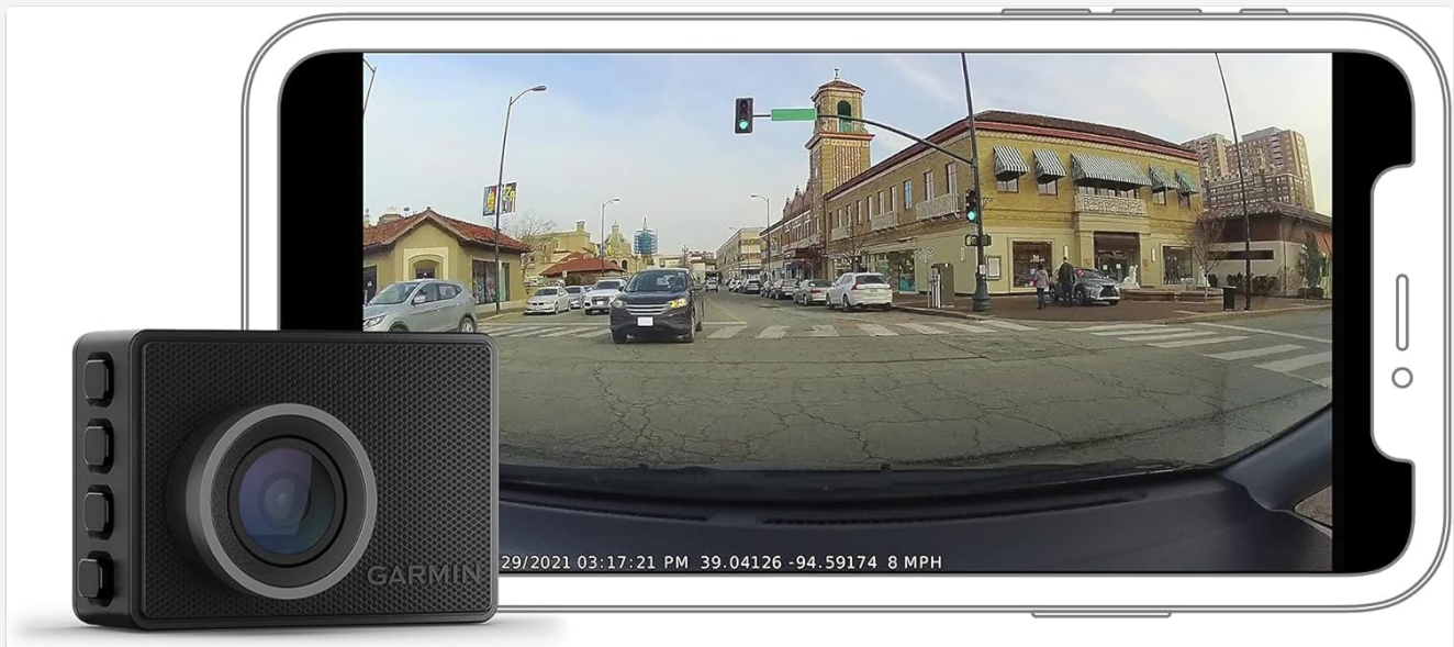
Image: The Garmin Dash Cam 47 shown alongside a smartphone displaying the camera's live feed, illustrating its connectivity and recording capabilities.

The Garmin Dash Cam 47 is a compact, voice-controlled dash camera designed to record your drive in high definition. It features a 140-degree wide-angle lens, capturing clear 1080p video. Built-in GPS records location and time data, while the G-Sensor automatically saves footage upon detecting impacts or sudden movements. Connected features allow for Live View monitoring of your vehicle and automatic video uploads to a secure online vault via the Garmin Drive app.