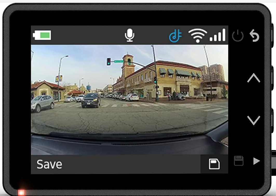
Image: The Garmin Dash Cam 47 display showing a live road view with an on-screen 'Save' button, indicating how to manually save video footage.

The Dash Cam 47 automatically begins recording when powered on. Video is continuously recorded in a loop, overwriting the oldest footage unless saved.