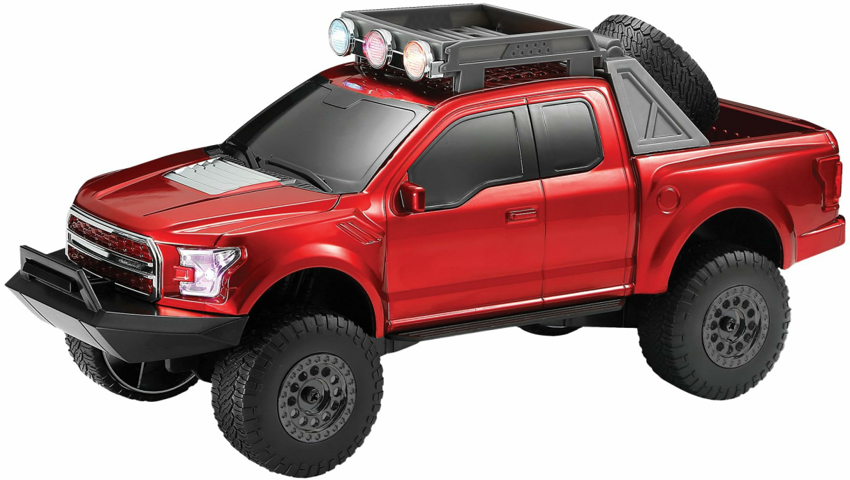
Figure 3.1: Full view of the Audiobox TRK Pickup Truck Bluetooth Speaker.