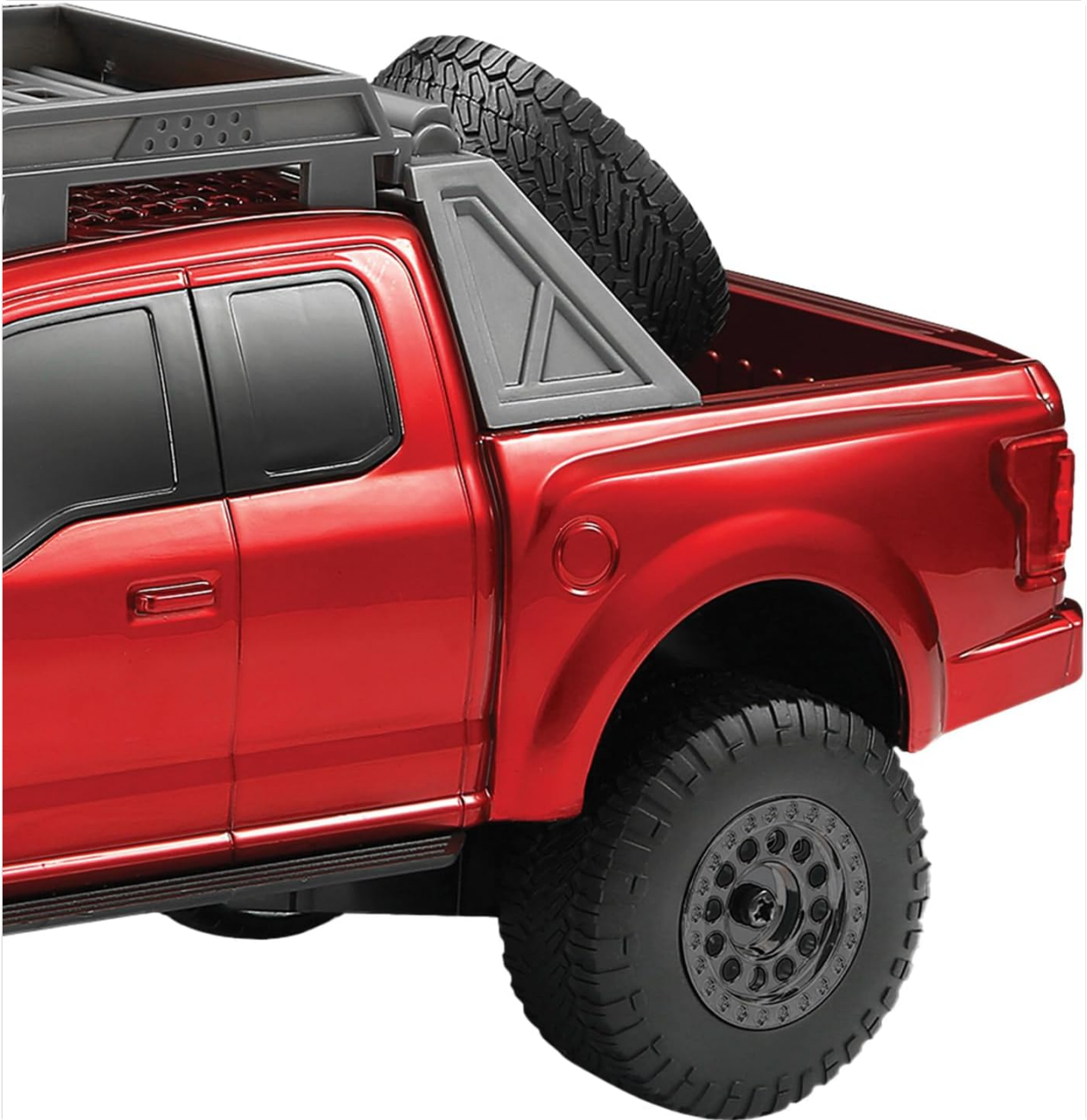
Figure 3.3: Rear view highlighting LED taillights and exhaust details.