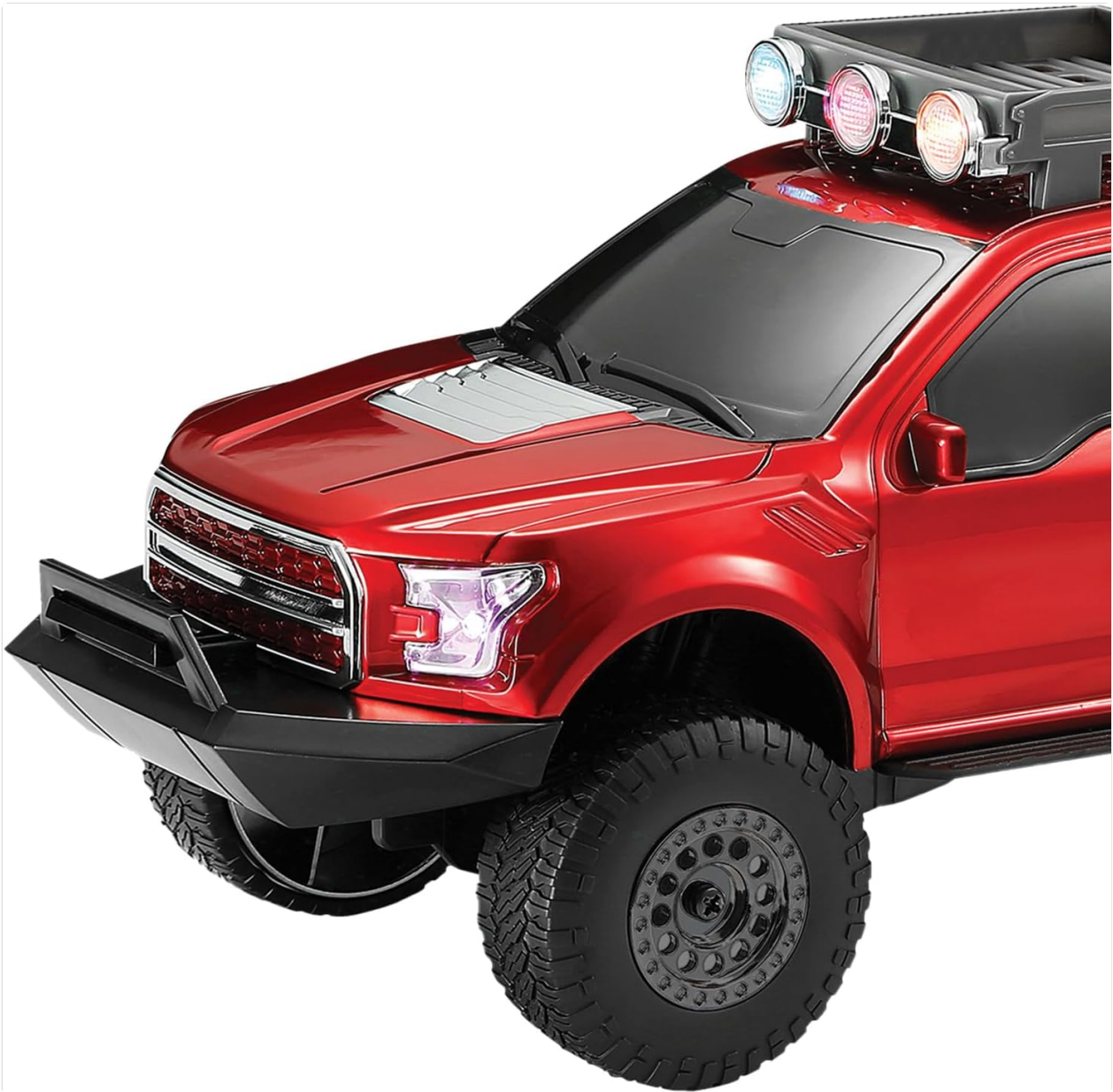
Figure 3.2: Front view highlighting LED headlights and grille details.