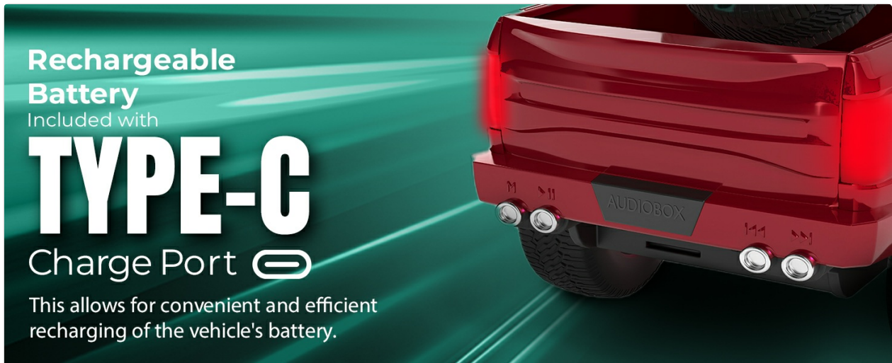
Figure 4.1: USB-C charging port location.

Before initial use, fully charge the speaker's built-in 1500mAh rechargeable battery.