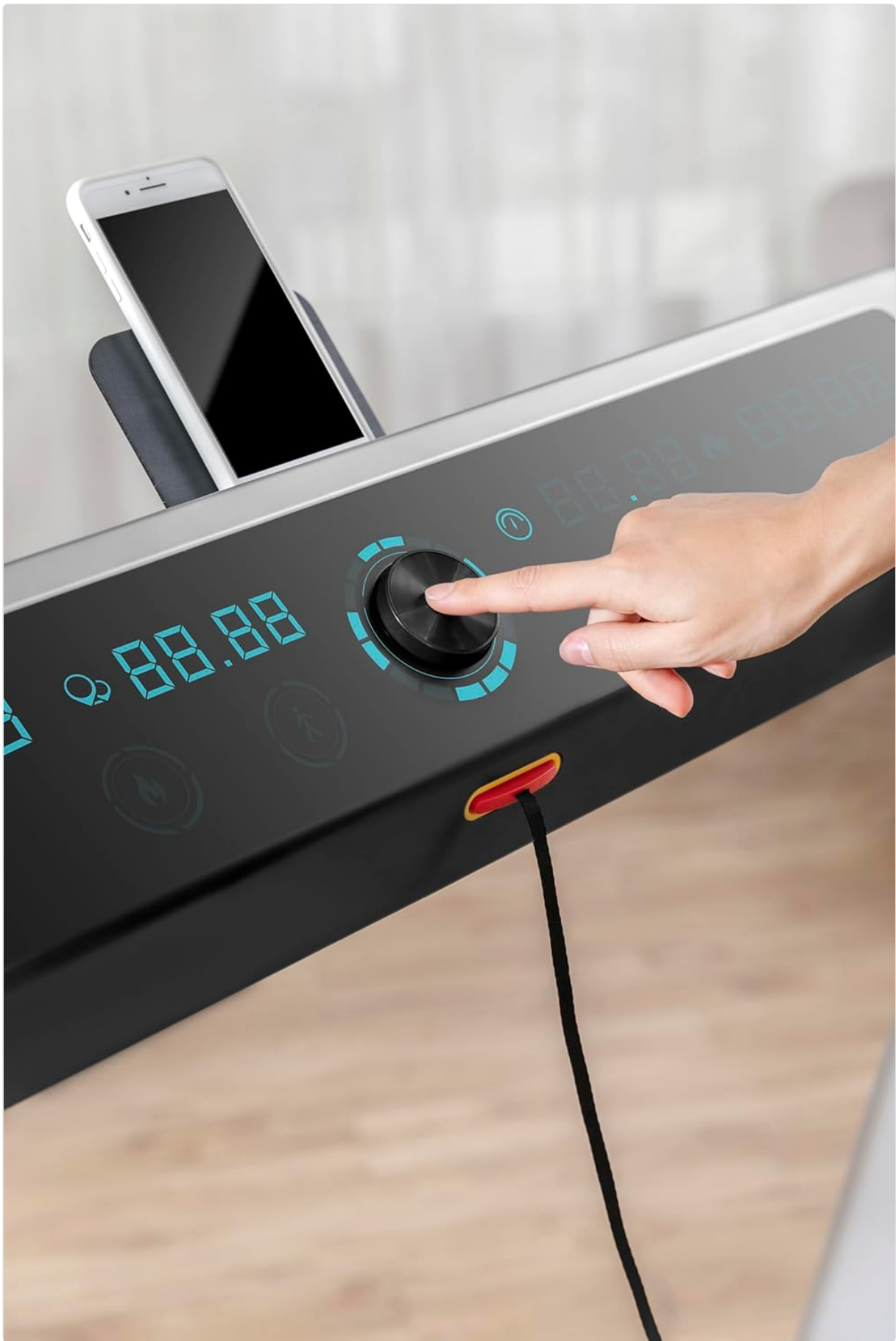
Figure 5.1: User interacting with the K15 control panel, which includes a central knob for adjustments and a phone holder.