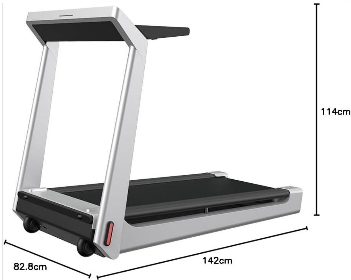
Figure 9.1: Dimensional diagram of the Kingsmith WalkingPad K15 treadmill, indicating its length, width, and height.