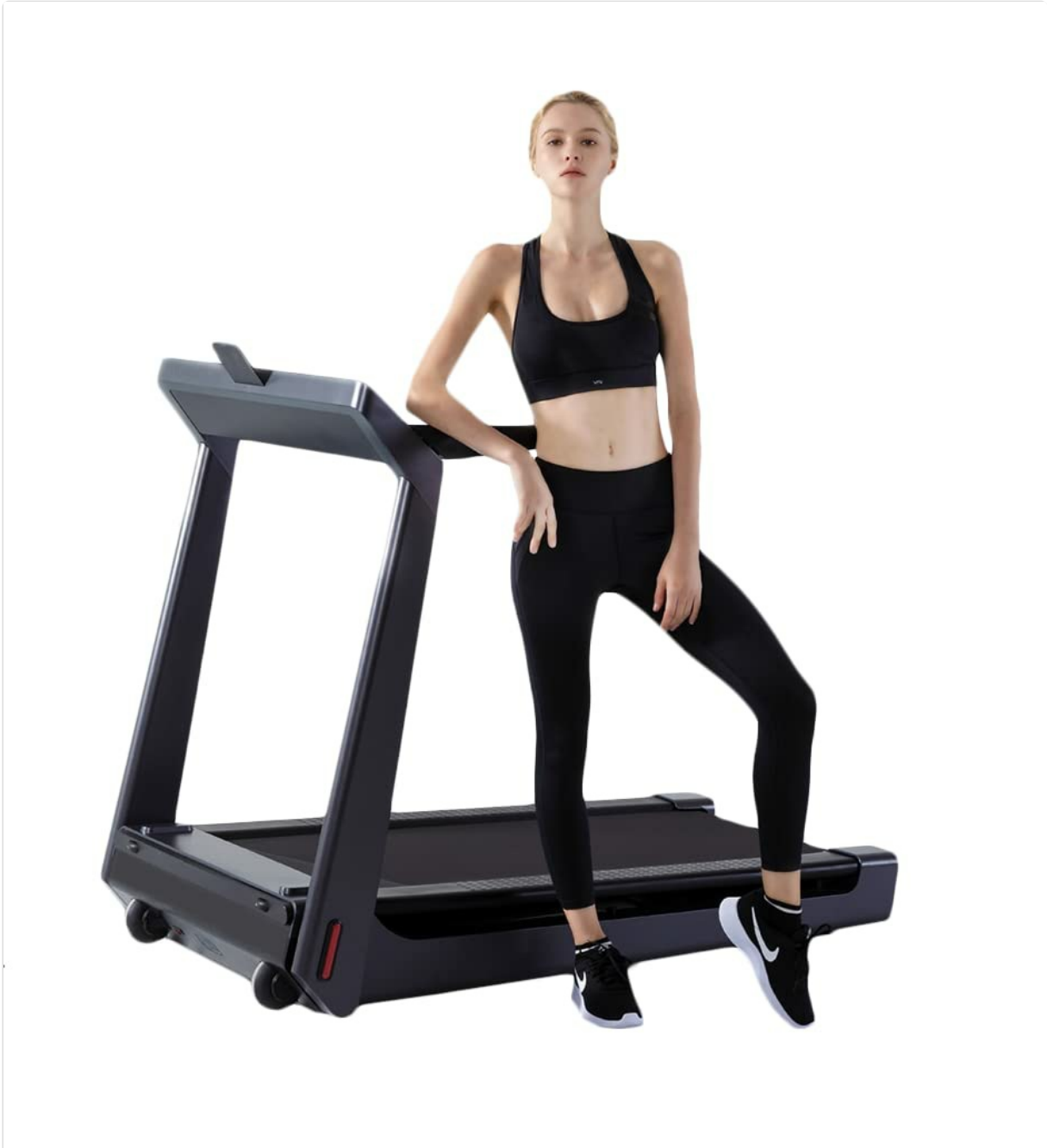
Figure 3.1: Kingsmith WalkingPad K15 Treadmill in its operational, unfolded state.

features a robust aluminum frame, a powerful 1.25 HP motor, and an integrated LCD display.