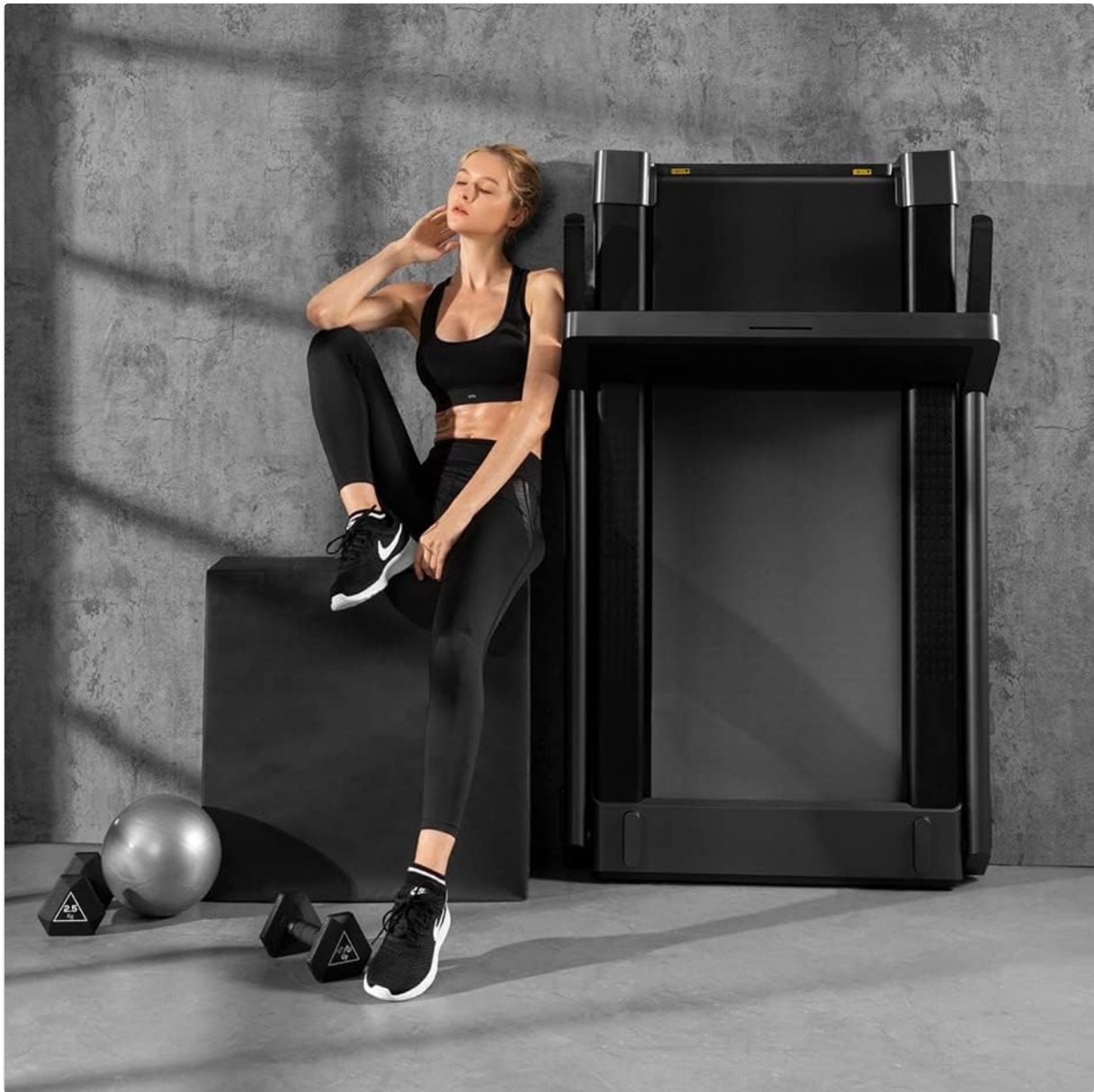
Figure 6.2: A user next to the K15 treadmill stored in an upright position, illustrating its compact footprint.