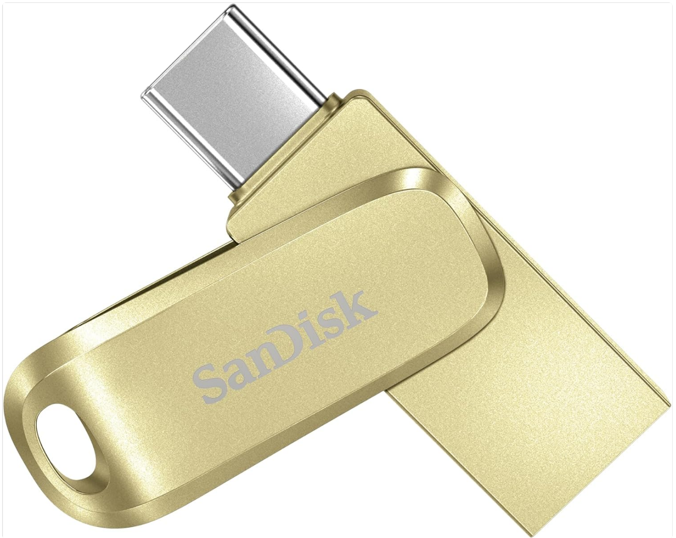
Figure 1: The SanDisk Ultra Dual Drive Luxe, showcasing its dual USB Type-C and Type-A connectors.