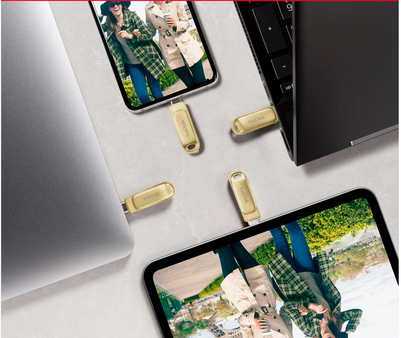
Figure 3: Multiple SanDisk Ultra Dual Drive Luxe units connected to various devices, demonstrating easy file transfer between USB Type-C and Type-A ports.