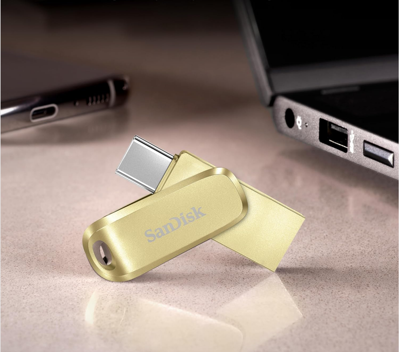
Figure 4: The SanDisk Ultra Dual Drive Luxe connected to a laptop, illustrating quick file transfer capabilities.