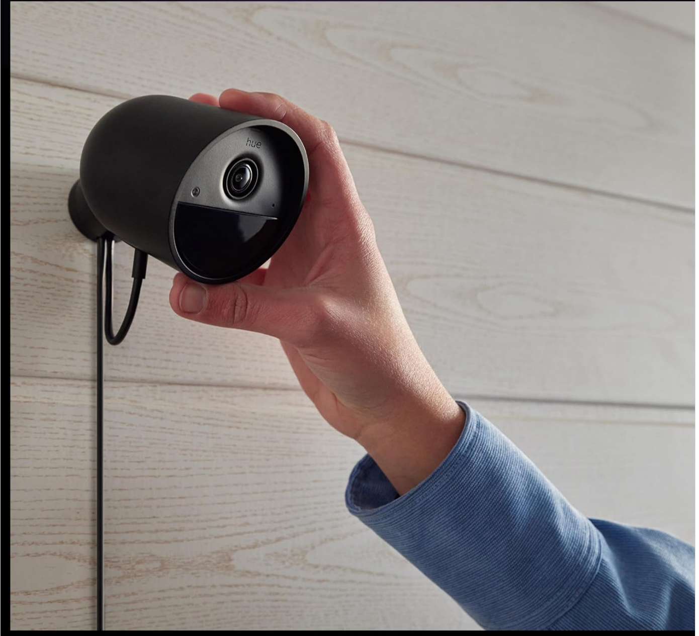
Image: A hand demonstrating the installation of a Philips Hue Secure camera onto a wall mount.