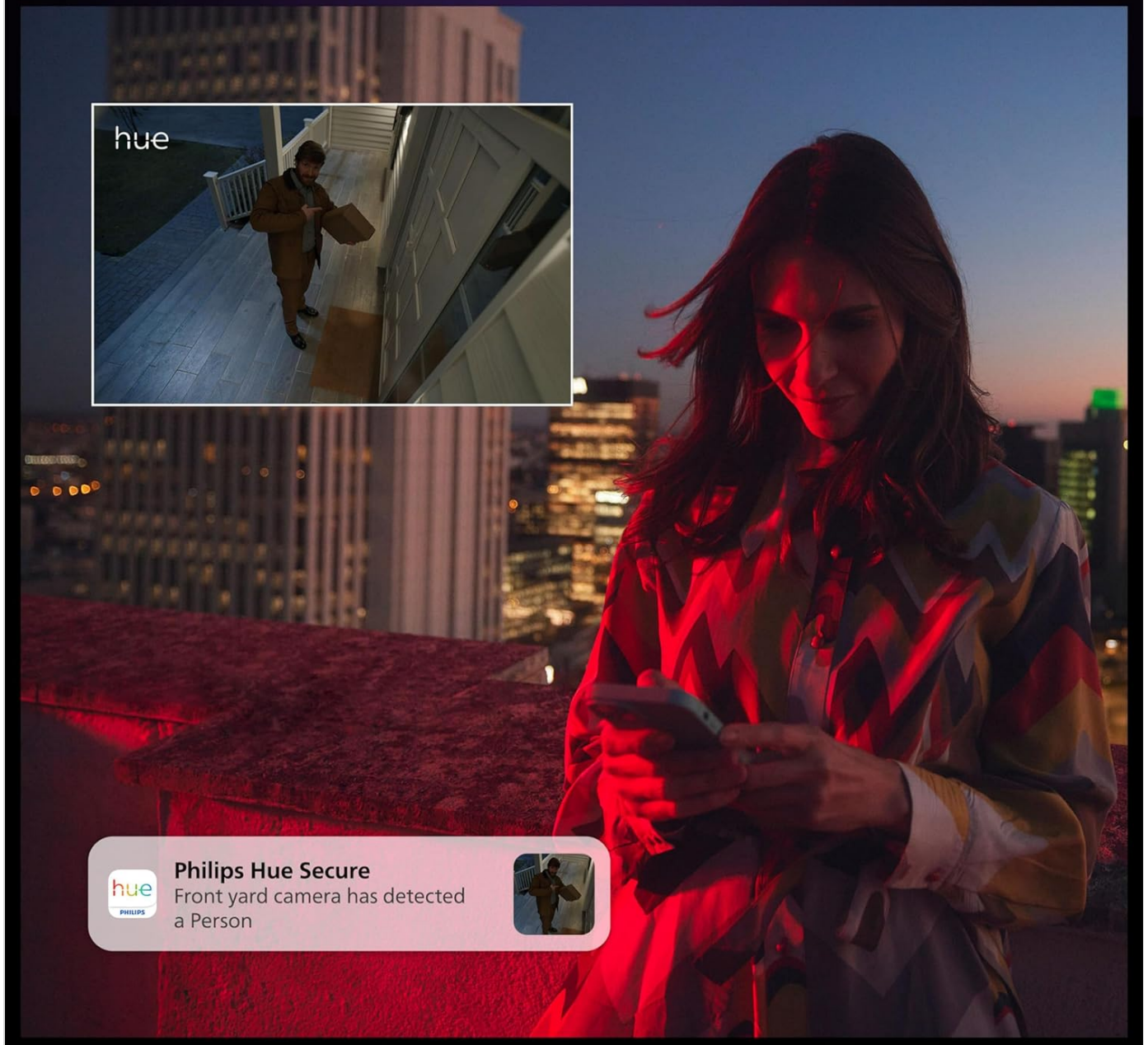
Image: A person receiving a package, with a smartphone displaying a Philips Hue Secure notification indicating a person has been detected.