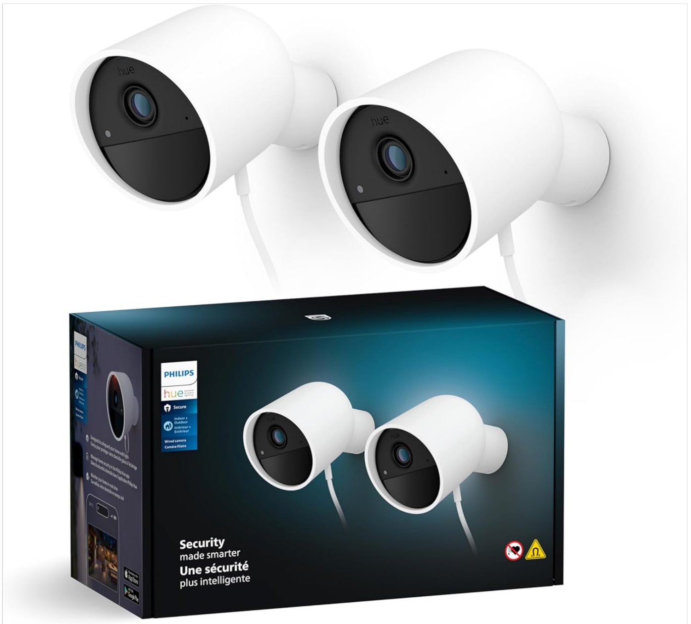
Image: The Philips Hue Secure Wired Camera 2-Pack, showing two white cameras and their retail packaging.

The Philips Hue Secure Wired Camera offers 1080p resolution, motion notifications, and seamless integration with your existing Philips Hue lighting system. Designed for both indoor and outdoor use, these cameras provide continuous power and include a free 24-hour video history.