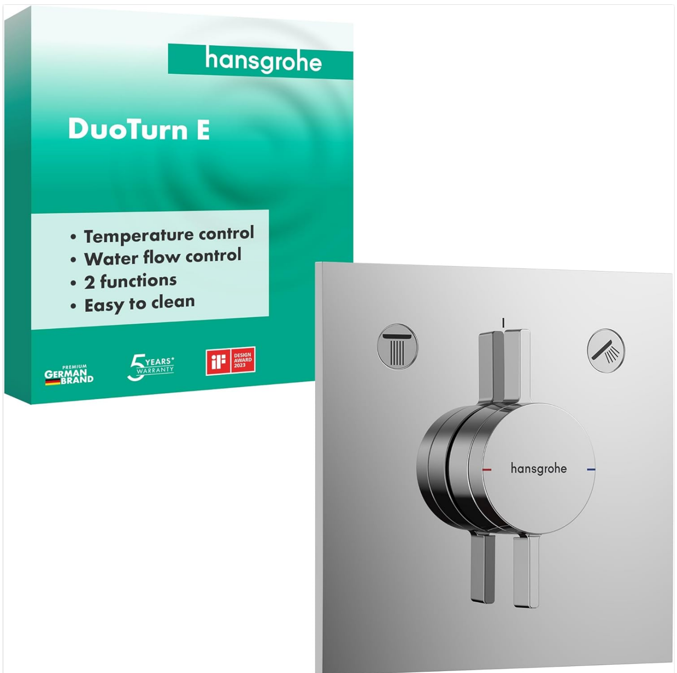
Figure 1: hansgrohe DuoTurn E 75417000 Flush-Mounted Mixer and its packaging, highlighting key features.