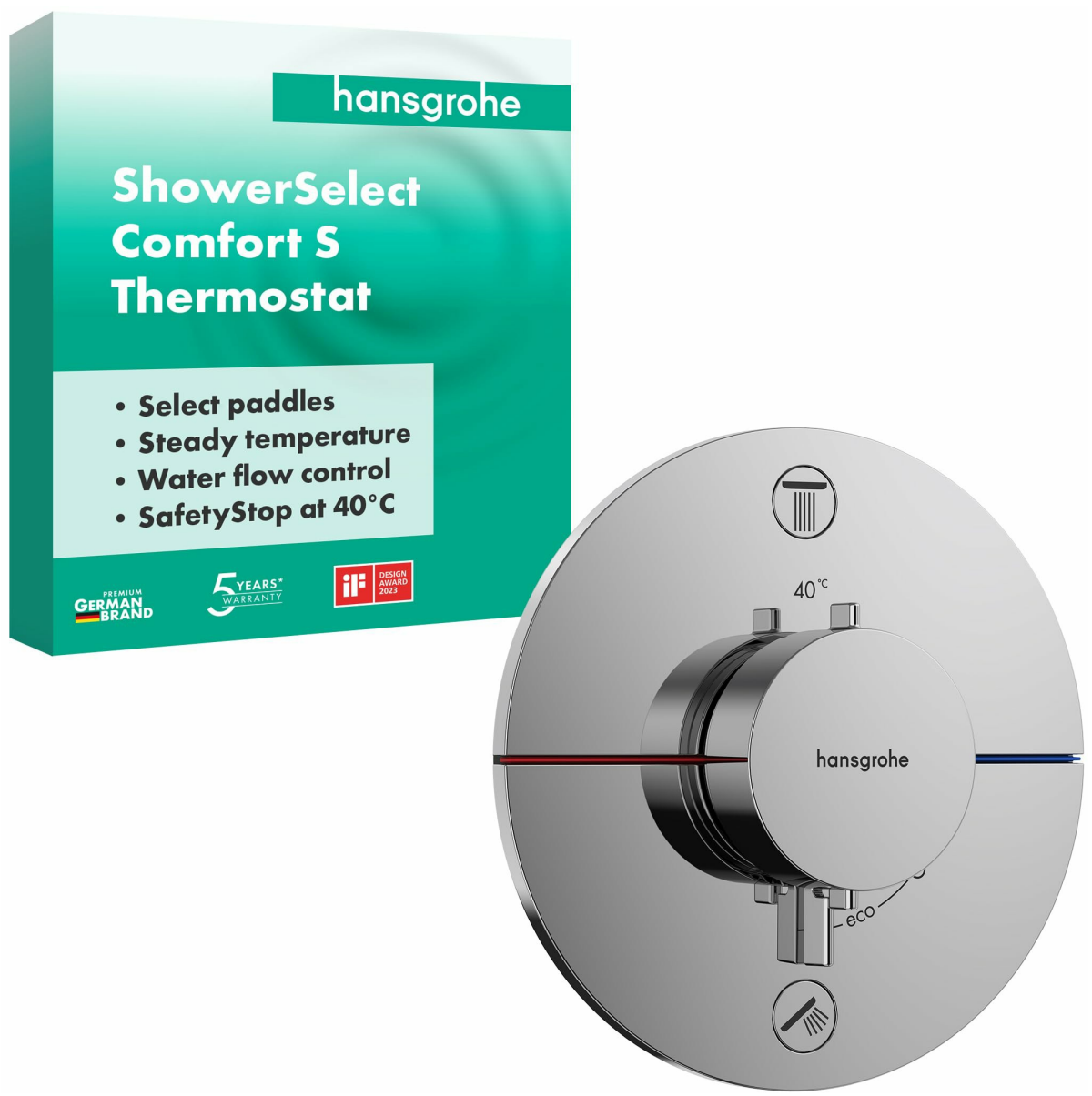
Figure 6: Easy to Clean. The smooth chrome surface allows for quick and effective cleaning.