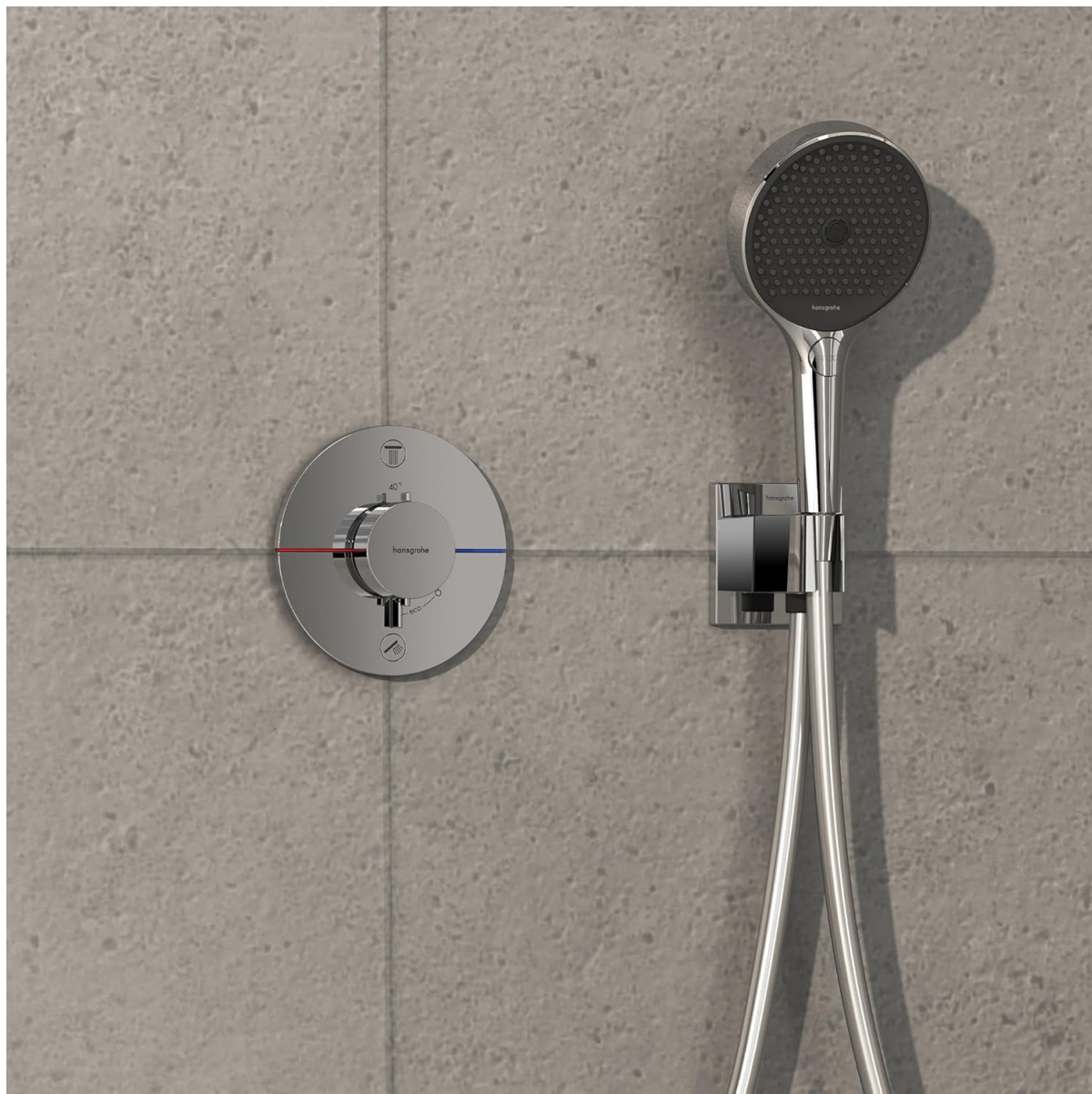
Figure 3: Easy On and Off. Simply press the designated buttons to control water flow to your desired outlet.