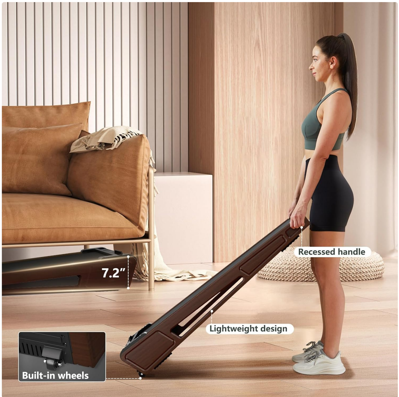
Key dimensions and weight capacity of the walking pad.