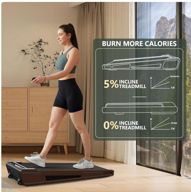
Benefits of the 5% incline for enhanced workouts.