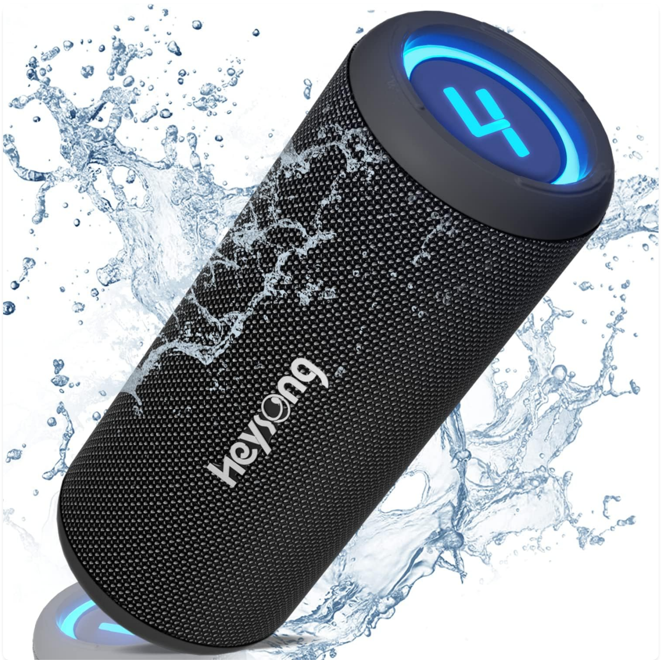
Figure 1.1: HEYSONG Portable Bluetooth Speaker, showcasing its waterproof design.