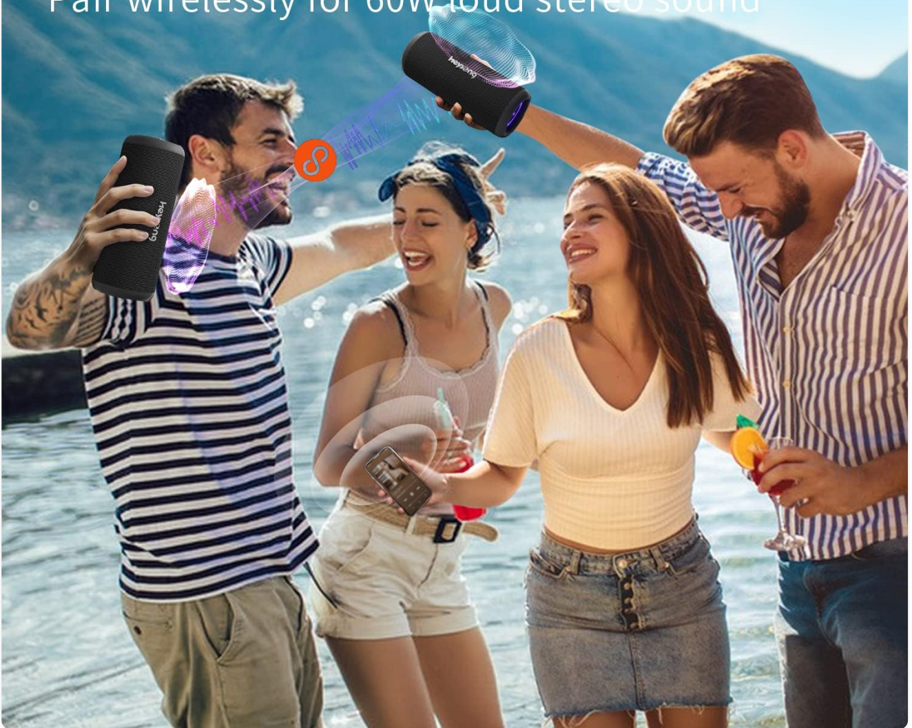
Figure 2.1: Demonstrating True Wireless Stereo pairing for enhanced sound.

Pair wirelessly for 60W loud stereo sound