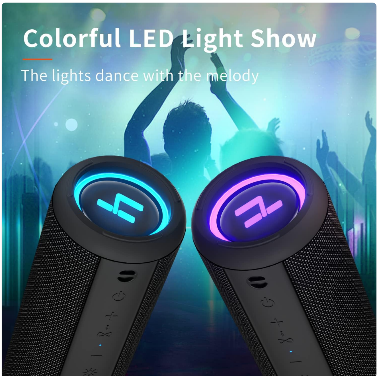
Figure 3.1: The speaker's colorful LED light show in action.

The speaker features multiple RGB LED light modes. Press the Light button to cycle through different patterns and colors. Long press the Light button to turn the LED lights on or off.