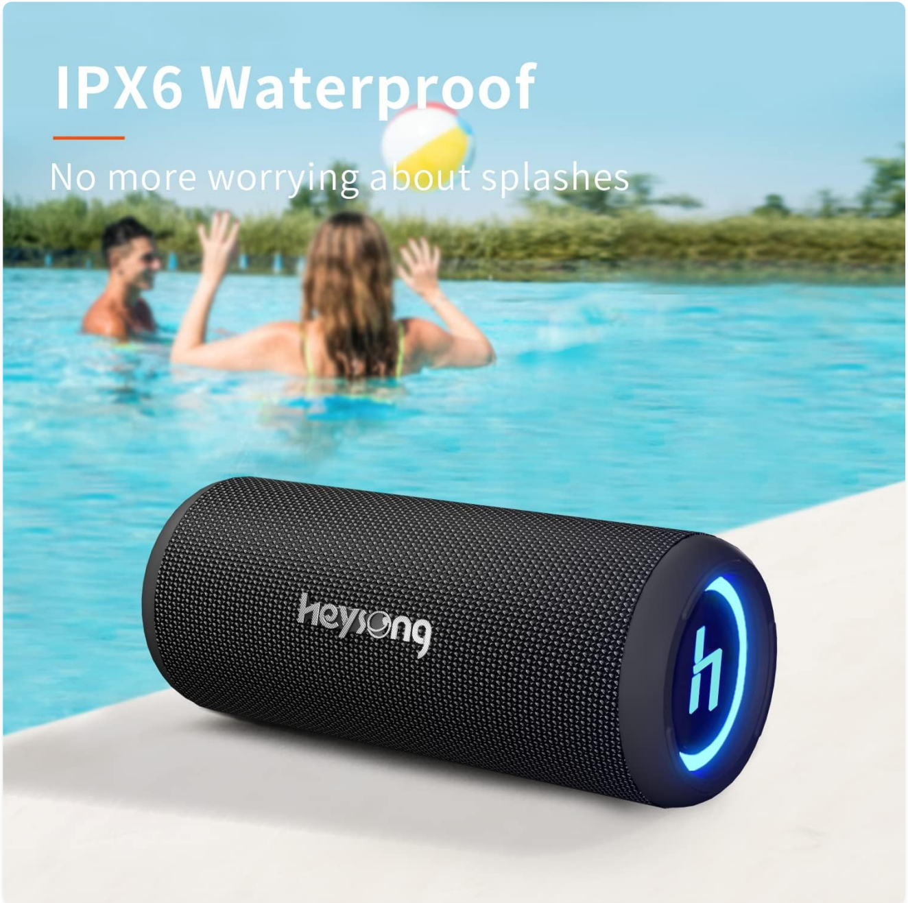
Figure 4.1: The speaker's IPX6 waterproof rating allows for easy cleaning and use near water.

Due to its waterproof design, the speaker can be easily cleaned. Use a soft, damp cloth to wipe down the exterior. Do not use harsh chemicals or abrasive cleaners. Ensure the charging port and other openings are dry before charging.