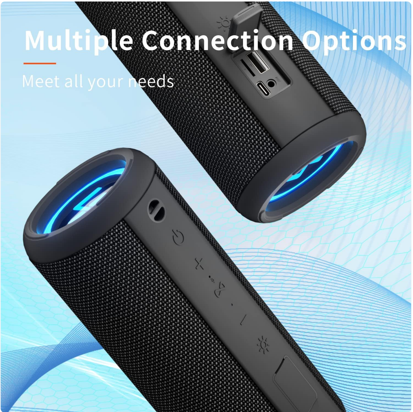
Figure 2.2: Overview of the speaker's multiple connection options.