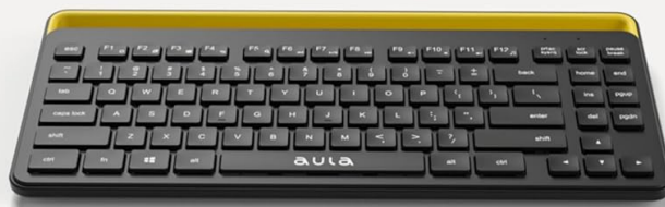
Image: The keyboard positioned below illustrations of a laptop, tablet, and smartphone, demonstrating its broad compatibility.