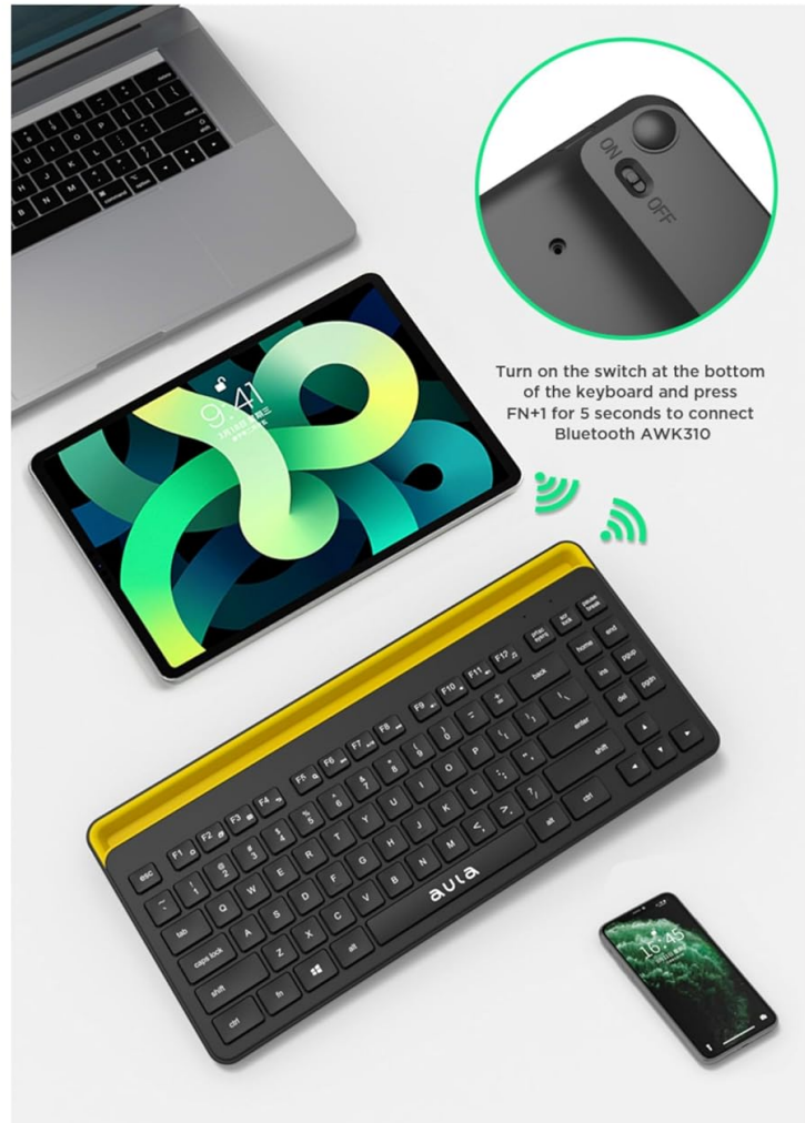
Image: The bottom of the keyboard with the ON/OFF switch and a visual representation of pressing FN+1 for pairing.