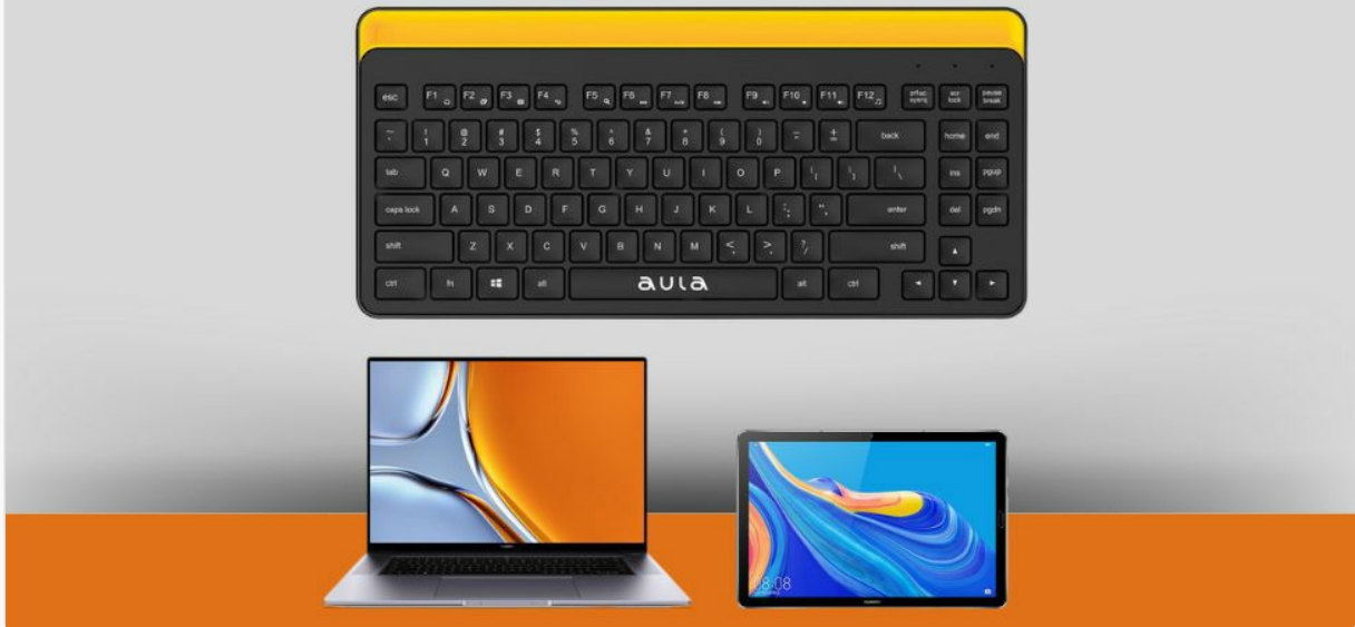
Image: The keyboard shown with a laptop and a tablet, emphasizing its ability to connect to multiple devices.