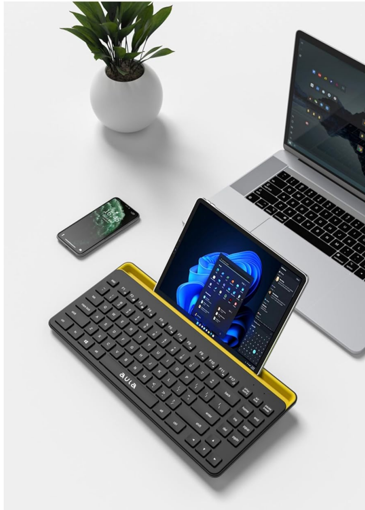
Image: The keyboard with a tablet and smartphone securely resting in its built-in stand, demonstrating the integrated cradle feature.