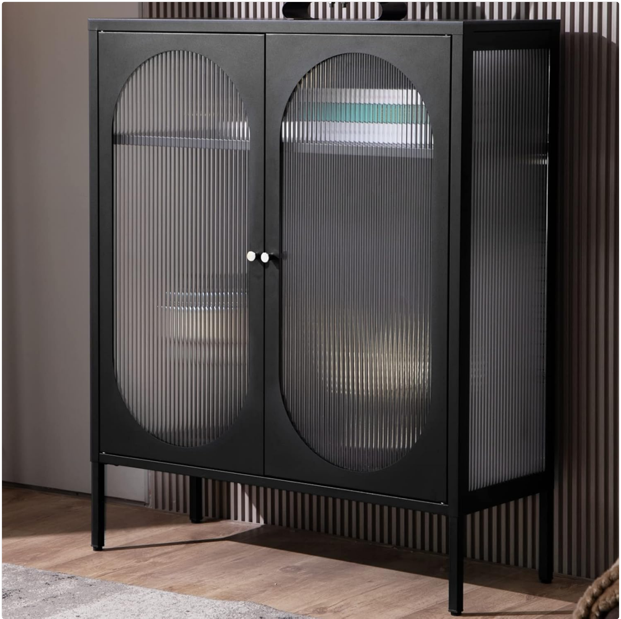
Figure 4: The SICOTAS Modern Sideboard Buffet Cabinet with its corrugated glass doors closed, showcasing its sleek design and providing a glimpse of stored items.