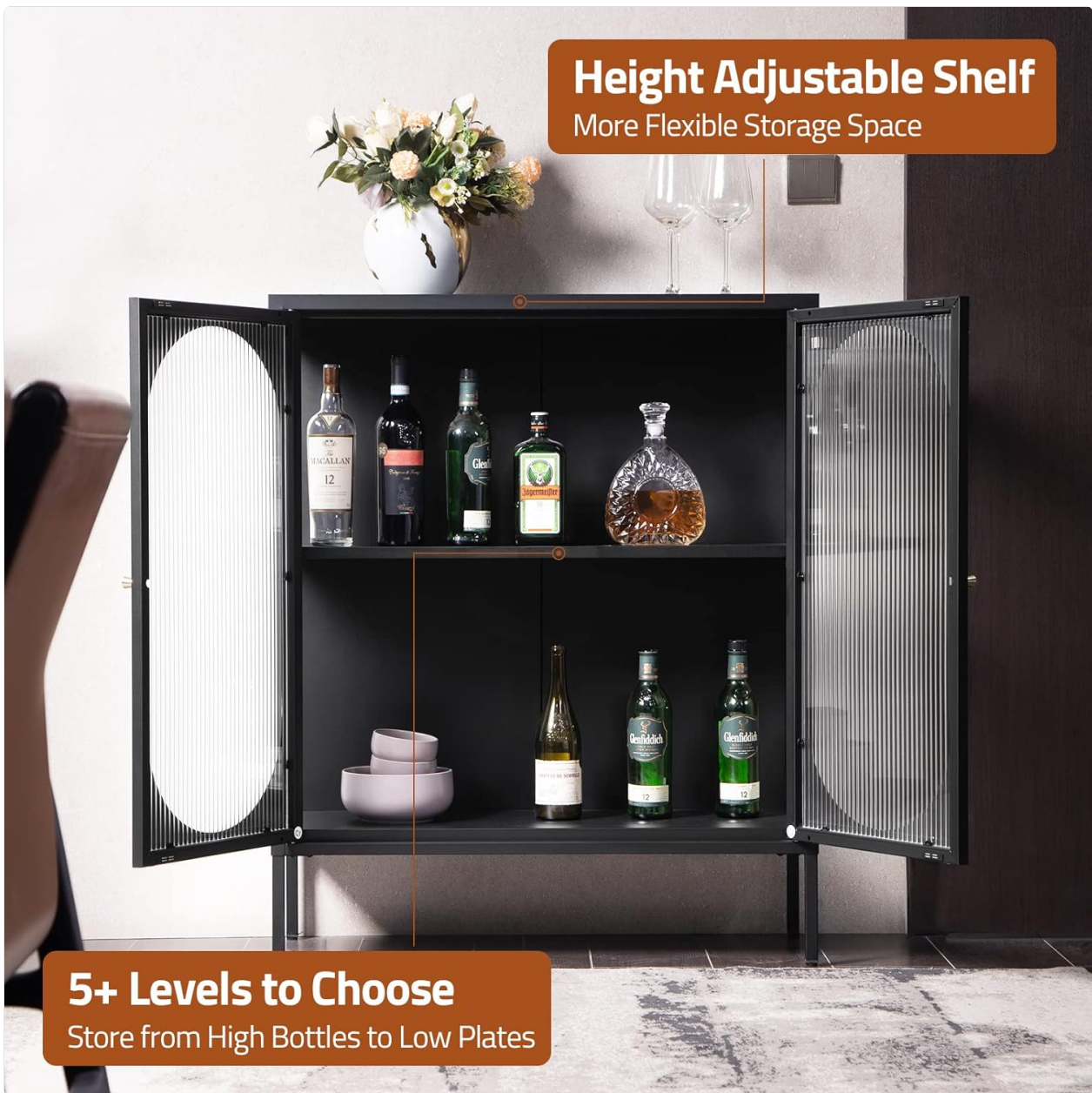
Figure 3: The adjustable shelf feature, demonstrating its ability to accommodate items of various heights, from tall bottles to smaller dishes, with 5 distinct height levels.

Your browser does not support the video tag.