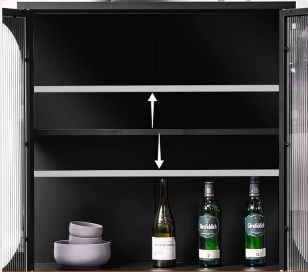
Multi-level Adjustable Shelf