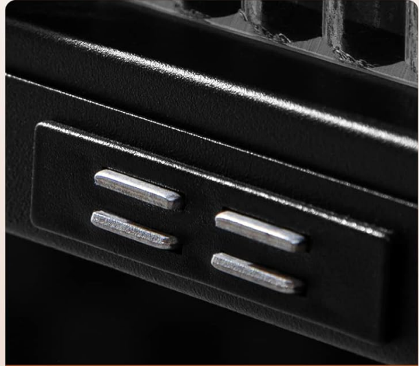
Magnetic Door Holder