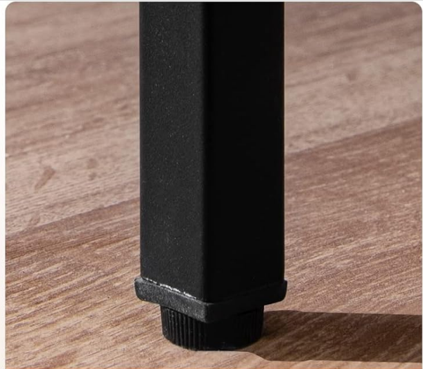
Protective Foot Pads