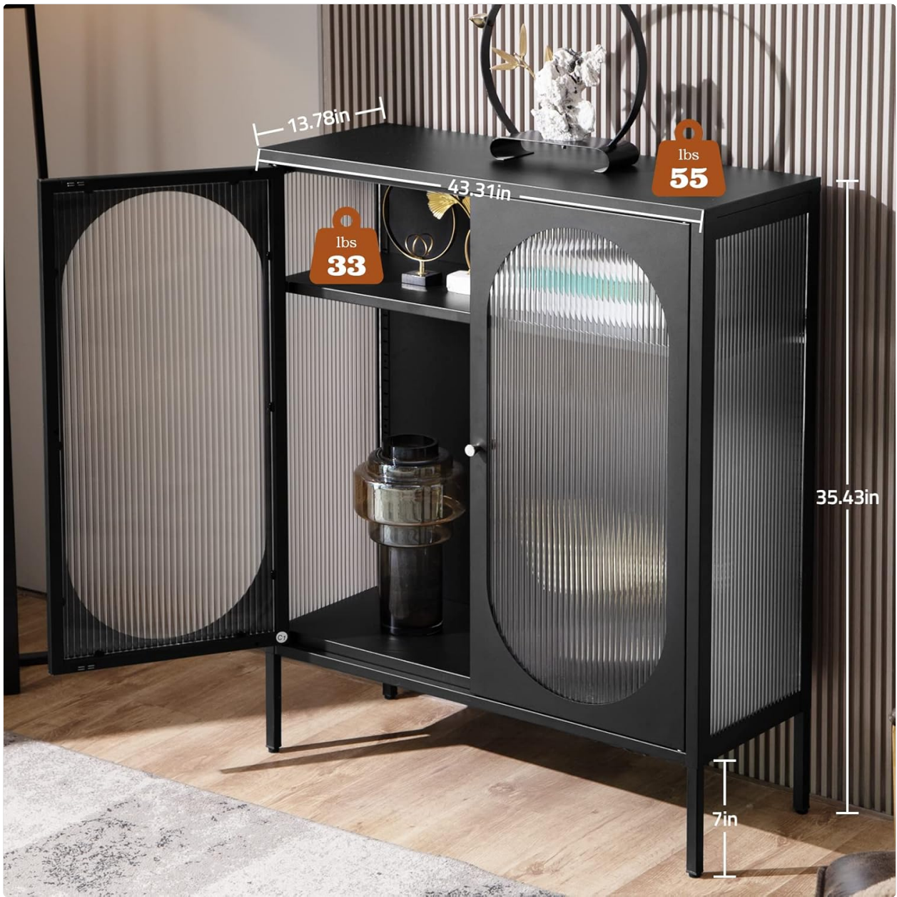
Figure 1: Cabinet dimensions and weight capacities. The cabinet measures 43.31 inches wide, 13.78 inches deep, and 35.43 inches high, with legs measuring 7 inches. The top surface supports up to 55 lbs, and the interior shelf supports up to 33 lbs.