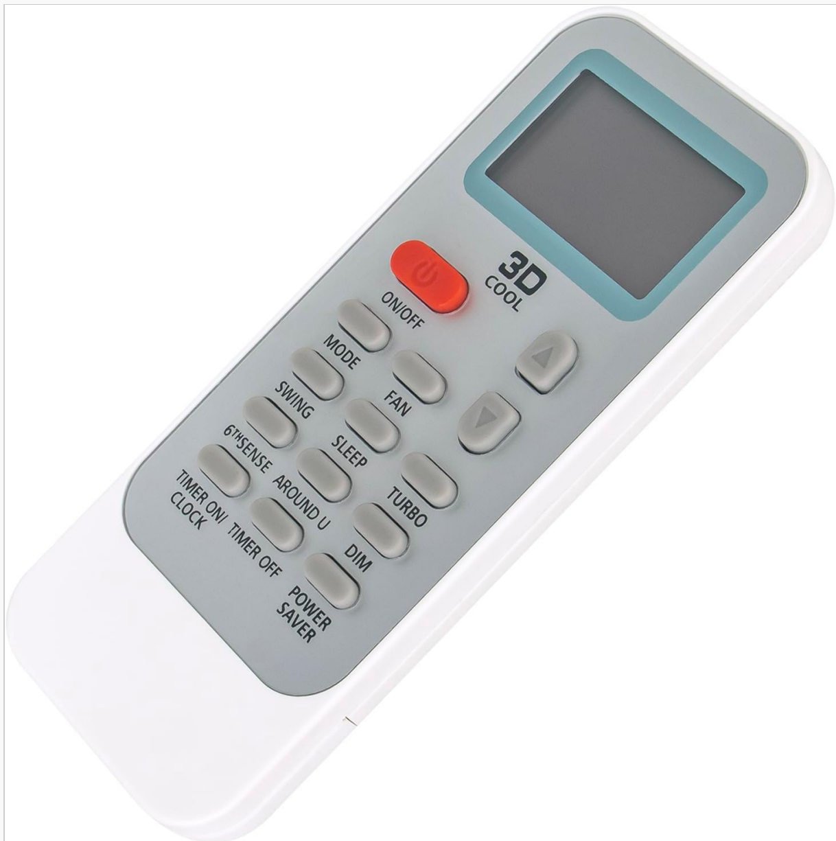
Image: Front view of the remote control, displaying the buttons and LCD screen.

Point the remote control directly at your air conditioning unit's receiver. Ensure there are no obstructions between the remote and the unit.