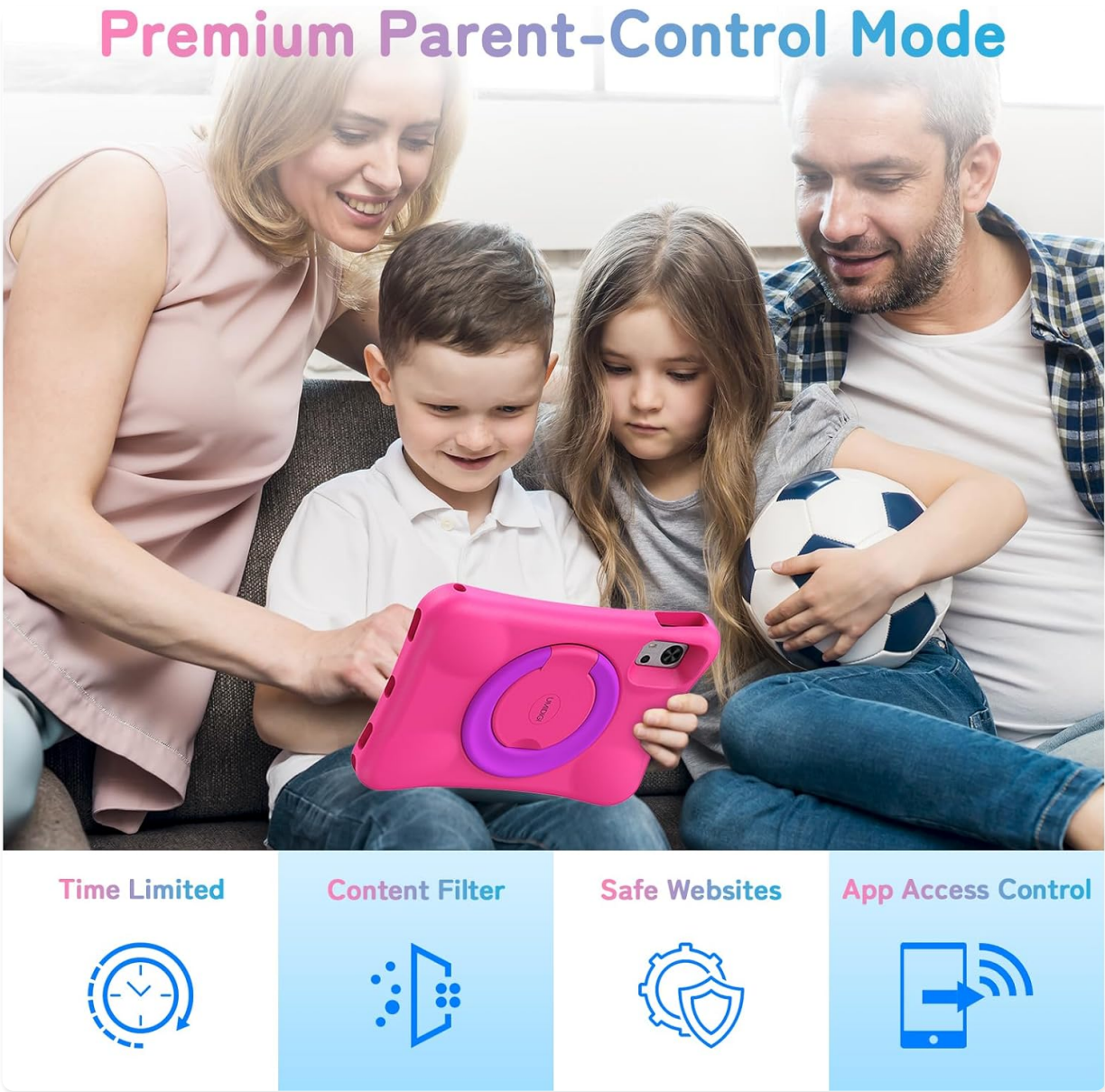
Image: A family interacting with the UMIDIGI G5 Tab Kids, illustrating the parental control features.