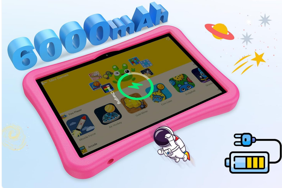
Image: Details on the 6000mAh battery capacity and estimated usage times for different activities.