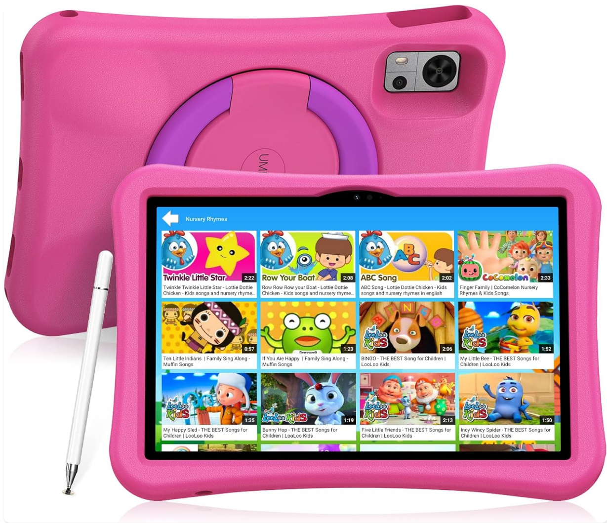
Image: UMIDIGI G5 Tab Kids tablet in its pink protective case, shown with a stylus.