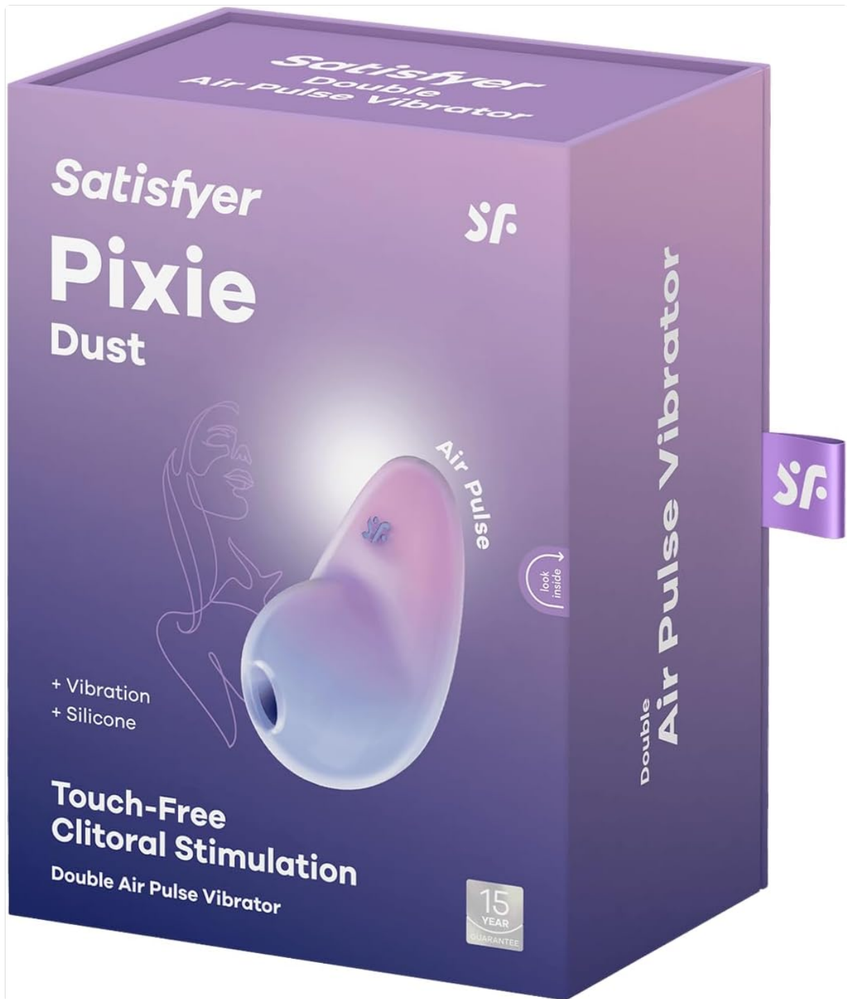
Image: The Satisfyer Pixie Dust product packaging, indicating the brand, product name, and a 15-year guarantee.