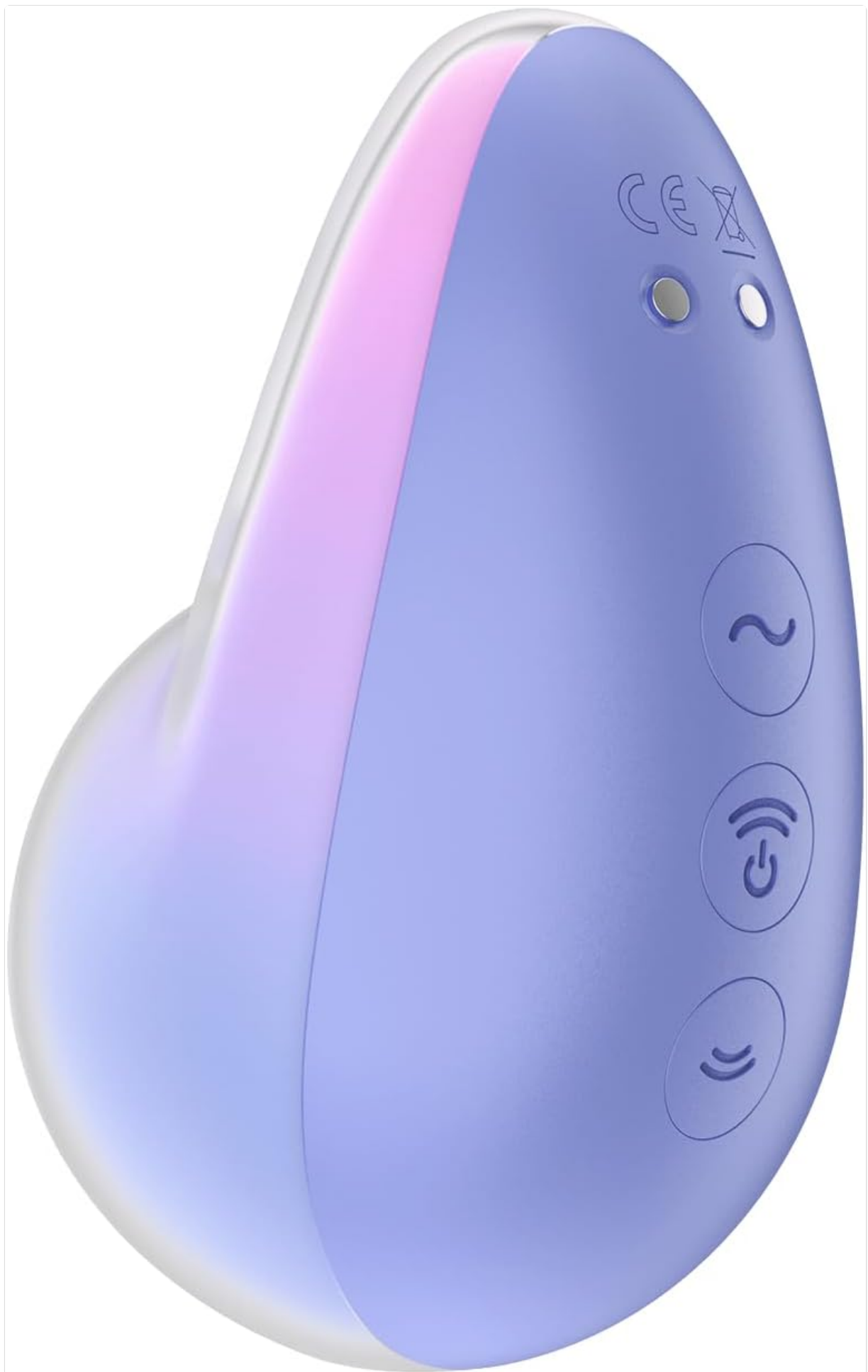
Image: Rear view of the device, displaying the three control buttons for power, air pulse functions, and vibration functions.