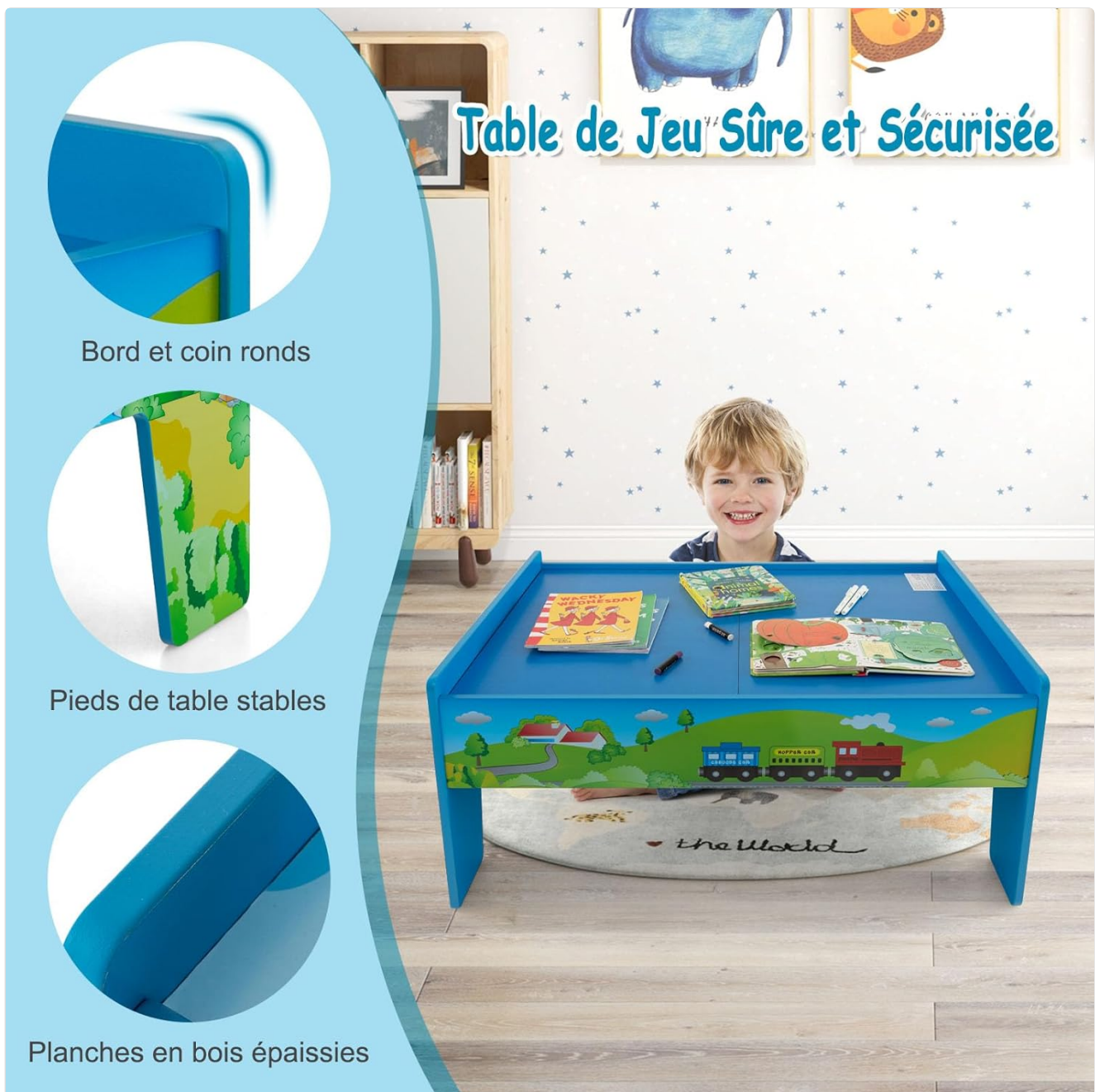
Image 2.1: Safety features including rounded edges and stable construction.