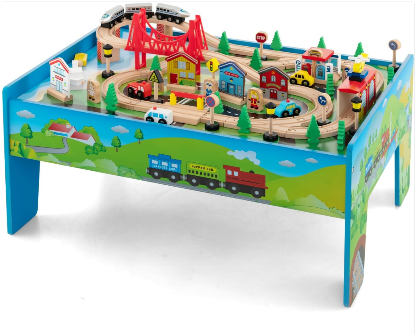
Image 1.1: Fully assembled GOPLUS Train Table with all accessories.