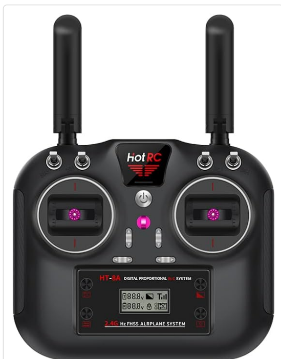
Image 5.1: Front view of the HOT RC HT-8A digital proportional RC system transmitter.

Refer to the HOT RC HT-8A transmitter and F08A 8CH receiver manuals for detailed binding procedures. Ensure the transmitter is set to the correct model type (airplane) and control mode (left throttle for S1904B-L10).