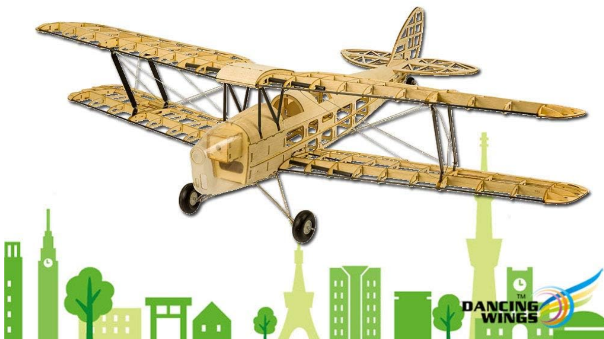
Image 9.1: Visual representation of the S19 Mini Tiger Moth's key dimensions and electronic recommendations.