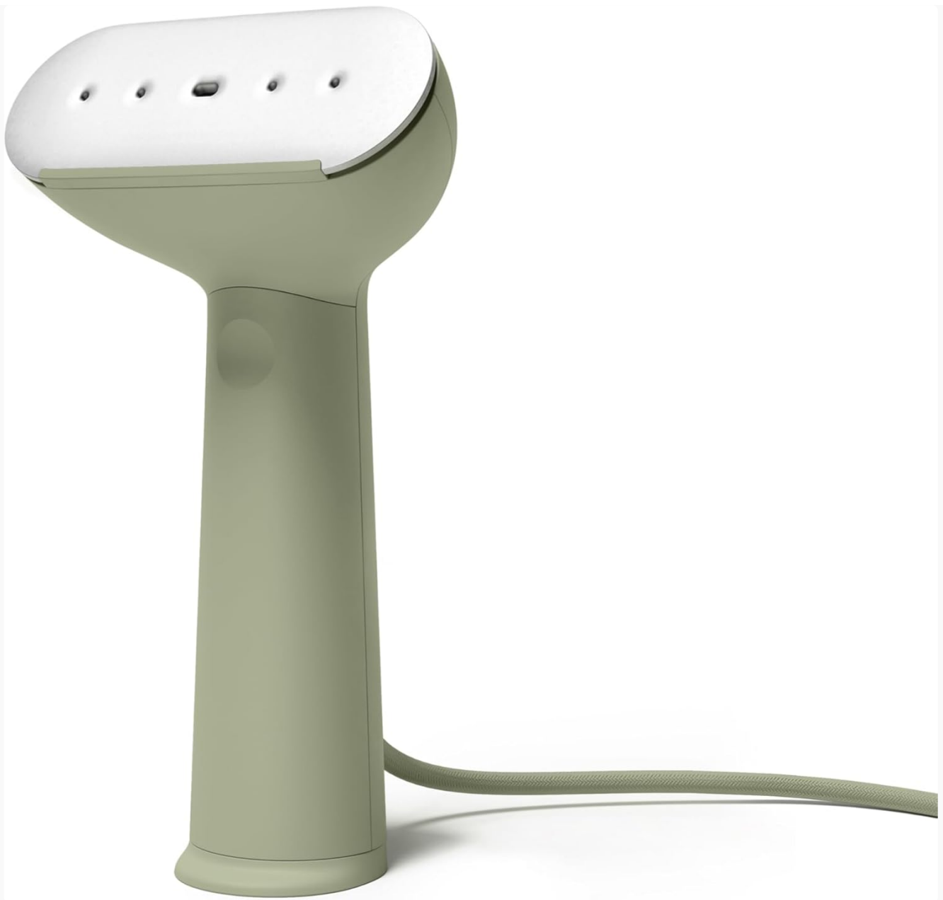
Image: The Steamery Cirrus 3 Handheld Clothes Steamer in its upright position, showcasing its sleek green design and white heated plate.