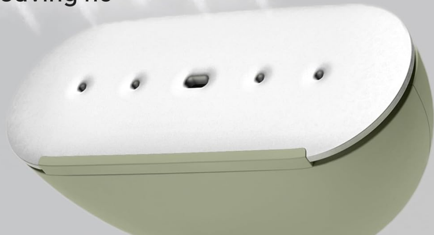
Image: A detailed view of the steamer's controls and the dry steam being emitted, illustrating its quick heat-up and efficient steam generation.

High quality Dry Steam technology, leaving no water stains.