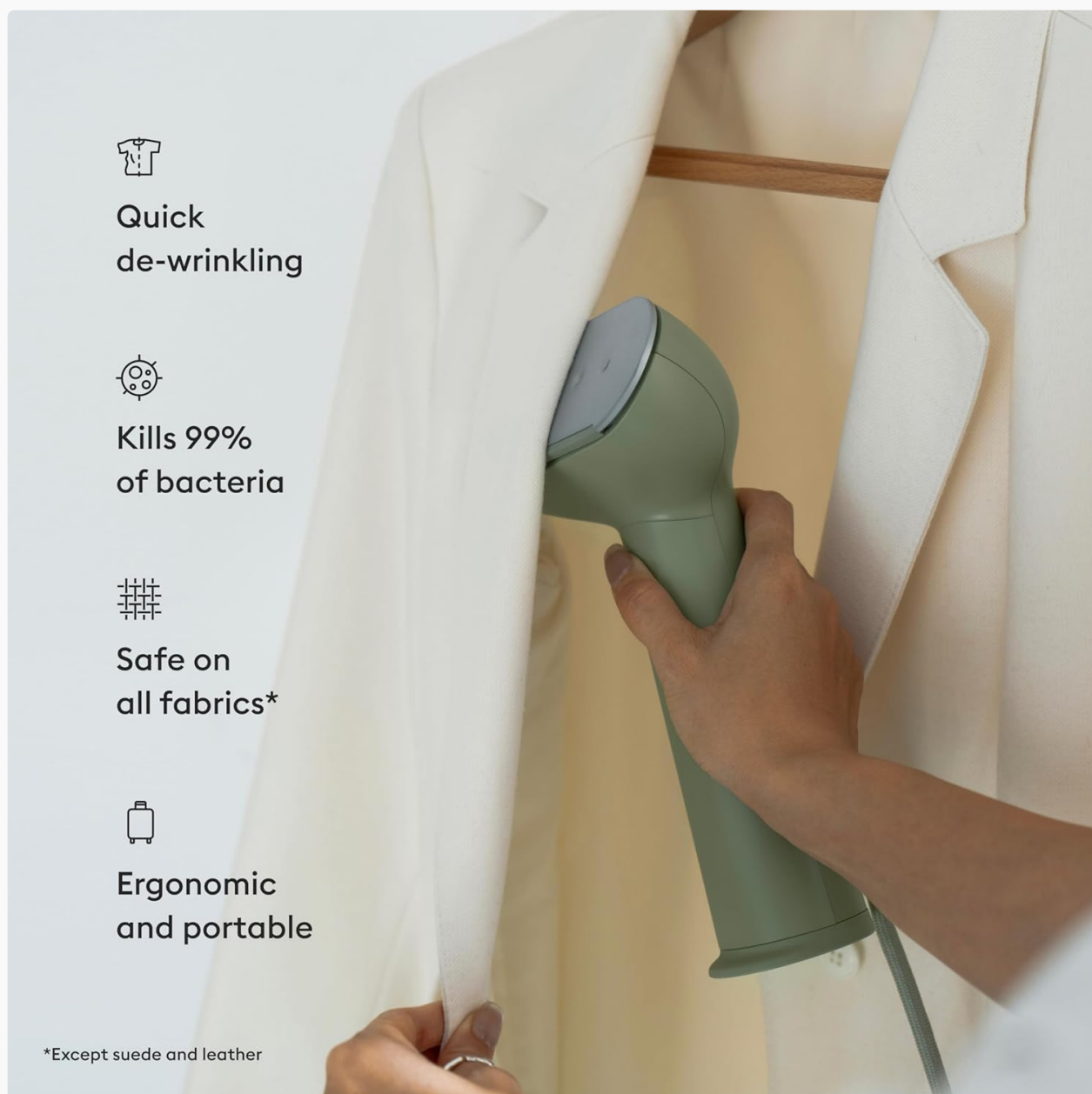
Image: A user holding the Steamery Cirrus 3 steamer against a white blazer, illustrating the process of steaming clothes to remove wrinkles.

press the steamer against the fabric and move it downwards, allowing the steam to relax the fibers and remove wrinkles. For best results, use the included steaming pad behind the fabric.