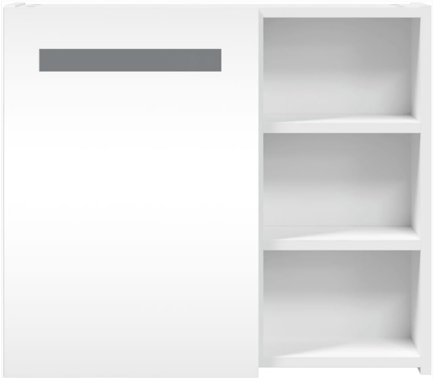
Image: Front view of the assembled cabinet, highlighting the mirror and shelves.