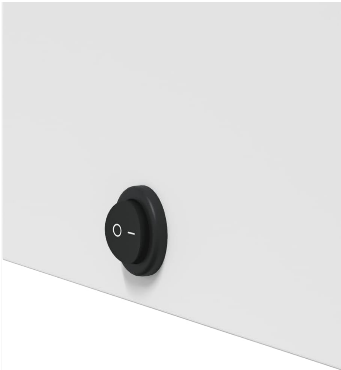
Image: On/Off switch for the integrated LED light.