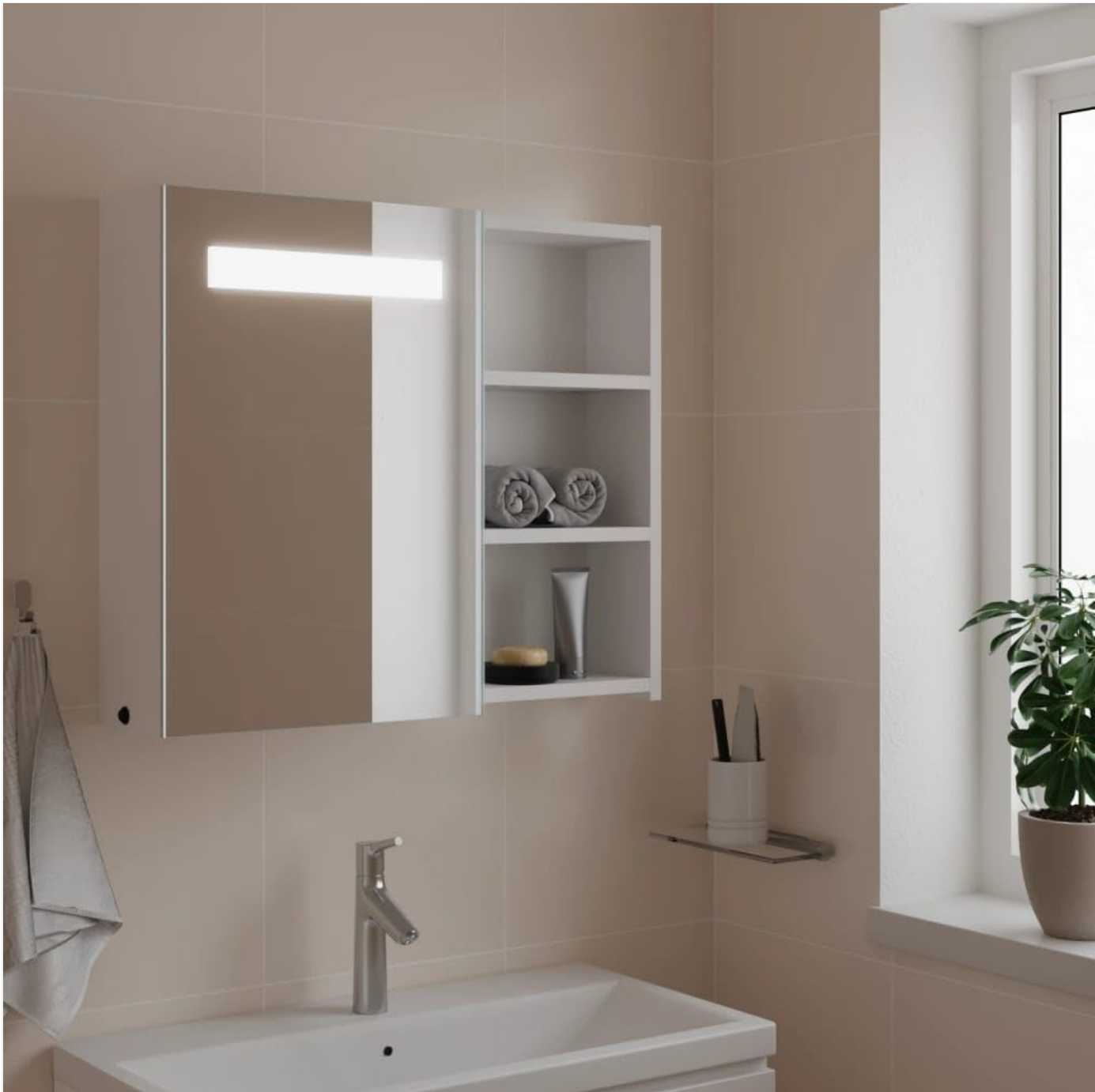
Image: The vidaXL LED Mirror Bathroom Cabinet, showcasing its design and functionality in a bathroom setting.

WARNING: Failure to follow these safety instructions may result in injury or damage to the product.