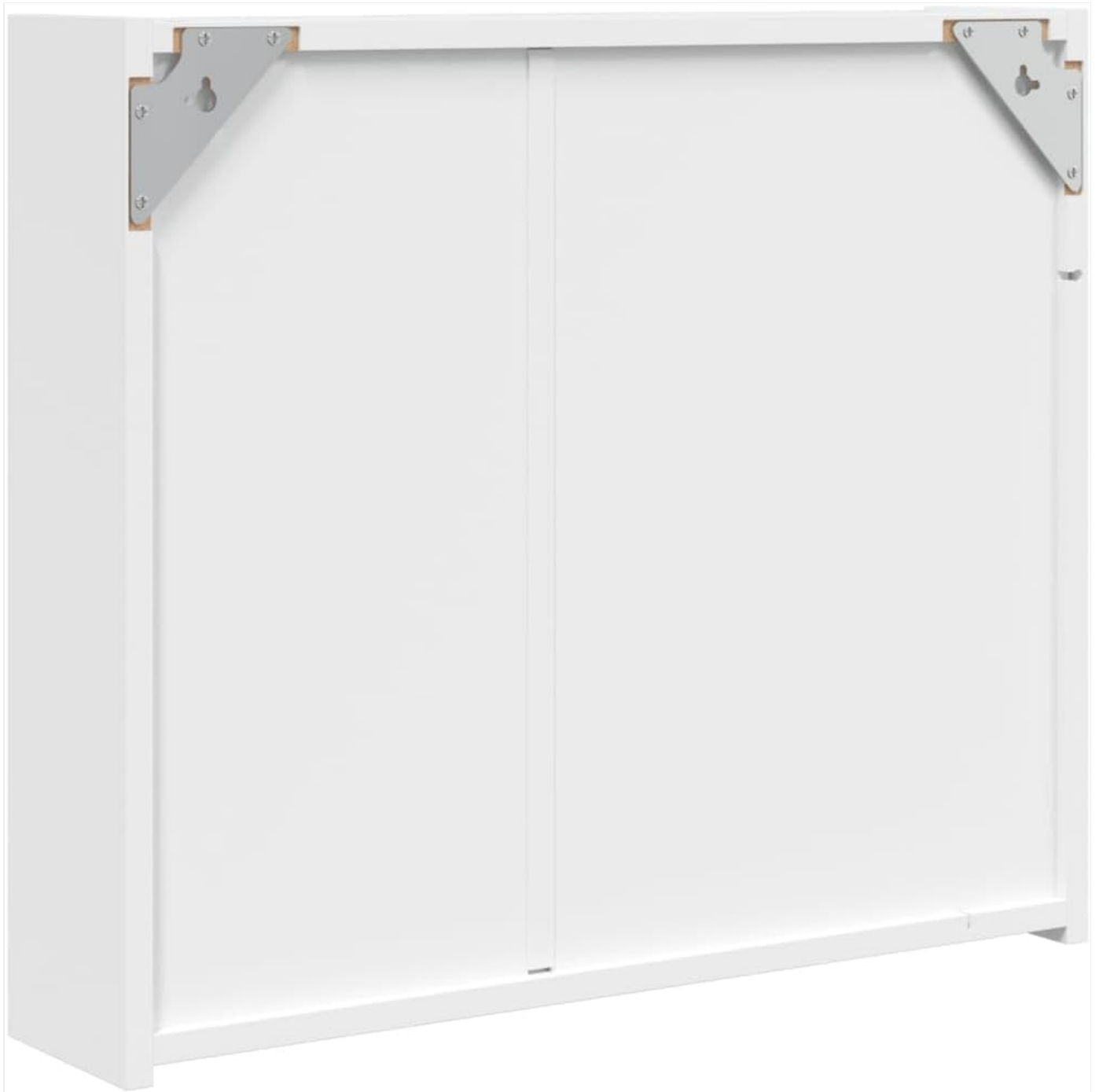
Image: Rear view of the cabinet, showing mounting brackets for wall installation.