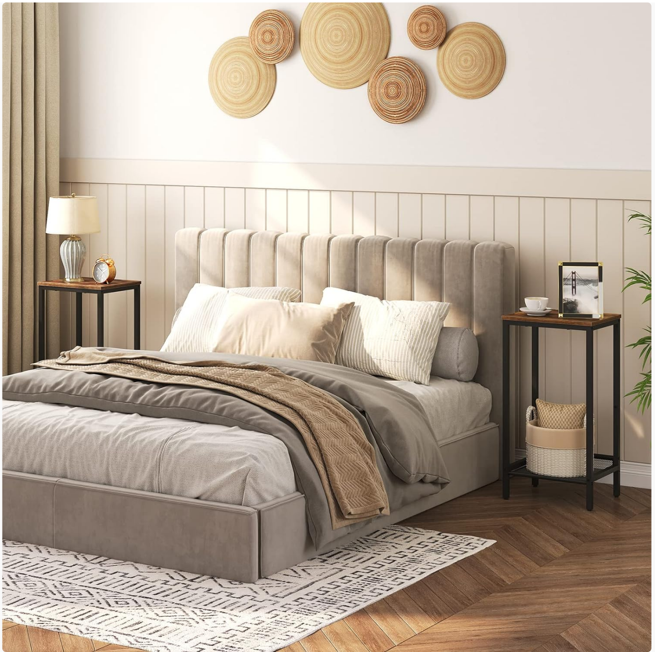
Image: Two tall side tables serving as nightstands beside a bed in a bedroom, highlighting their versatility.