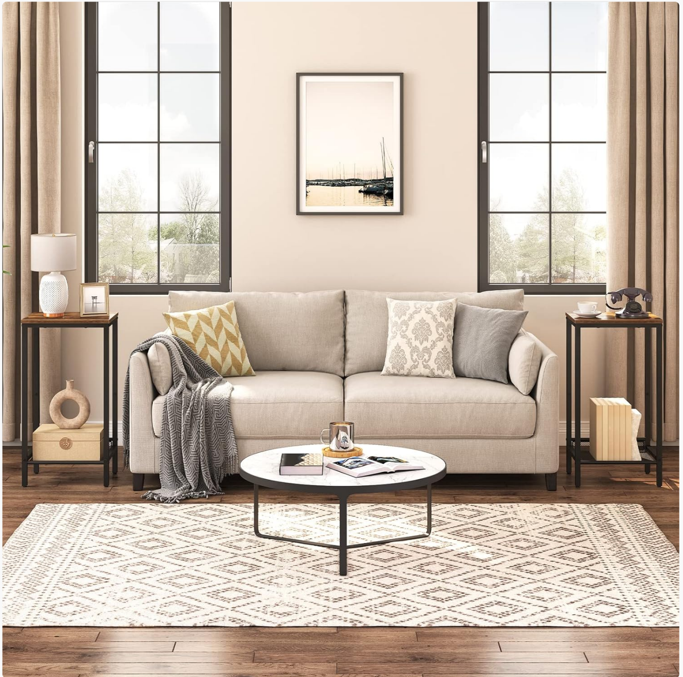
Image: Two tall side tables positioned on either side of a sofa in a living room, demonstrating their practical use as end tables.