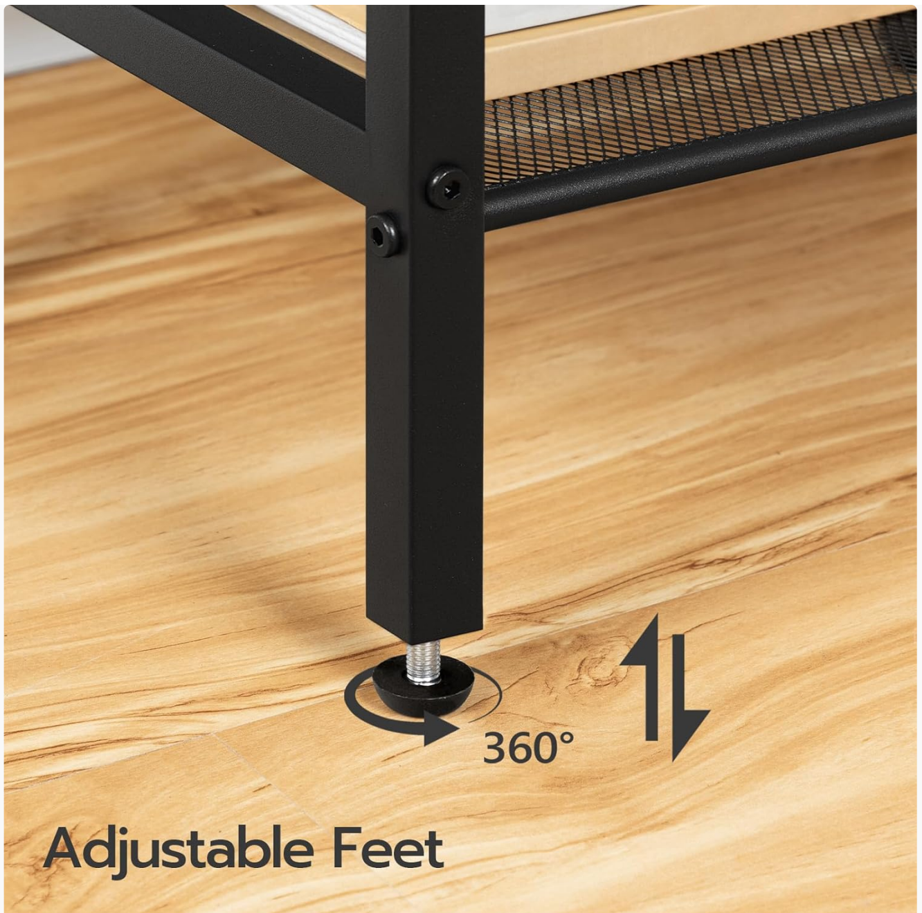
Image: Close-up of the adjustable feet, illustrating their 360-degree rotation for leveling the table on uneven surfaces.

Important: Always refer to the specific diagrams and step-by-step instructions in your physical Assembly Guide for the most accurate and safe assembly process.