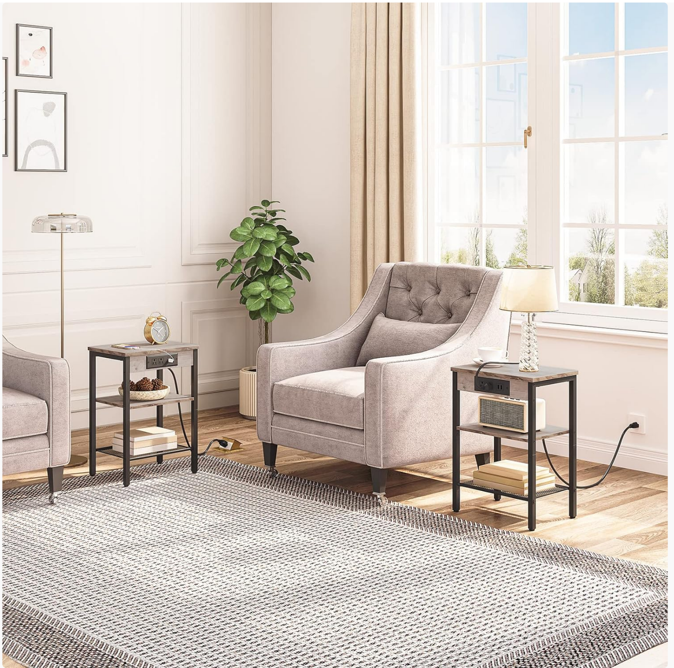
Image: An end table with an integrated charging station placed next to an armchair, showing its utility for charging devices.