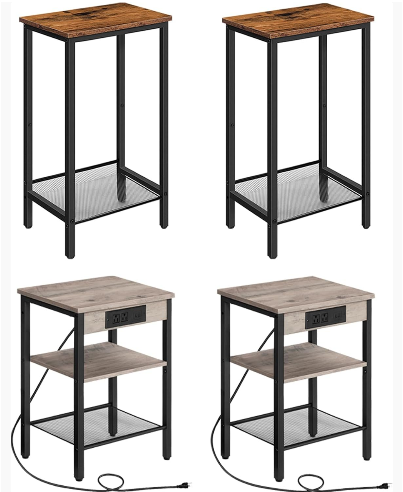
Image: The complete HOOBRO Tall Side Table and End Table Set, showcasing all four tables in their distinct designs.