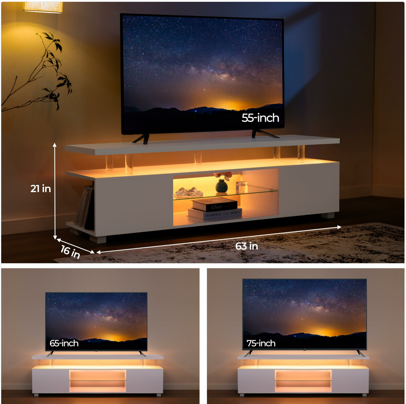
Figure 2: Dimensions of the TV Stand, suitable for TVs up to 75 inches.