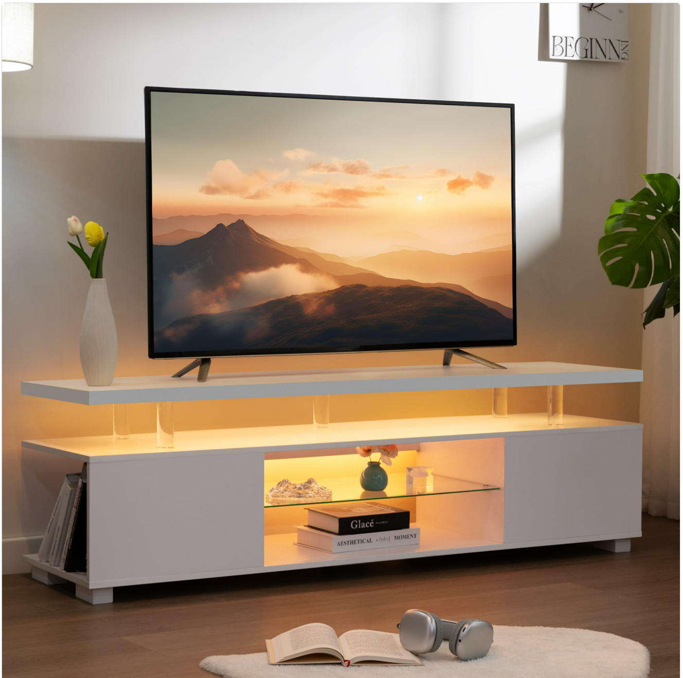
Figure 1: The Cubehom 63-inch White LED TV Stand, showcasing its design and integrated lighting.