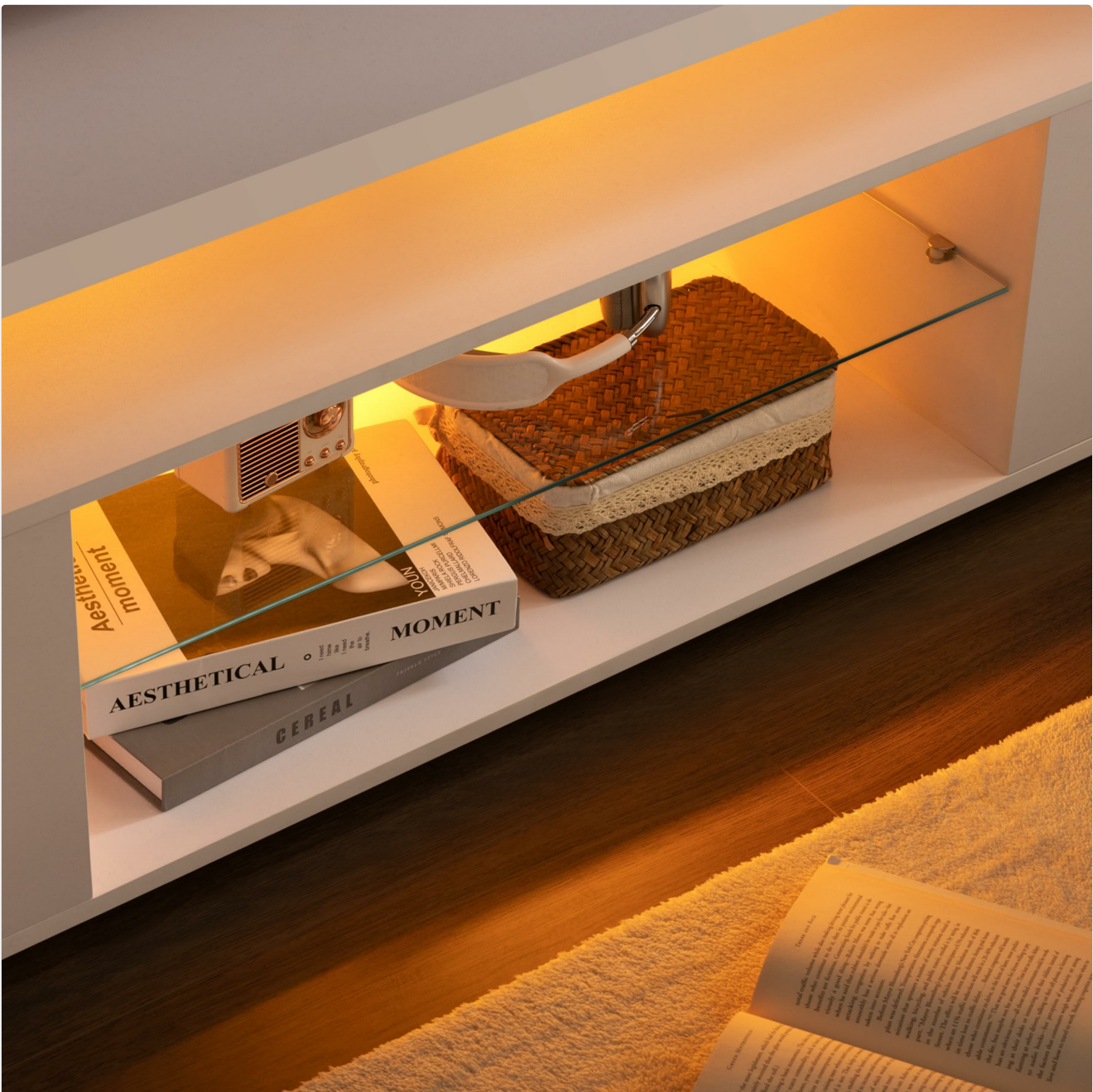
Figure 4: Detail of the central storage area with glass shelf and LED illumination.