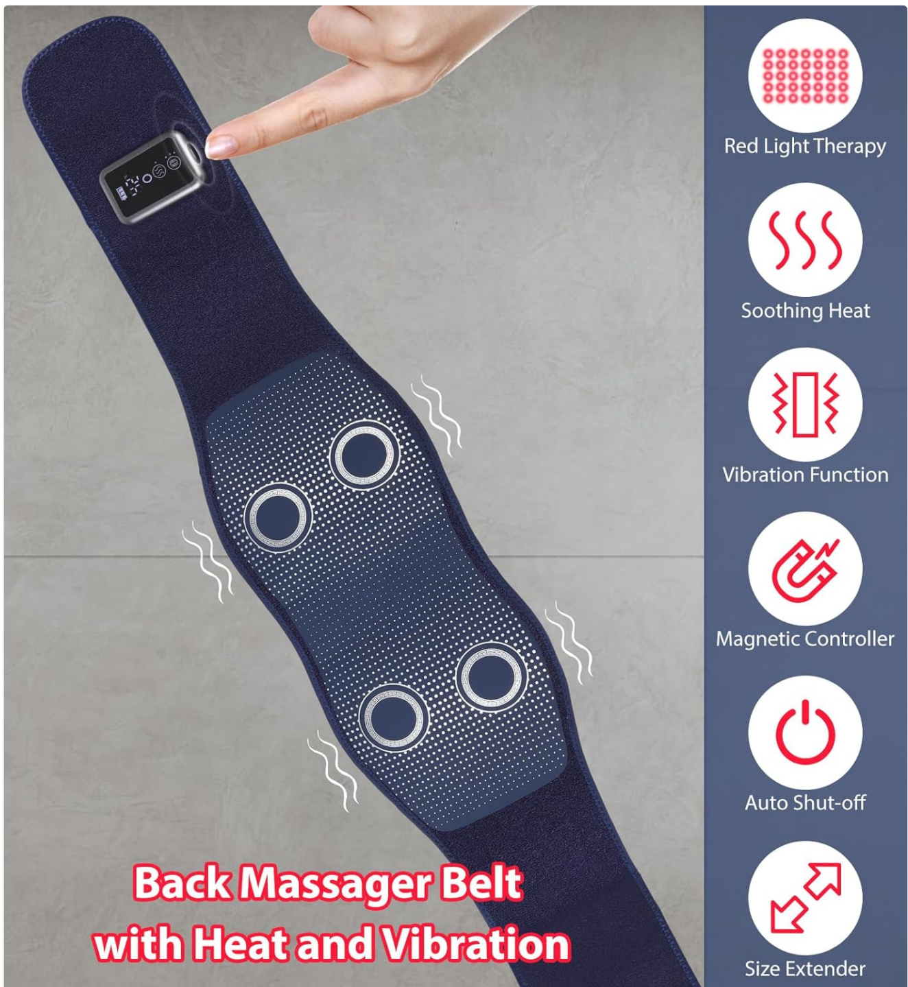
Image: The ADIUPUL Back Massager Belt showing the magnetic controller and key features like red light therapy, heat, vibration, and auto shut-off.