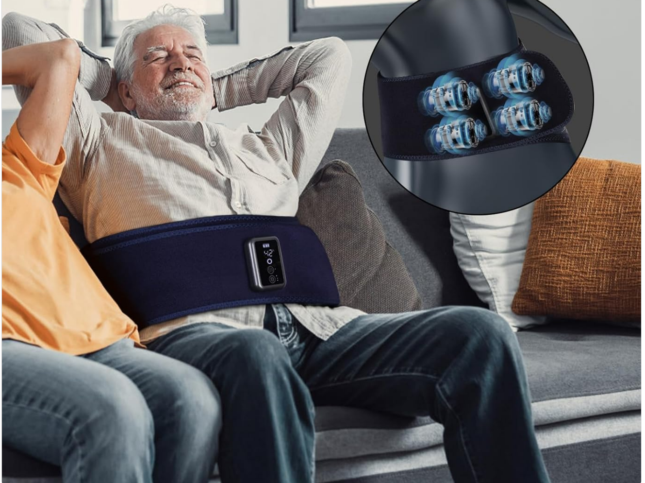
Image: A man relaxing on a couch with the massager belt, illustrating the 4 powerful vibrating motors and 3 vibration modes/intensity levels.