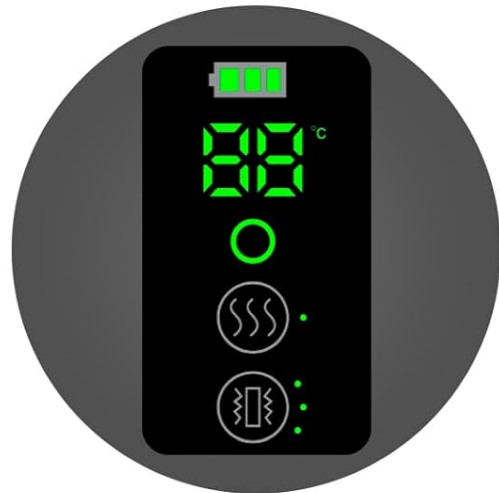
Touch Screen Control

Image: A close-up of the magnetic controller, showing its 5000mAh capacity, 5 strong magnetic buttons, and touch screen control with battery and temperature display.