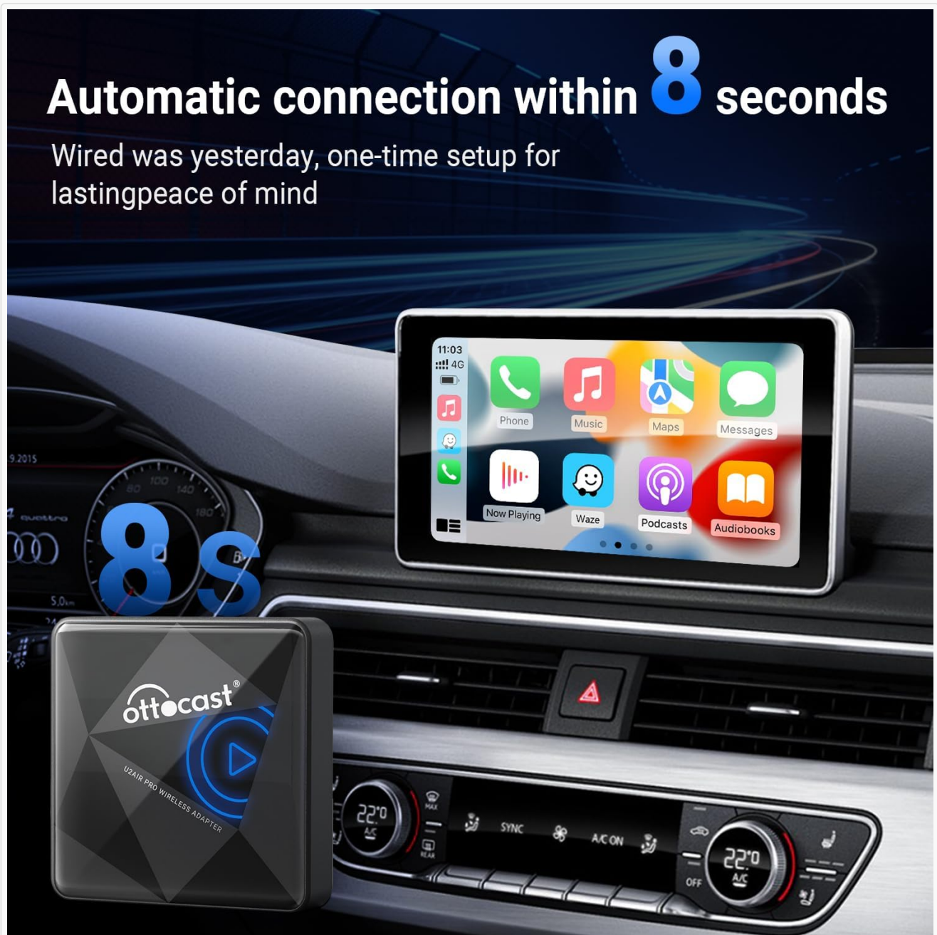
Image: The OTTOCAST U2-AIR Pro adapter positioned in a car, demonstrating its capability for automatic connection to CarPlay within approximately 8 seconds after initial setup.