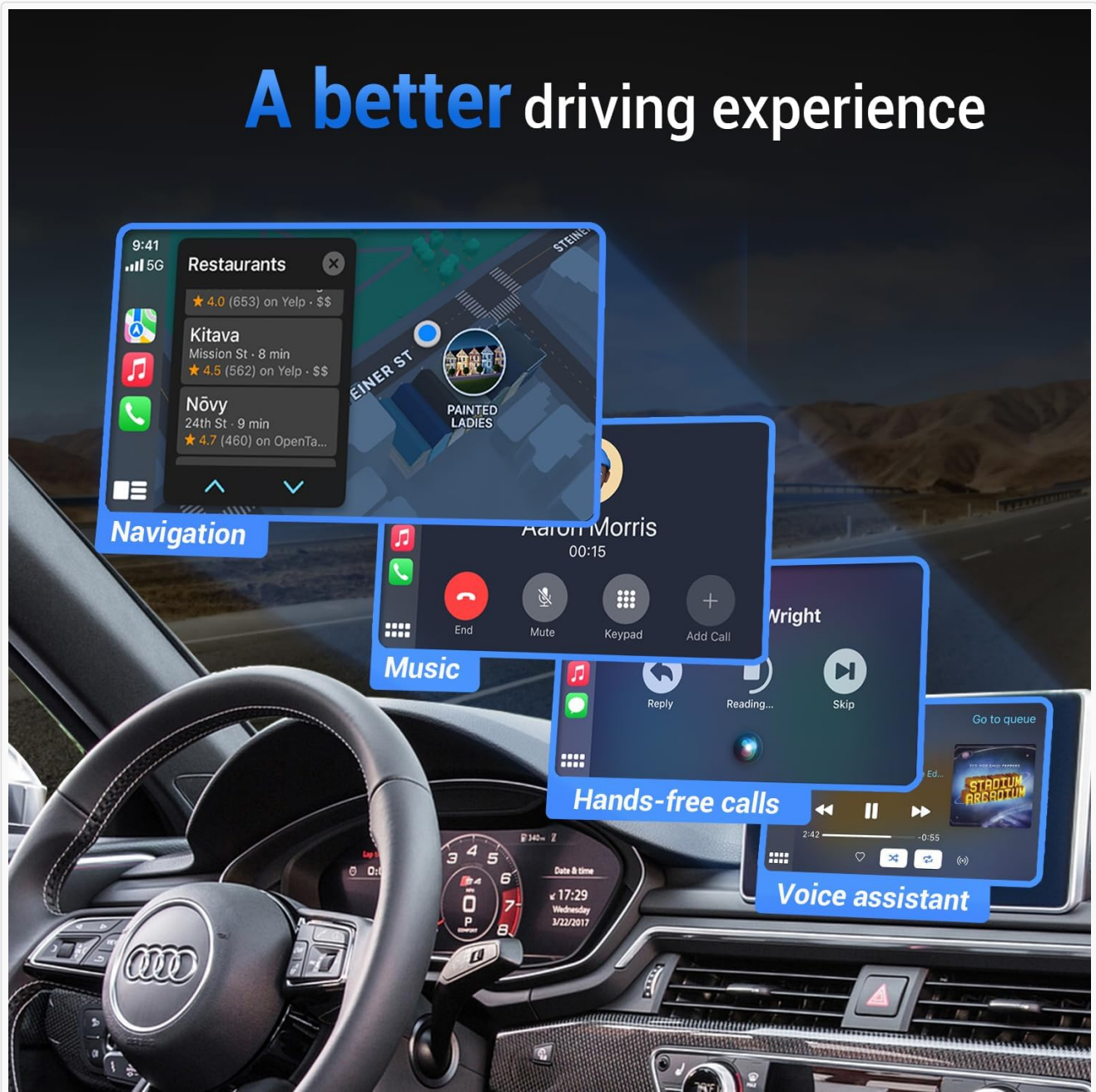
Image: A car's infotainment screen displaying various CarPlay functions, including navigation, music playback, and hands-free calling, illustrating an enhanced driving experience.