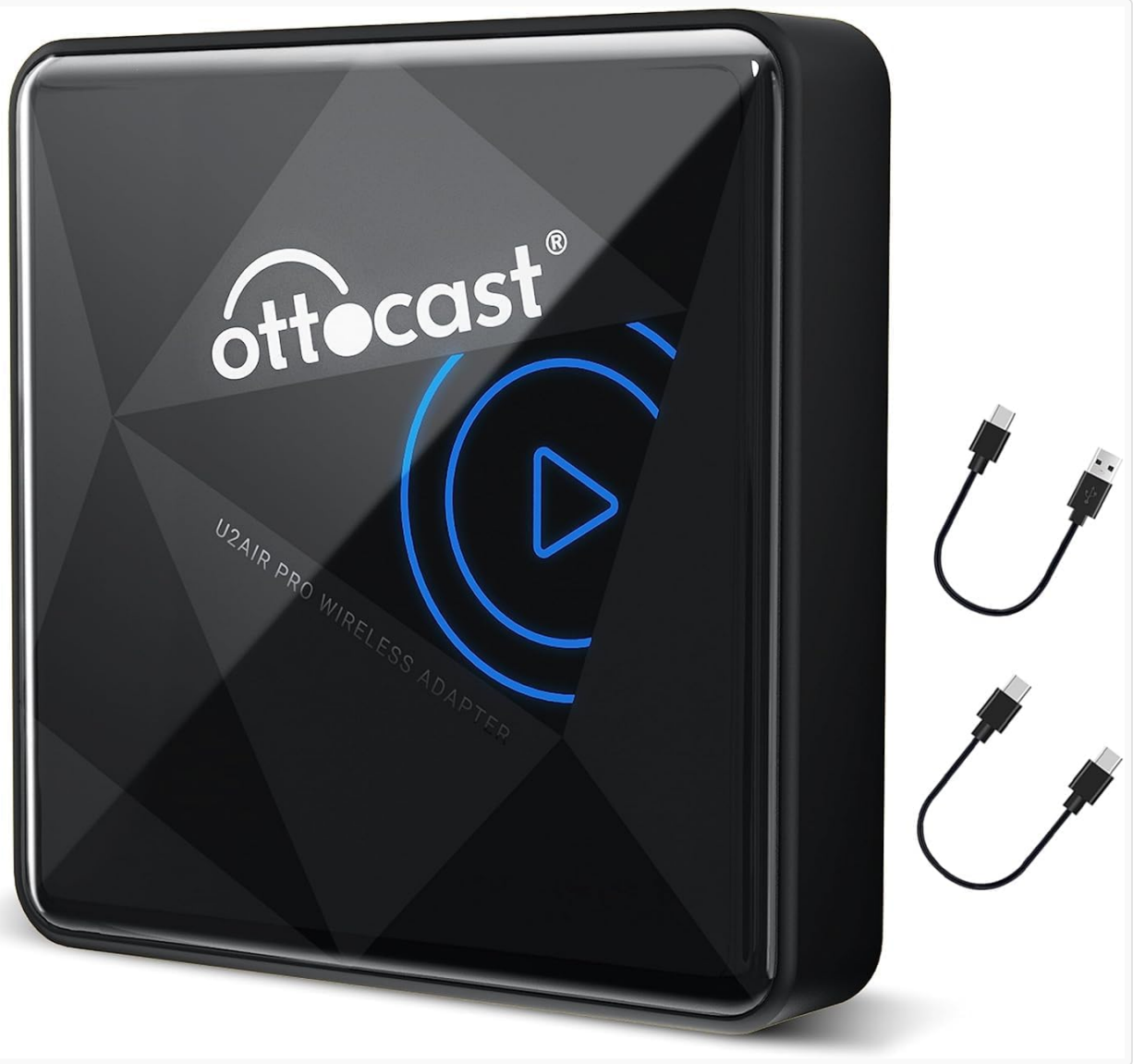
Image: The OTTOCAST U2-AIR Pro adapter shown with its included USB-A to USB-C and USB-C to USB-C cables.