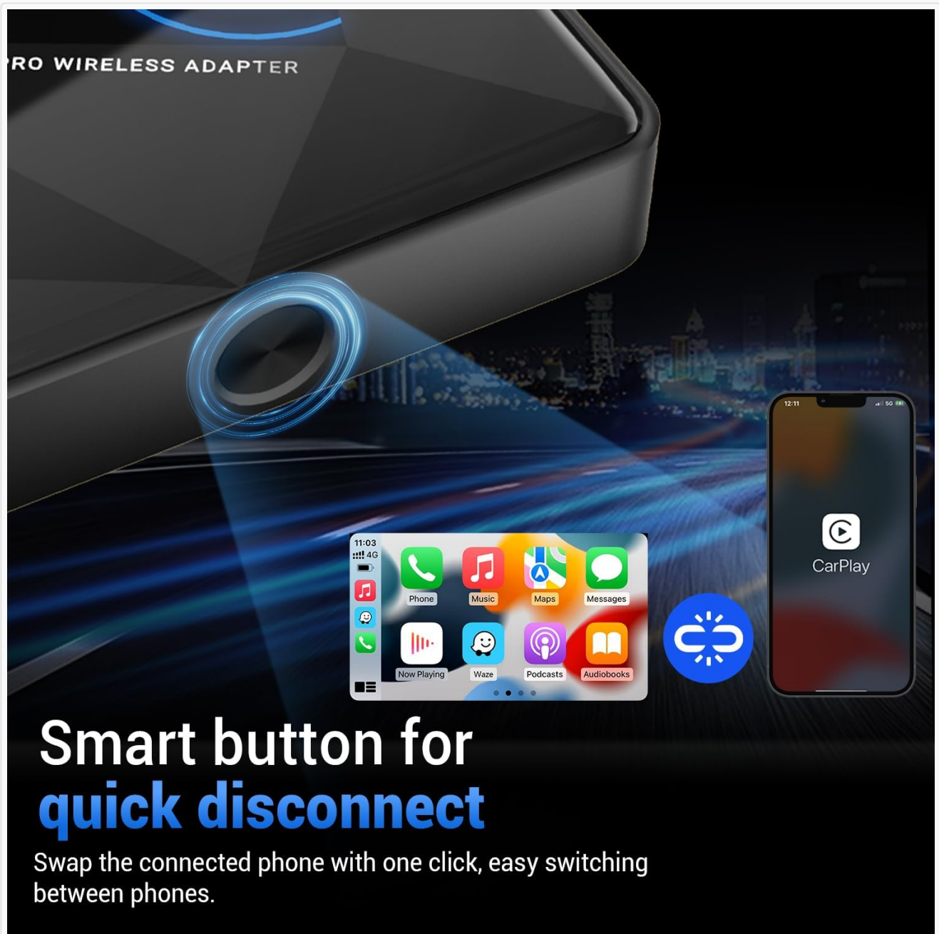
Image: A detailed view of the U2-AIR Pro adapter, emphasizing its smart button designed for quick disconnection and easy switching between connected phones.

connection issues or wish to clear all paired devices.