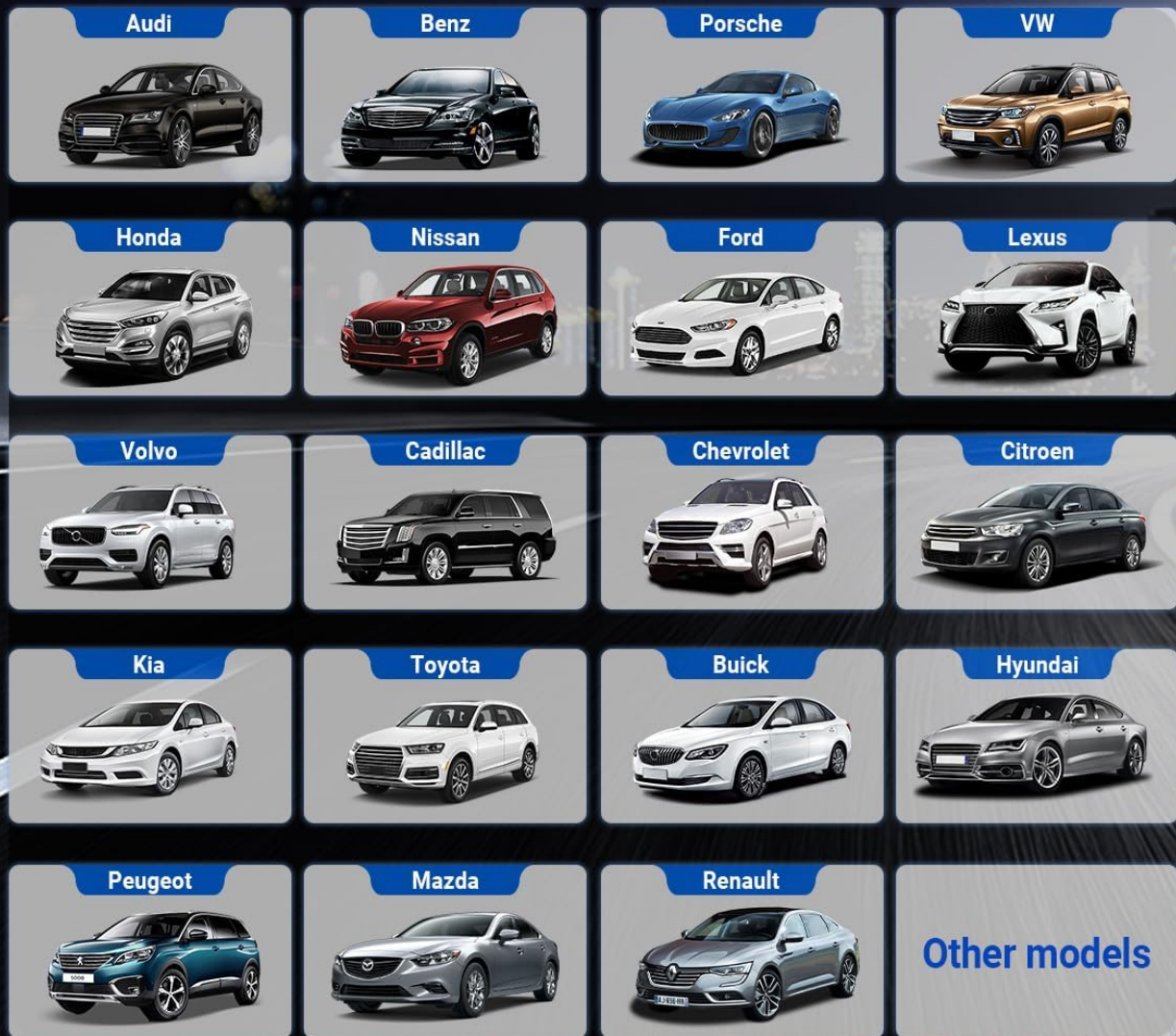
Image: A visual representation of car brands compatible with the U2-AIR Pro adapter, including Audi, Benz, Porsche, VW, Honda, Nissan, Ford, Lexus, Volvo, Cadillac, Chevrolet, Citroen, Kia, Toyota, Buick, Hyundai, Peugeot, Mazda, and Renault.

*Only available for iPhone, iOS 10+ required.