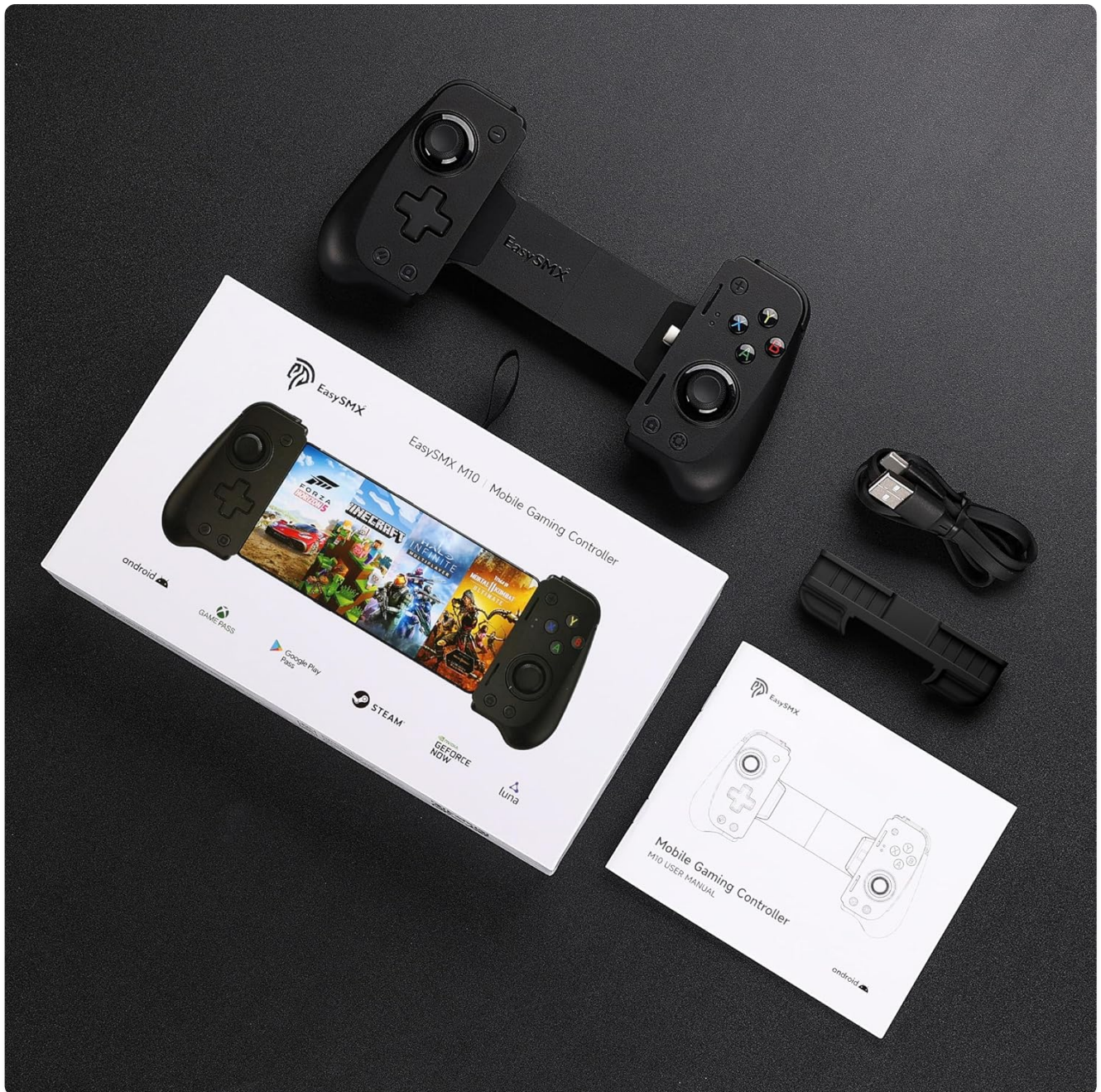
Image: The EasySMX M10 controller, USB-C cable, silicone pad, and user manual laid out on a dark surface.