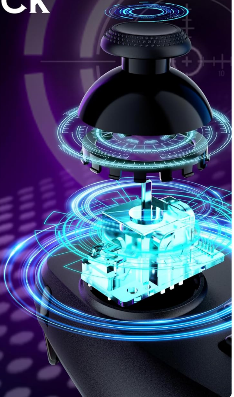
Image: An illustration detailing the internal mechanism of the Dual Hall Effect Joystick, emphasizing its responsive and accurate design.