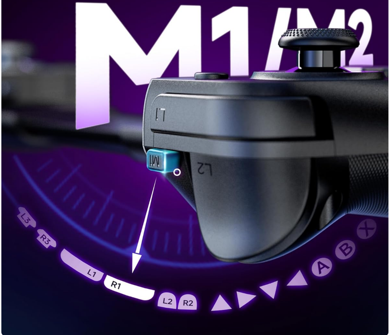
Image: A visual representation of the custom programming function, showing the M1 and M2 buttons on the back of the controller and their potential for mapping various inputs.