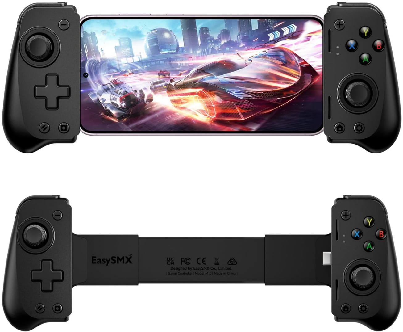
Image: The EasySMX M10 controller with a mobile phone securely inserted, ready for gaming.