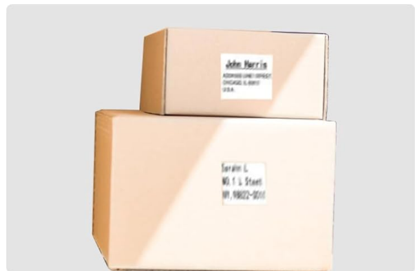
Figure 3.3: Multifunctional Uses. The image showcases practical applications of the printer for various daily tasks.