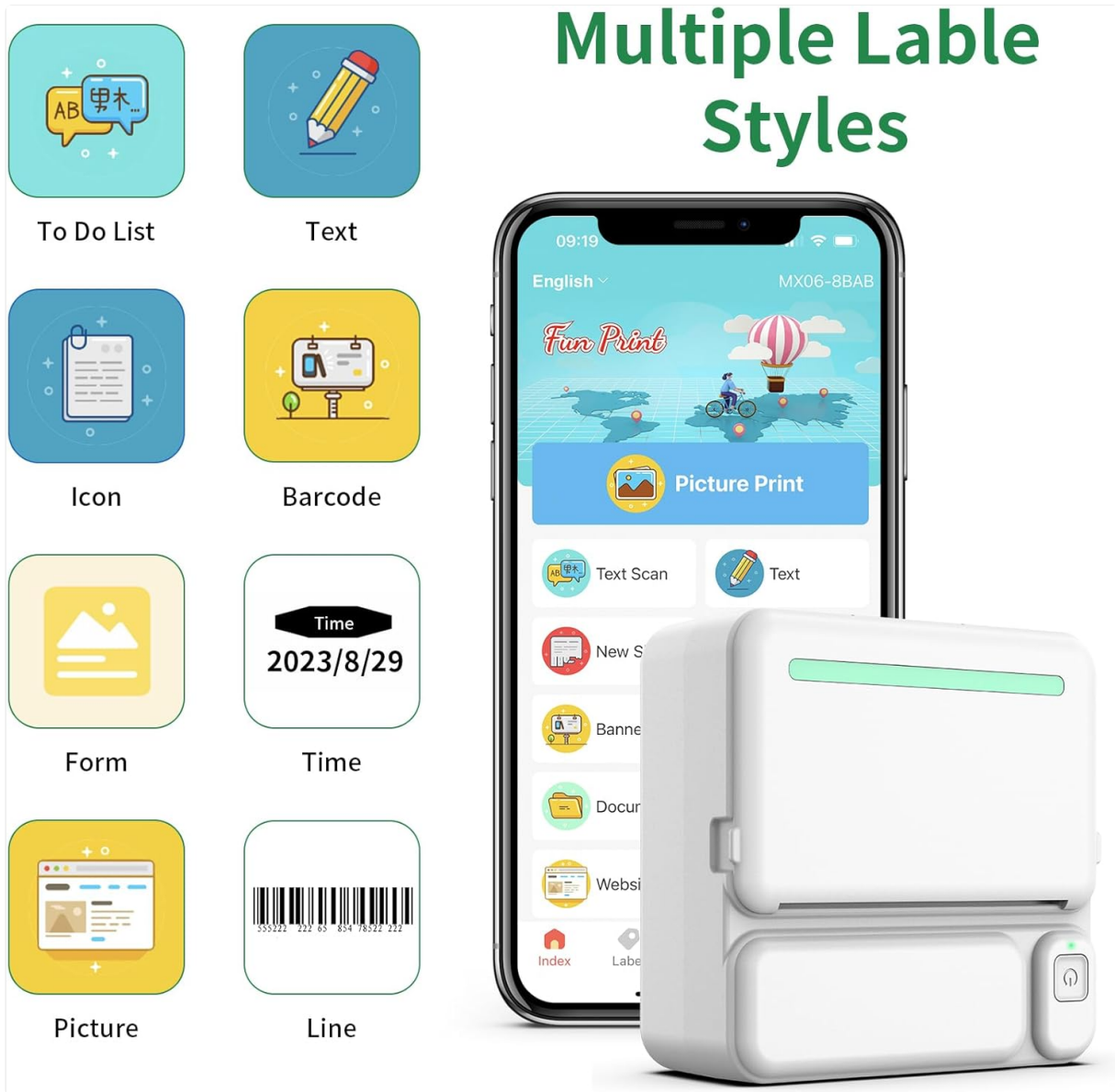
Figure 2.1: 'Fun Print' App Download. The image illustrates the app's availability on both Apple App Store and Google Play Store.