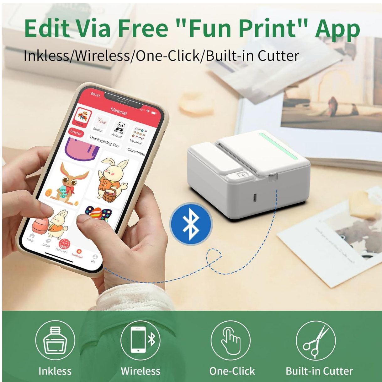
Figure 3.1: 'Fun Print' App Interface. The image highlights the app's features for easy editing and printing.

Inkless/Wireless/One-Click/Built-in Cutter