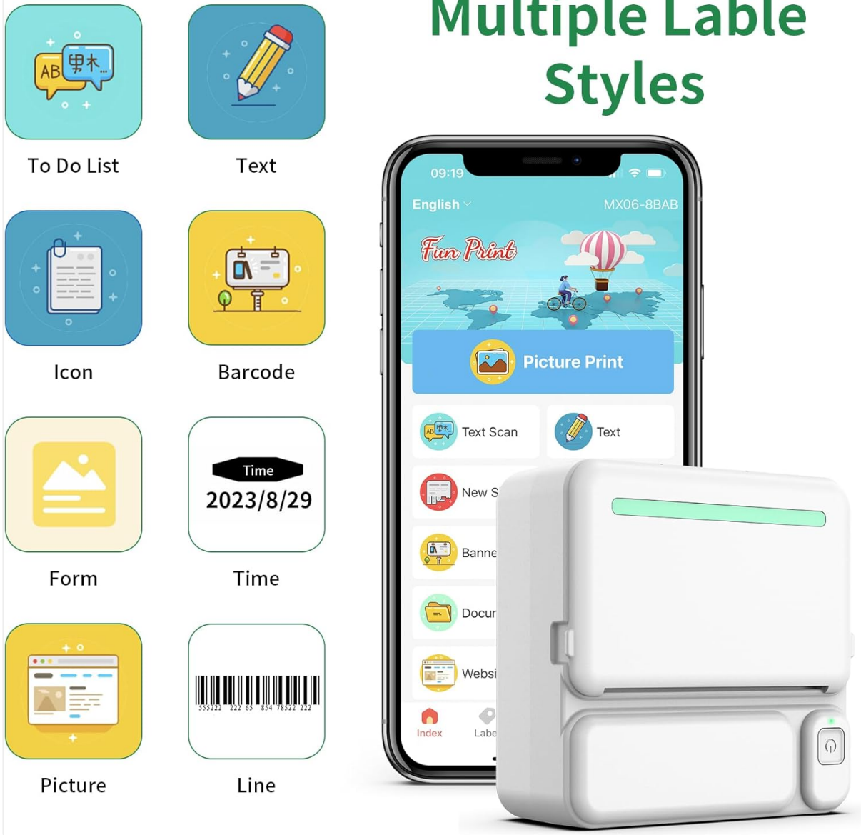
Figure 3.2: Multiple Label Styles. This image demonstrates the diverse range of label and content styles available within the 'Fun Print' application.