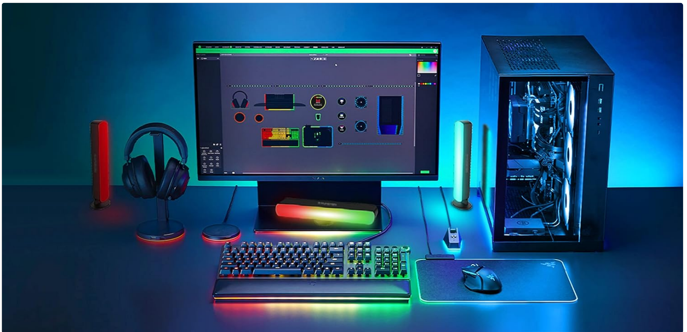
Image: A gaming desk setup featuring the Monster Smart LED Light Bar, demonstrating its seamless integration with Razer Chroma RGB for synchronized lighting effects across multiple devices.