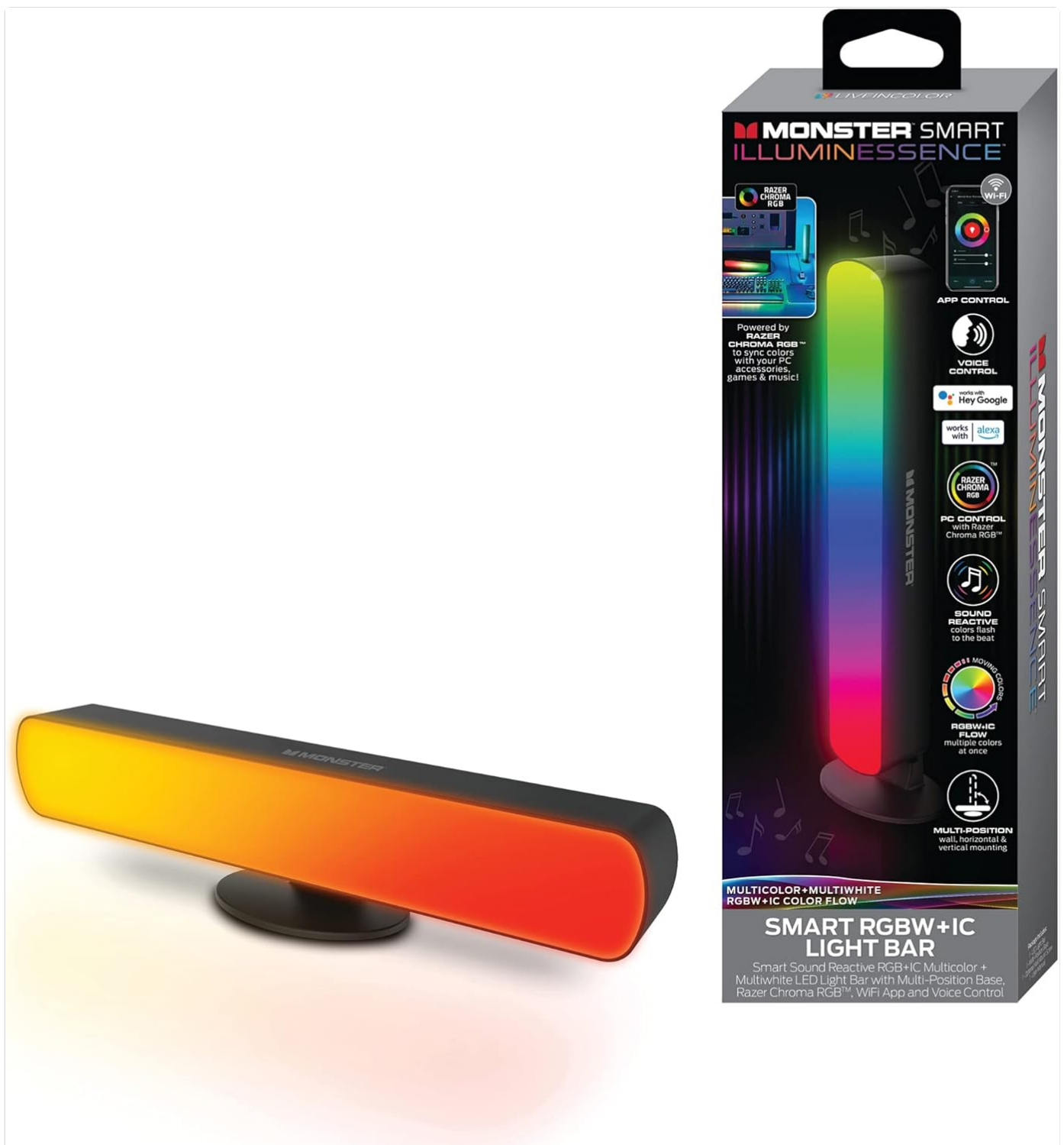
Image: The Monster Smart LED Light Bar shown alongside its retail packaging, highlighting its sleek design and key features.