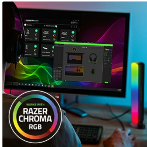
Image: The official Razer Chroma RGB logo, indicating compatibility and integration with the light bar.