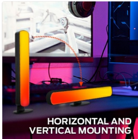
Image: Illustration demonstrating the light bar's flexibility for horizontal or vertical placement using its base.

The Monster Smart LED Light Bar can be mounted in multiple positions to suit your setup. It can stand vertically or lay horizontally using the included multi-position base.