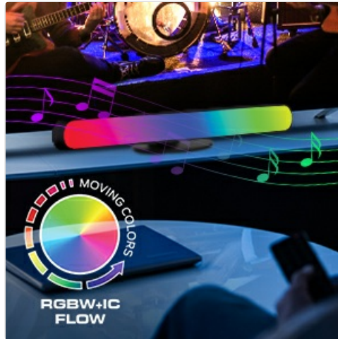
Image: A visual representation of the RGBW+IC Color Flow feature, demonstrating its ability to display multiple colors and dynamic transitions.