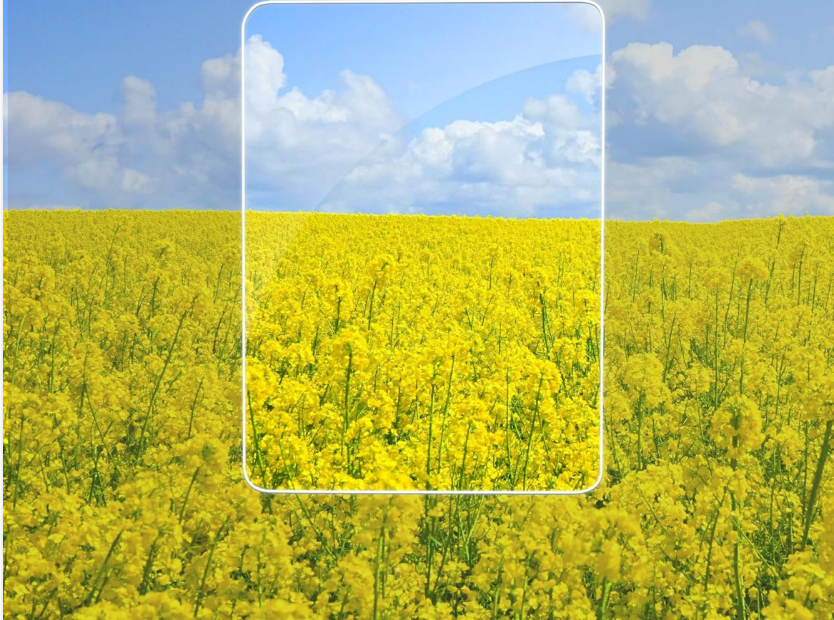
Image: The complete contents of the screen protector package.

Provides 99% visual transparency that preserves crystal clear optical clarity with vibrant colors