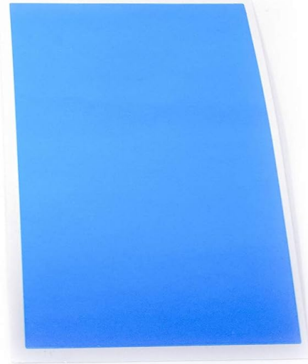
Dust Removing Sticker

Image: Detailed view of the applicator card, microfiber cleaning cloth, and dust removing sticker.