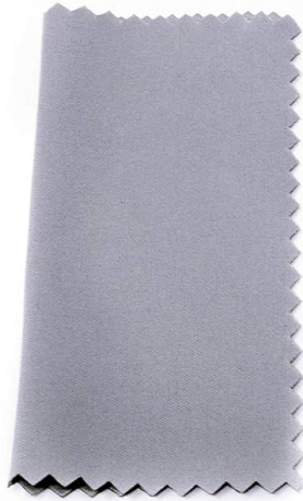
Microfiber Cleaning Cloth