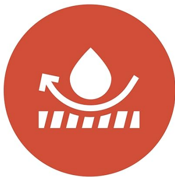
Figure 3: Illustration of the flow-through design for enhanced absorbency.