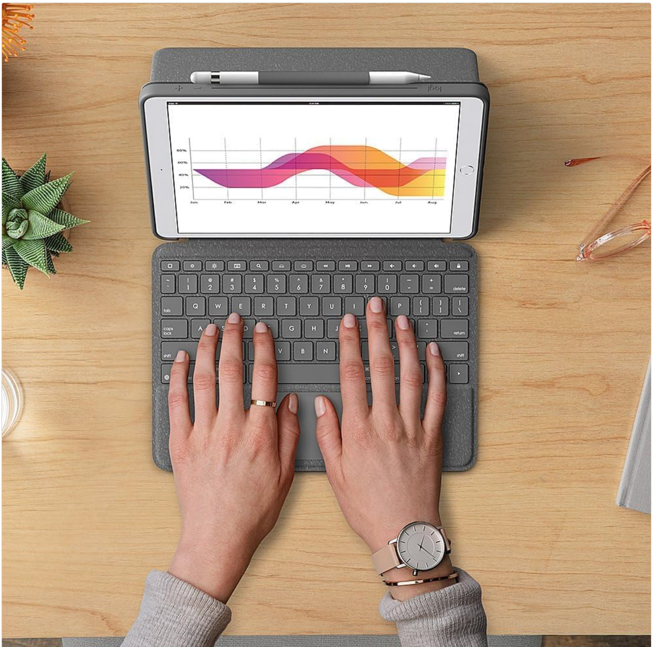
Image: A user's hands positioned over the keyboard and trackpad, demonstrating active use of the Logitech Combo Touch.