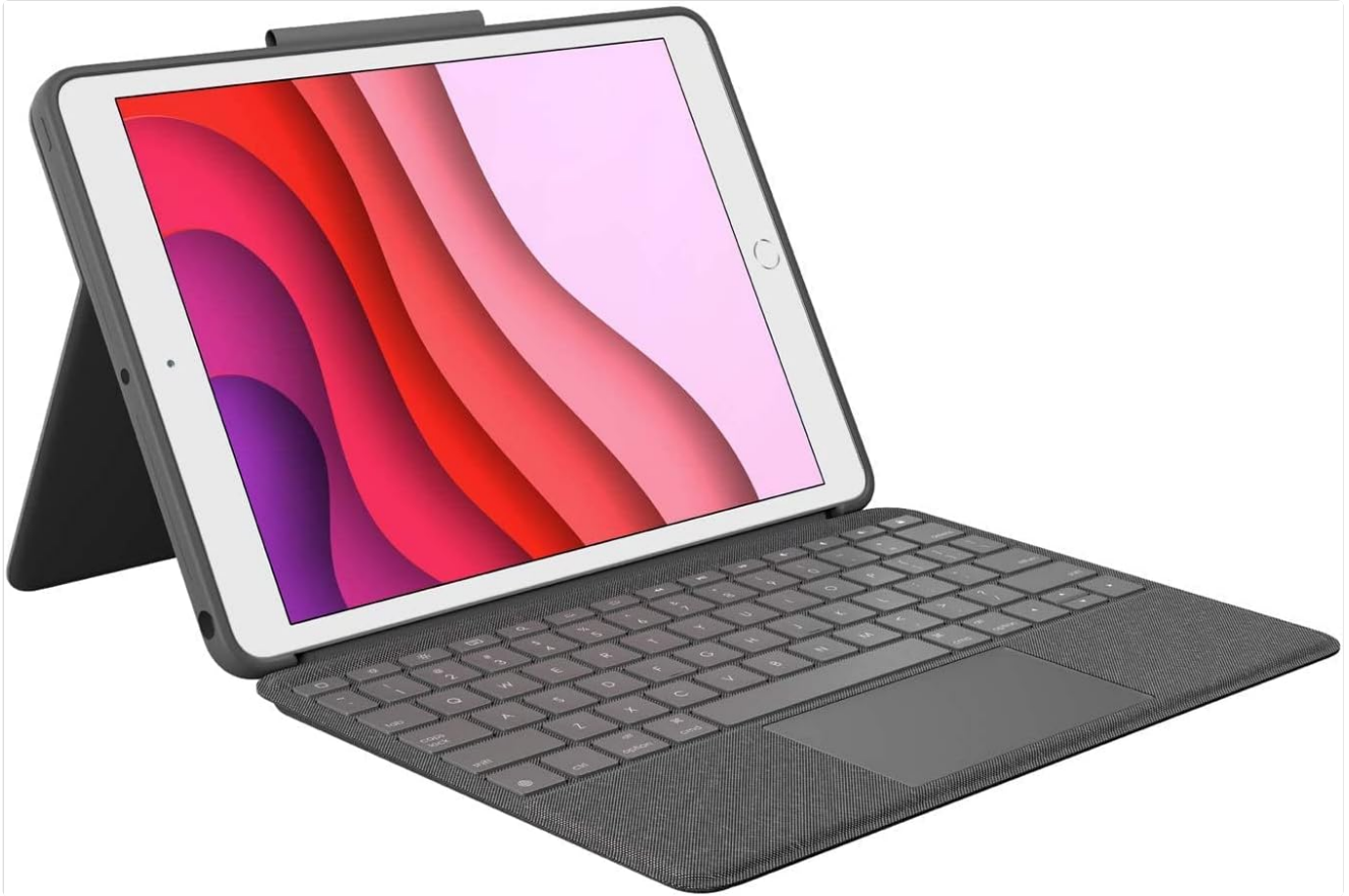
Image: The Logitech Combo Touch case with an iPad securely placed, demonstrating the kickstand functionality for an optimal viewing angle.