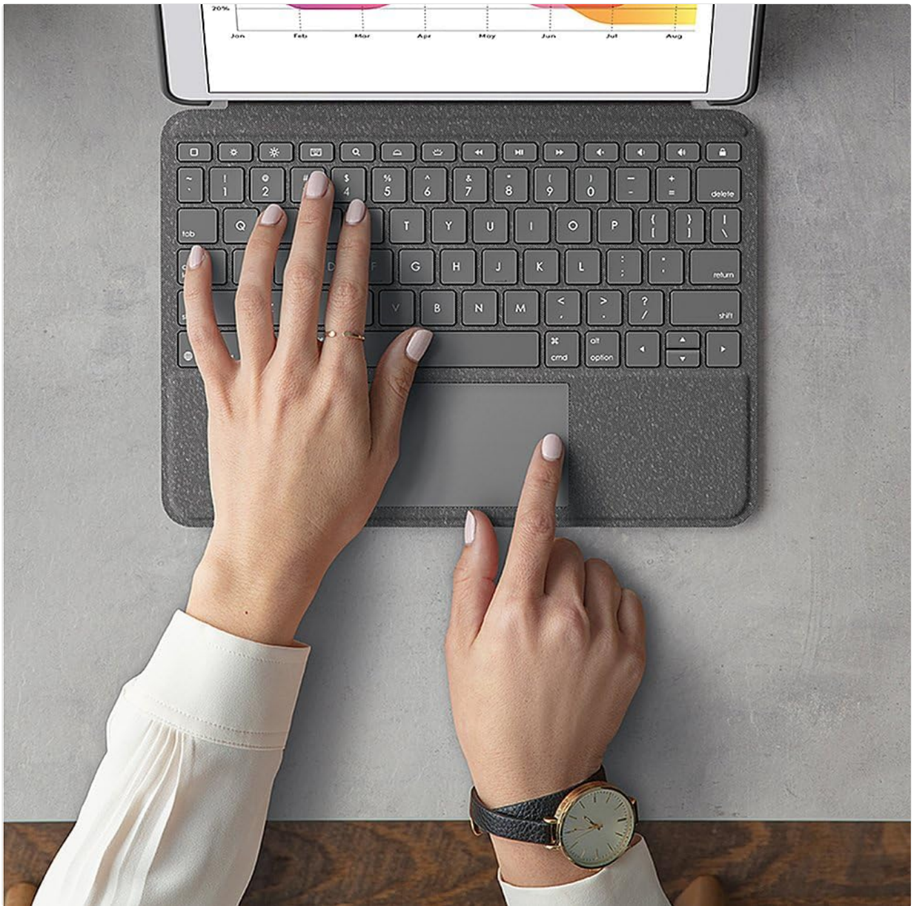
Image: A close-up view of a hand interacting with the integrated trackpad, illustrating its responsive surface.