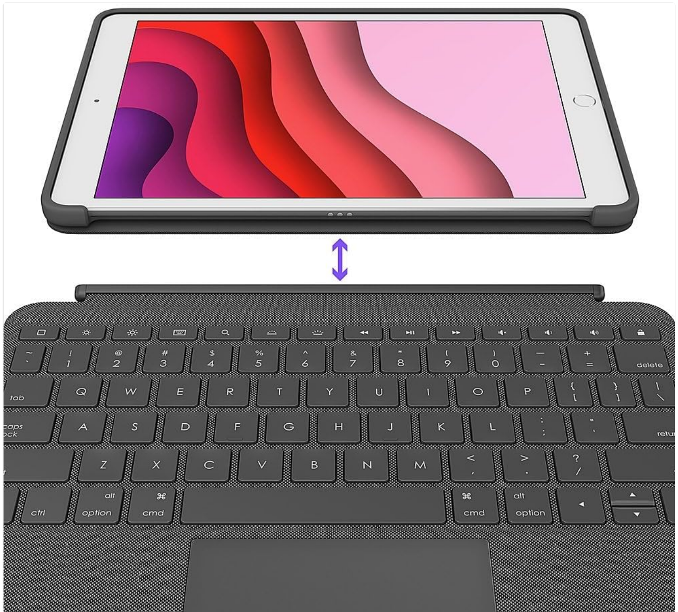
Image: A visual representation of the keyboard detaching from the iPad case, highlighting the magnetic connection point.