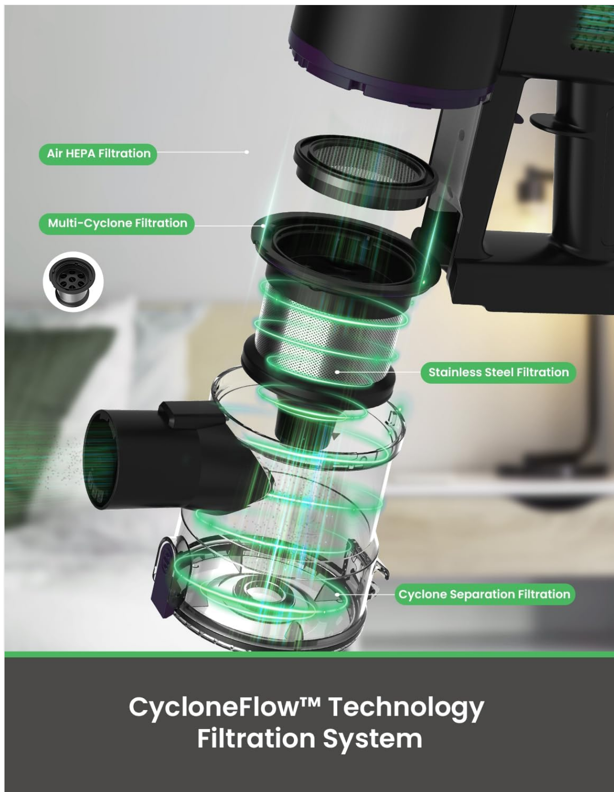
Figure 5.2: Components of the CycloneFlow™ Filtration System.