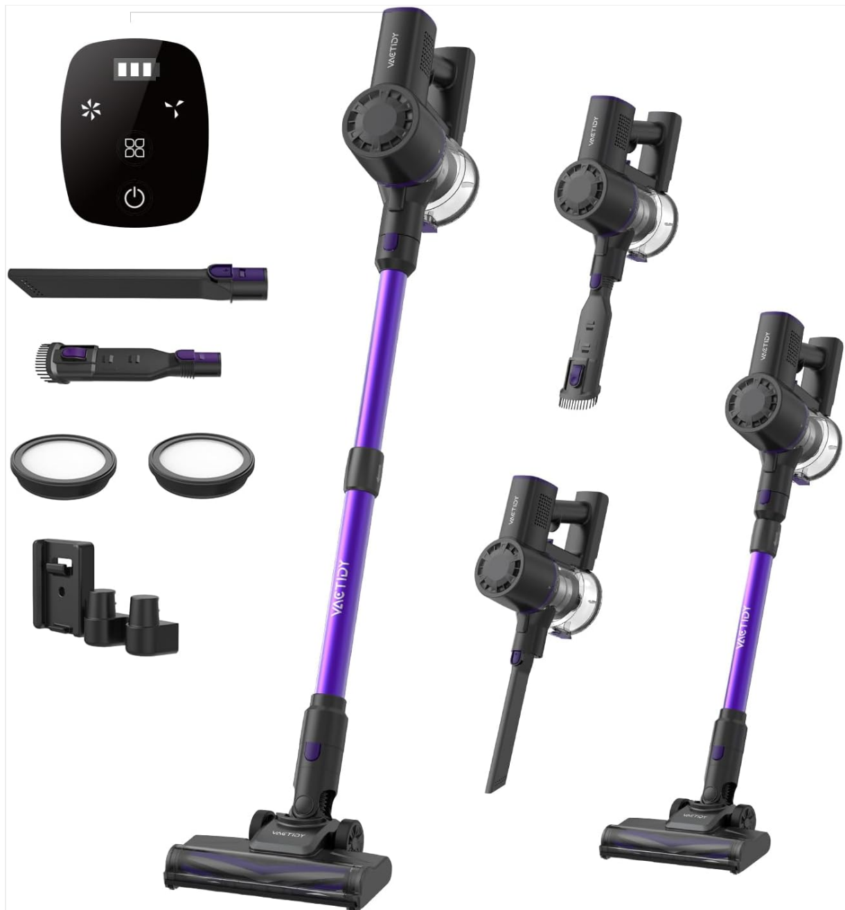
Figure 2.1: Included components of the Vactidy Cordless Vacuum Cleaner.