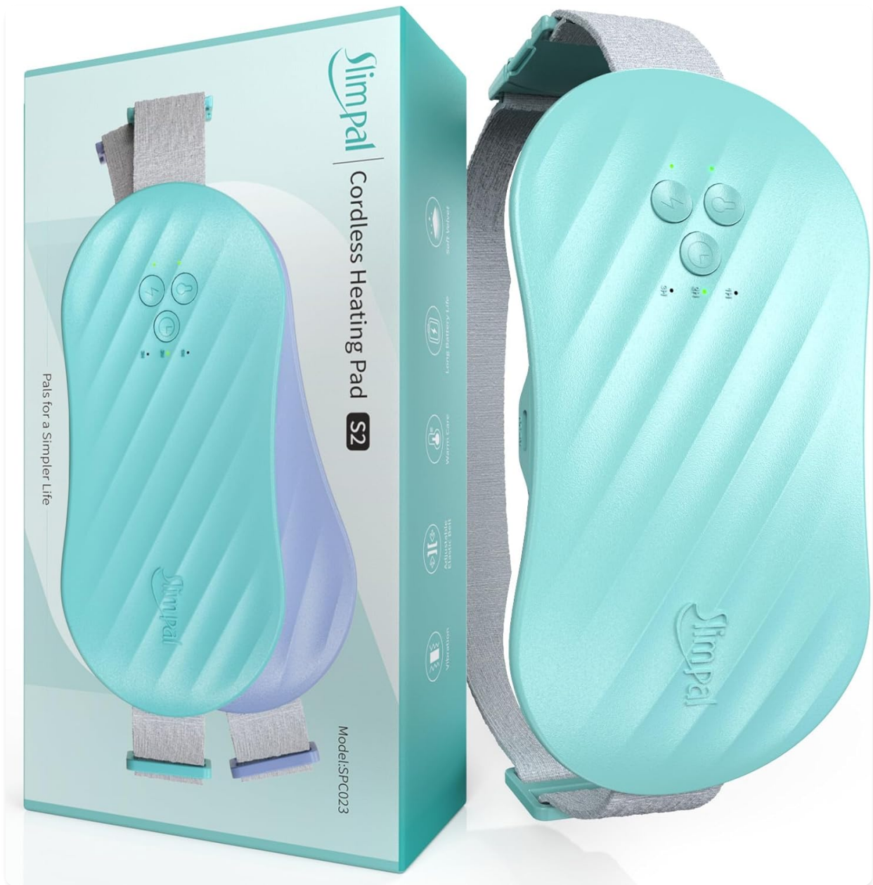
Image: Slimpal AI Portable Heating Pad S2 in Aqua, presented with its retail packaging.