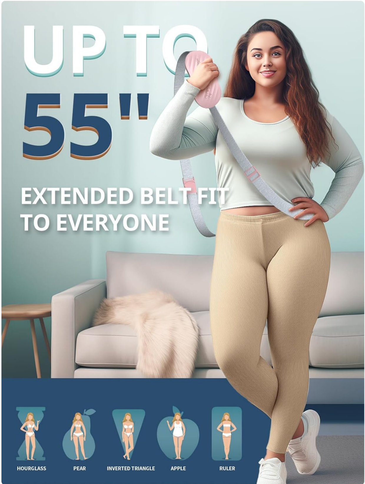
Image: The adjustable belt accommodates various body sizes.