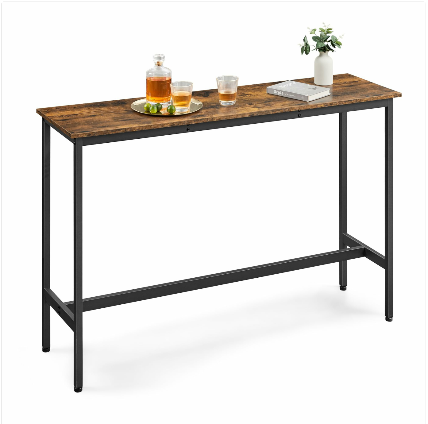
Image: The VASAGLE Bar Table (ULBT140B01) in a rustic brown and ink black finish, shown in a kitchen environment with two bar stools, highlighting its compact design and functionality.