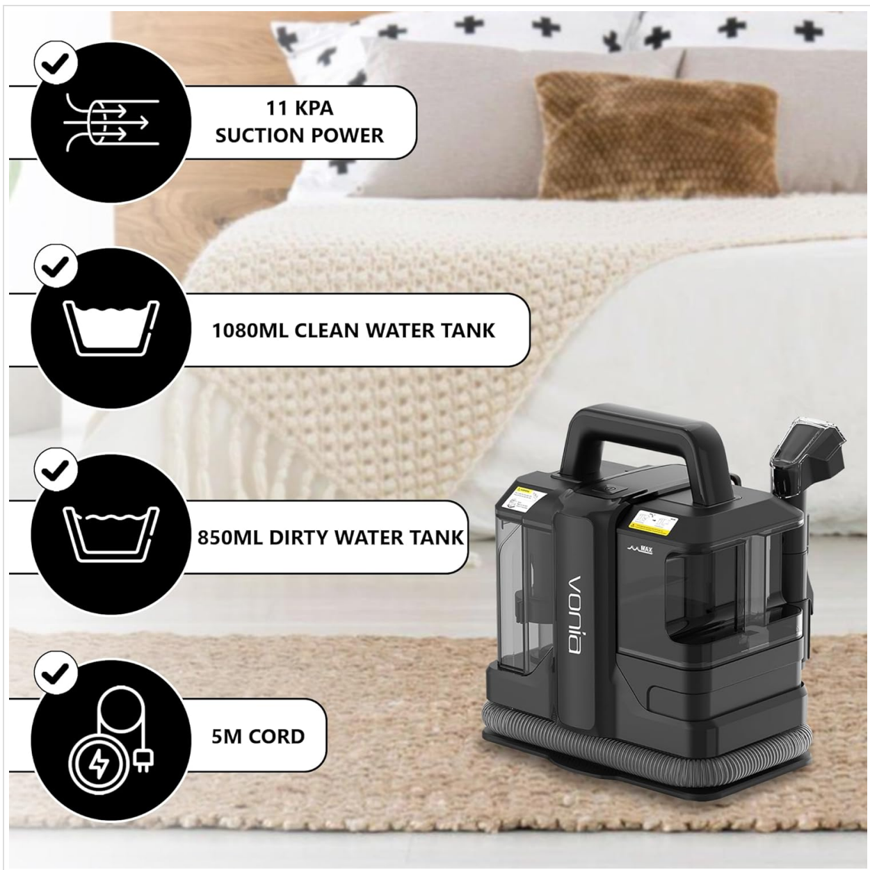
Image 2.3: Detailed specifications including 11 KPa suction power, 1080ml clean water tank capacity, 850ml dirty water tank capacity, and a 5-meter power cord.