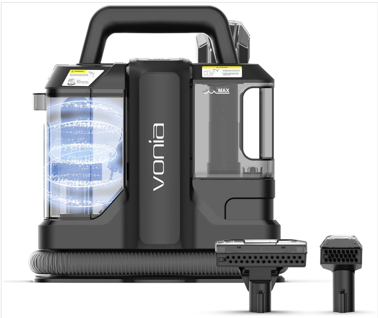
Image 2.1: The Vonia Spot Cleaner VON-TARIJ, showcasing its main unit and two included cleaning attachments.