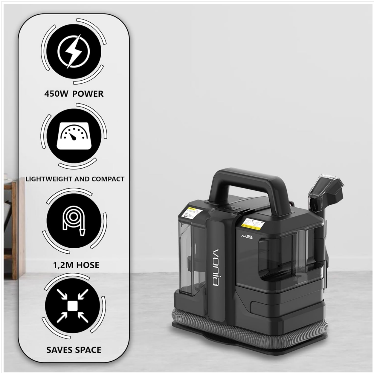
Image 2.2: Visual representation of the cleaner's key attributes: 450W power, lightweight and compact design, 1.2m hose, and space-saving form factor.