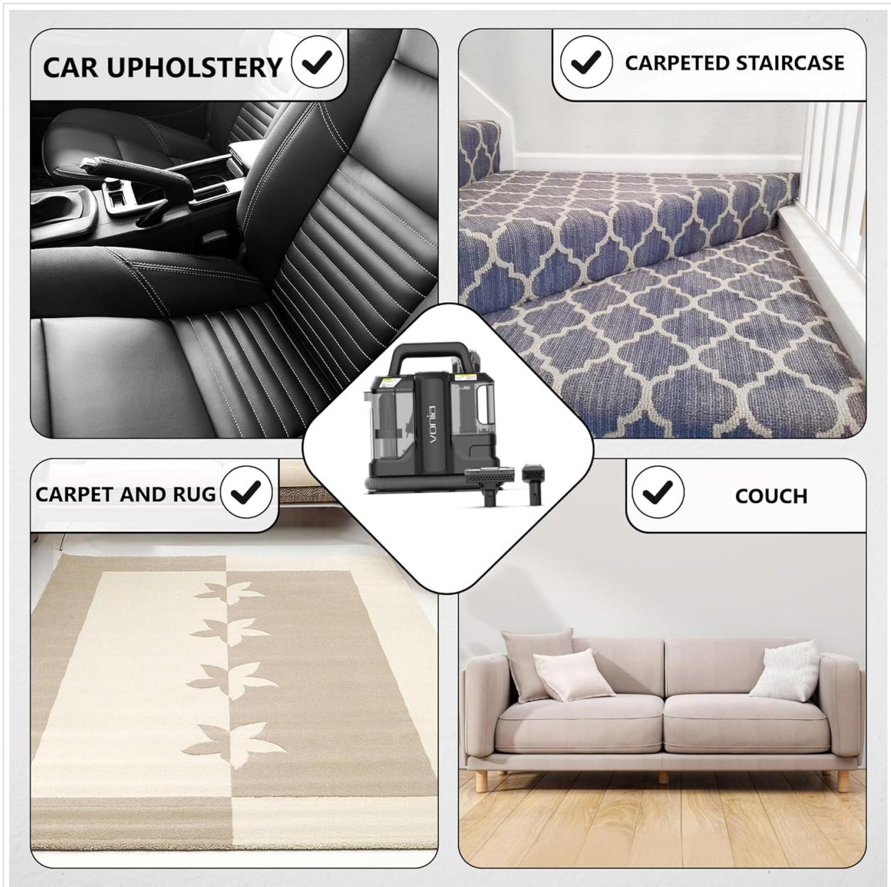
Image 4.2: Examples of surfaces suitable for cleaning with the Vonio Spot Cleaner, including car upholstery, carpeted staircases, area rugs, and couches.