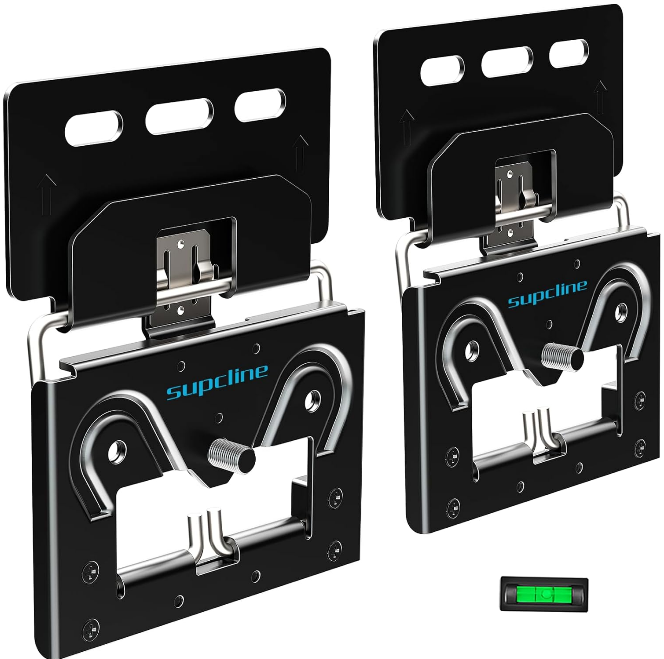
Image: All components of the Supcline Ultra Slim TV Wall Mount, including the two main mounting brackets and the small bubble level for accurate installation.