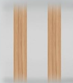
Wood Stud Note: Stud spacing must match the TV VESA